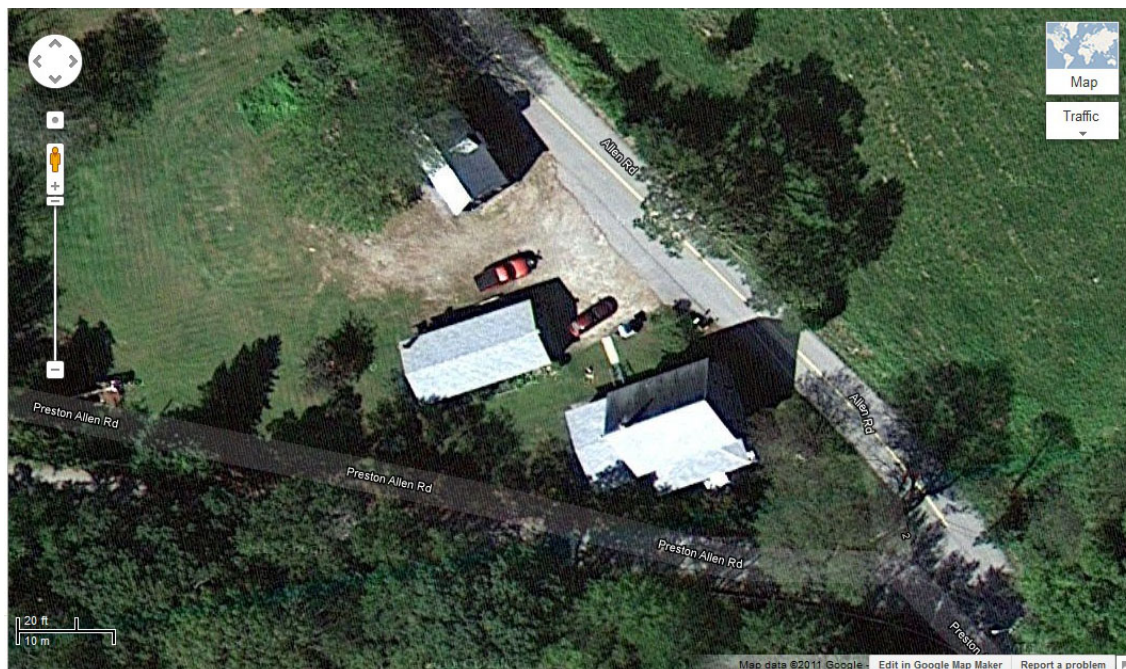
4. North view – aerial “bird’s-eye” map of 7 Allen Road, Lisbon, CT – http://www.bing.com/maps accessed 02/01/2012.