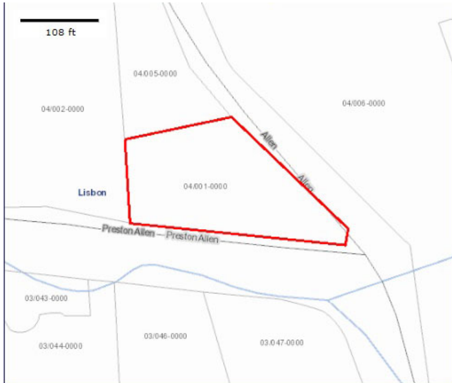
3. Parcel map of 7 Allen Road, Lisbon, CT – from Southeast Connecticut Council of Governments GIS Viewer http://host.appgeo.com/sccog/