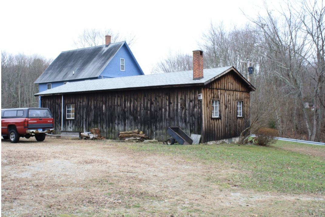
11. West corner of summer kitchen/garage, camera facing east. A portion of the main house is visible.