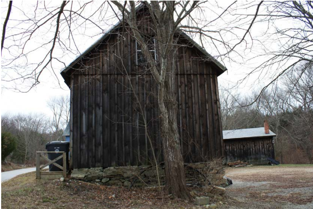
9. North gable-end of barn, camera facing southeast. A portion of the summer kitchen/garage is visible at the right rear.