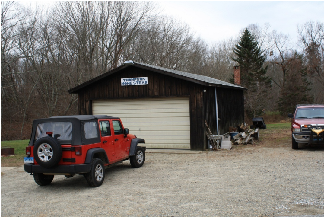
10. East gable-end of the summer kitchen/garage, camera facing west.