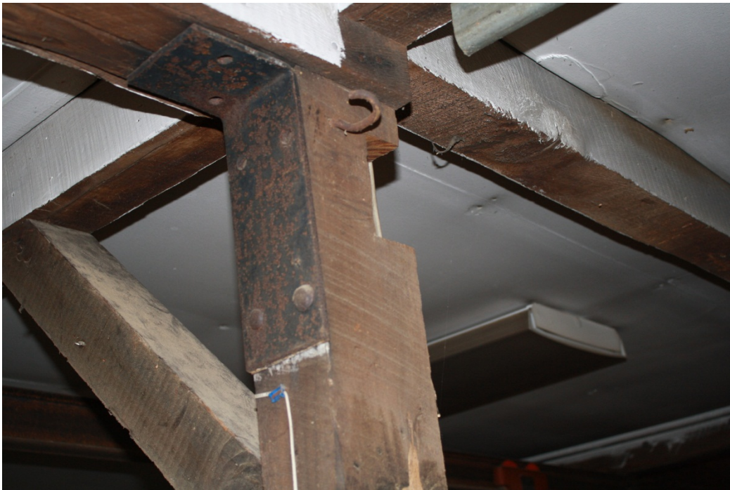
16. Barn interior view, detail of middle bent and L-brace on the first level, camera facing northwest.