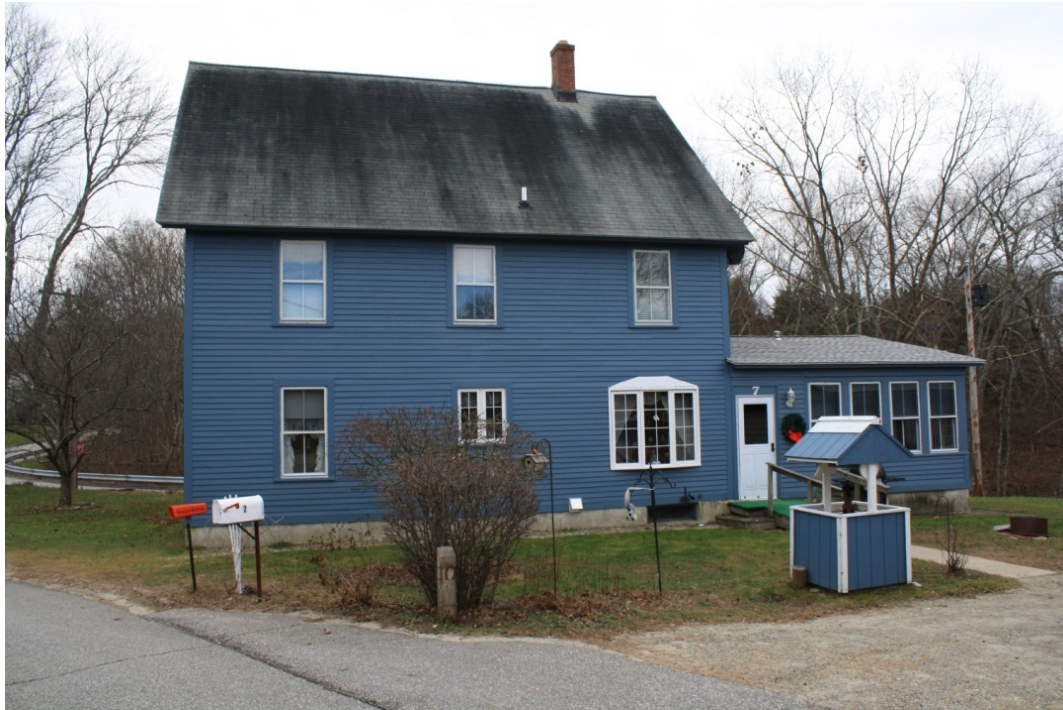
13. Northwest eave-side of house, camera facing southeast, well at right front.