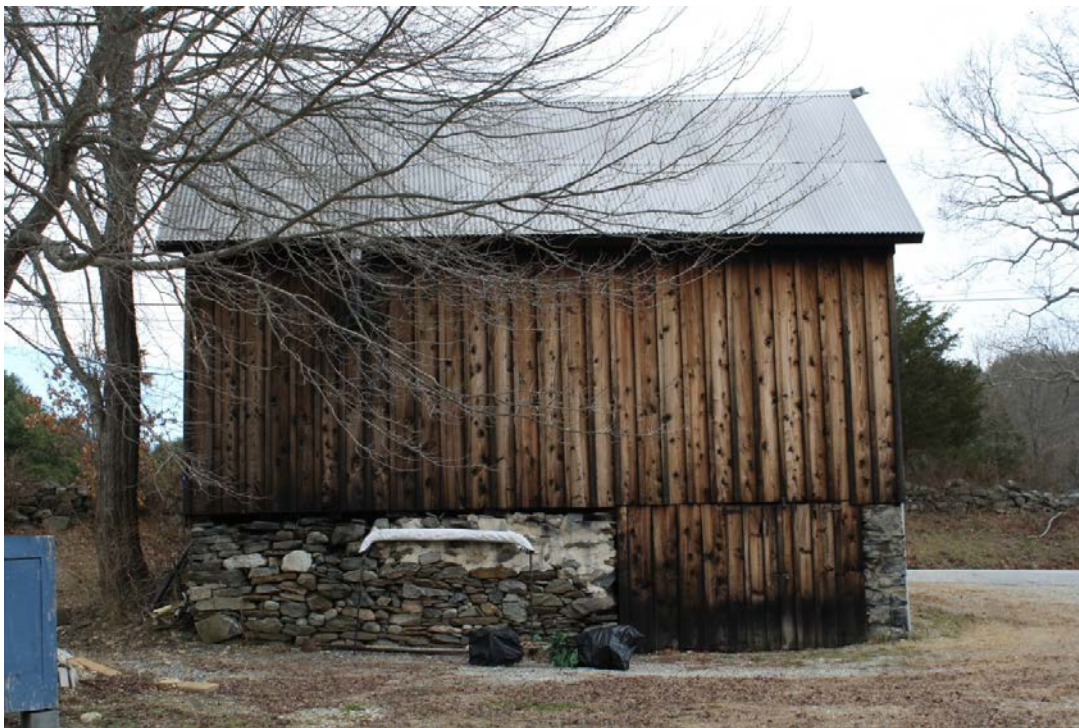
8. West eave-side of barn, camera facing northeast.