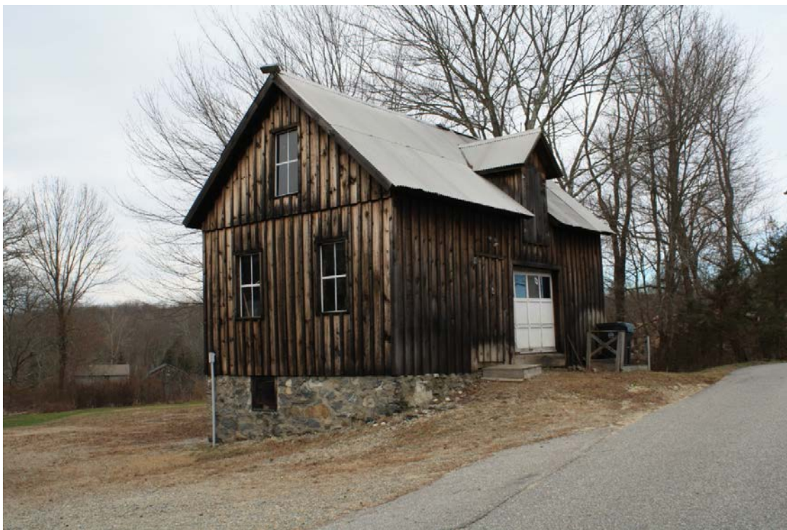
6. Southeast corner of barn, camera facing west.