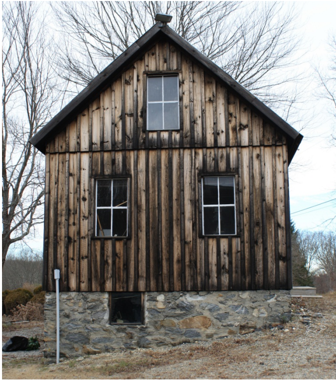
7. South gable-end of barn, camera facing northwest.