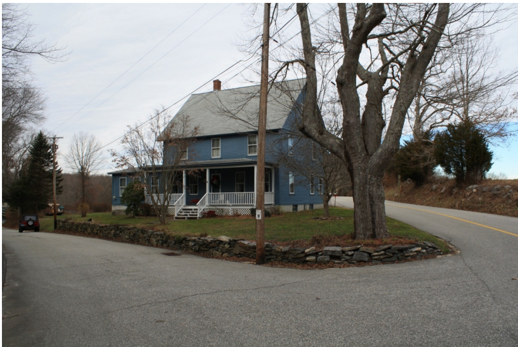
14. Main southeast façade of house, camera facing northwest.