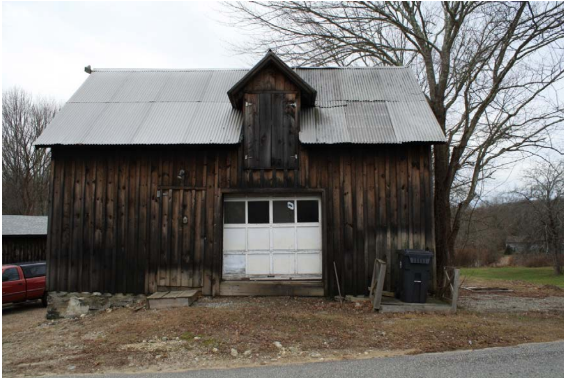
5. Main northeast-eave façade of barn, camera facing southwest.