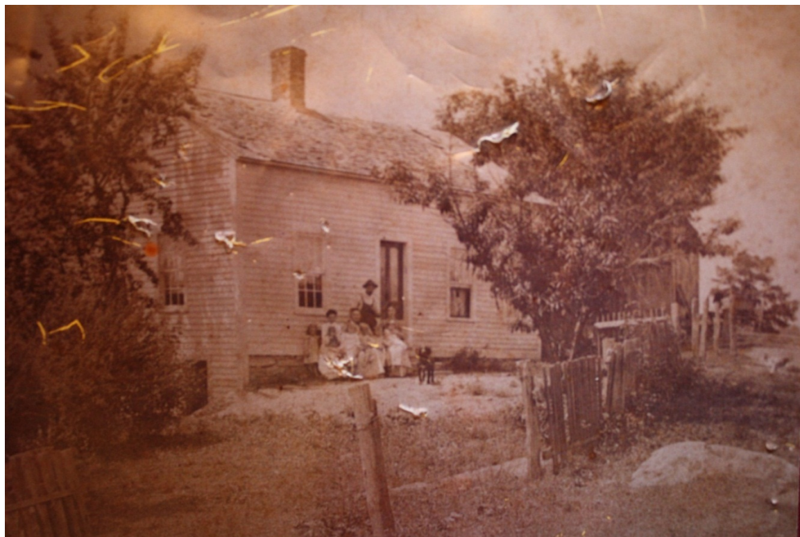
2. Historic photo of original house and workshop barn (to the right), camera facing northwest.