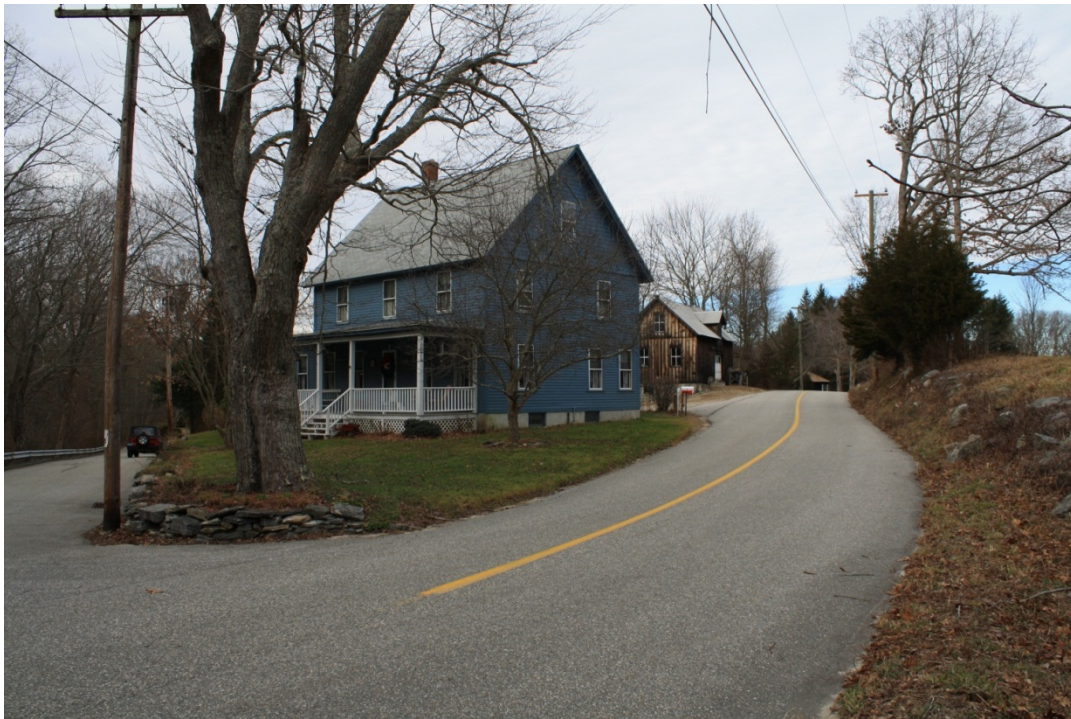
12. East corner of house, with barn to the north, camera facing west.