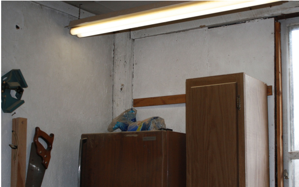
15. Southwest corner of the interior first level of barn, camera facing south.