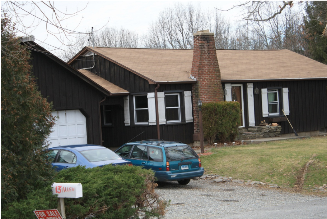
17. Lot to the north of site, 13 Allen Road. Note the garage and house have the same exterior board-and-batten and were built by the same owner.