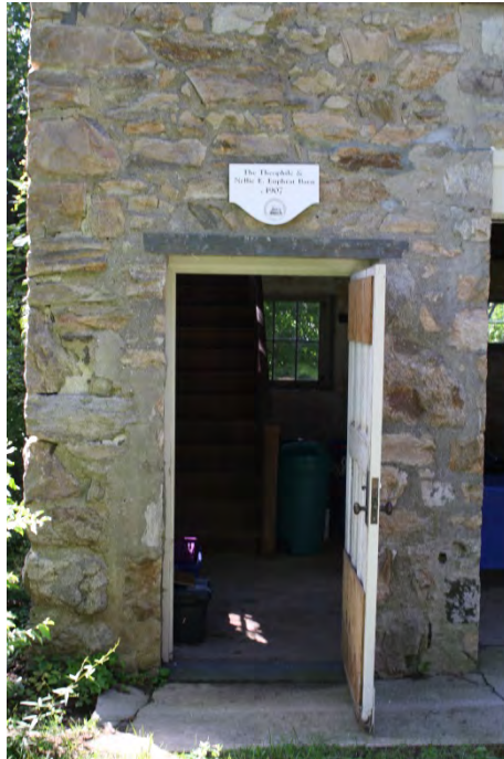
7. East façade of the carriage barn pass-through door at the south corner, camera facing west.