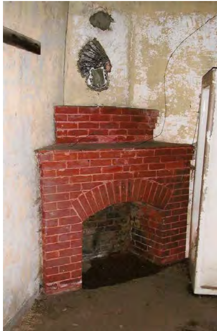
18. First level interior of barn, fireplace, camera facing northwest.