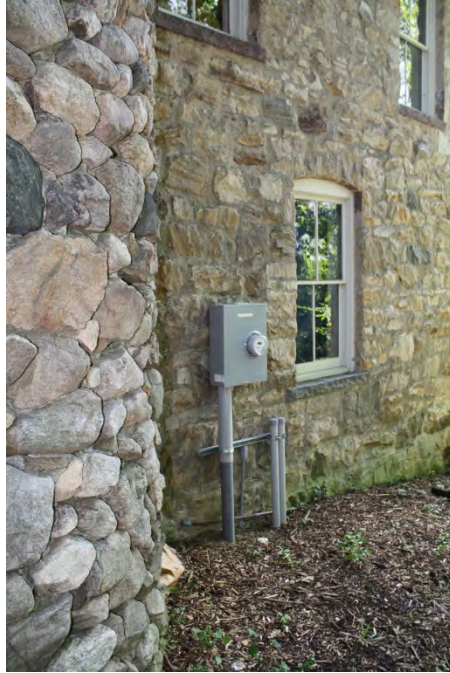
10. North gable-end of the carriage barn connected to the turret, camera facing south.