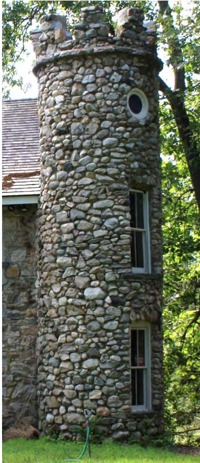
9. Northeast side of the turret, camera facing southwest.