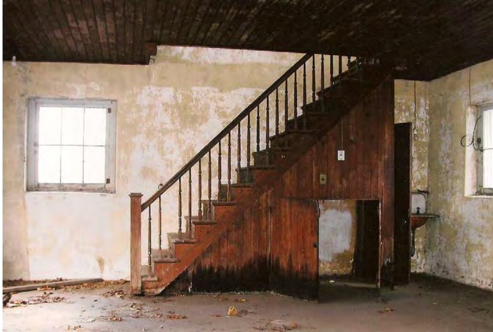
17. First level interior of barn, stairway to second level, camera facing south.