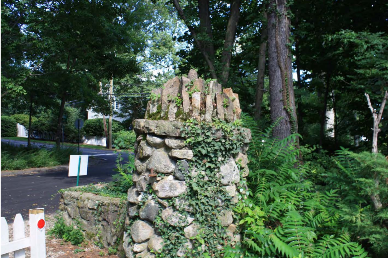
27. Detail of the east gate pillar, camera facing east.