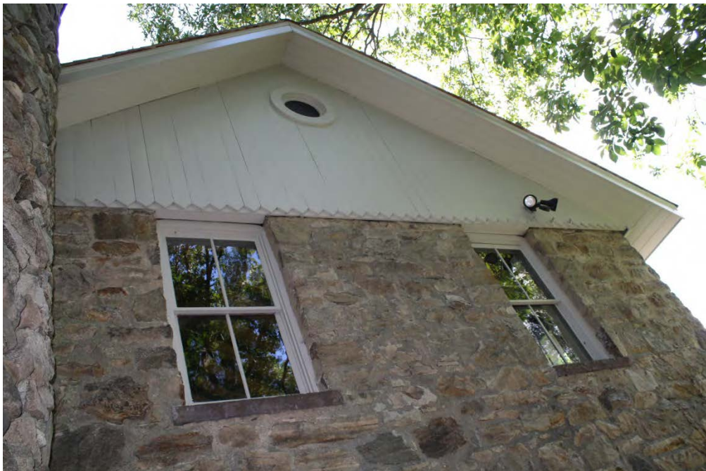
11. North gable-end of the carriage barn, second level, camera facing south.