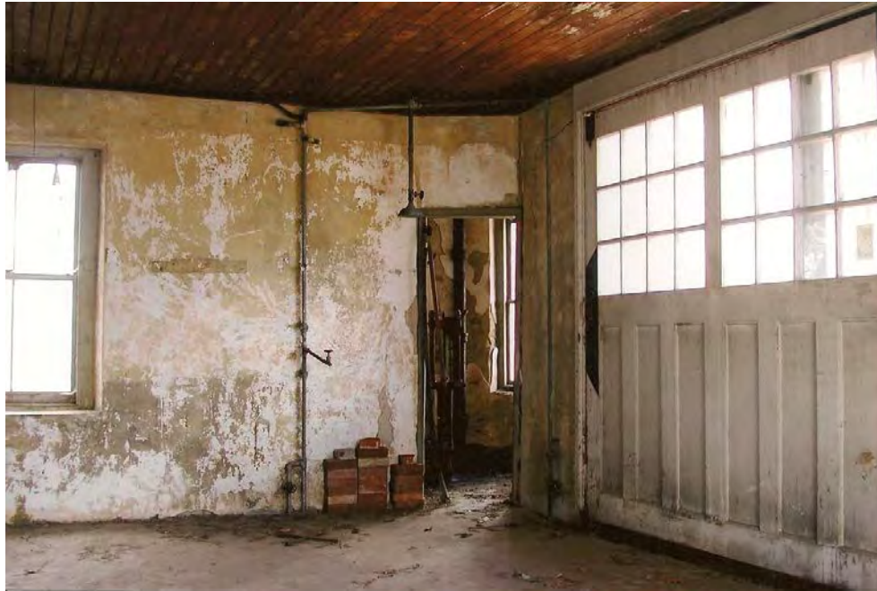
16. First level interior of barn, main entry and entry to turret, camera facing northeast.