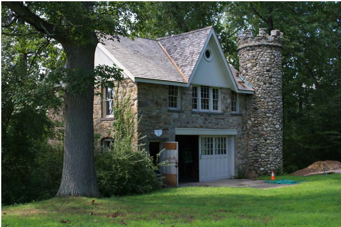
5. Southeast view of the carriage barn, camera facing northwest.