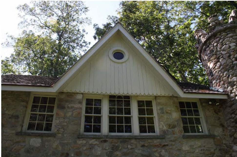
8. East façade of the carriage barn centered Palladian window and wall dormer, camera facing west.