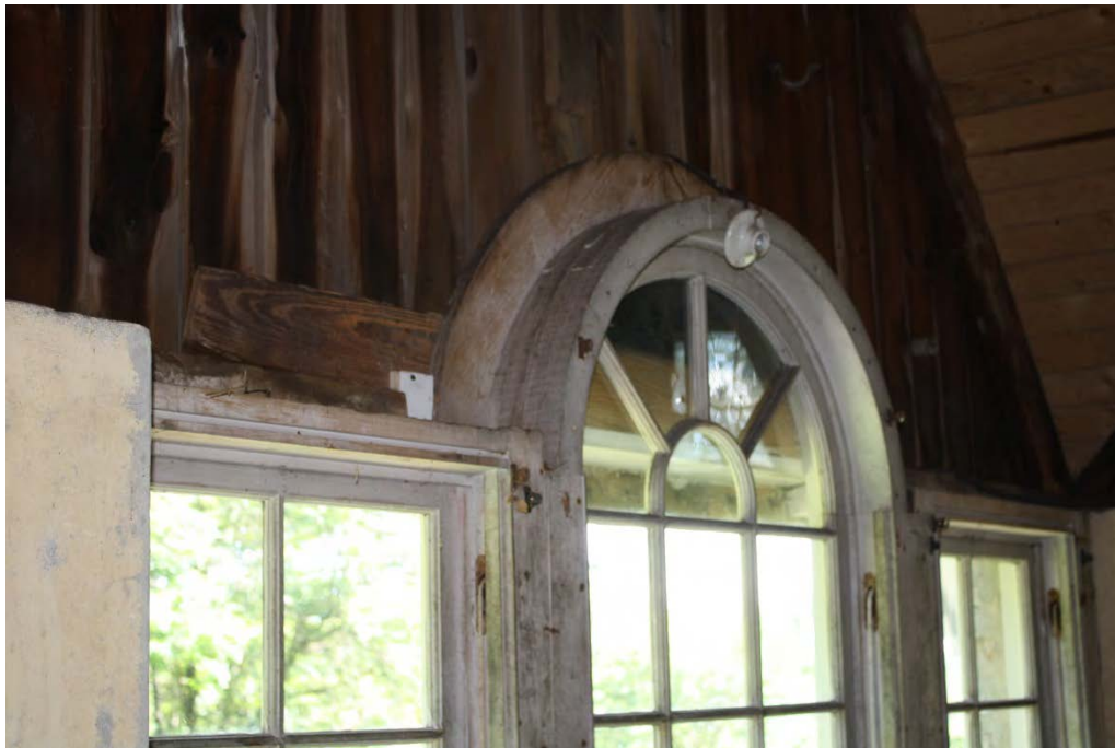
21. Second level interior of barn, detail of Palladian window, camera facing southeast.