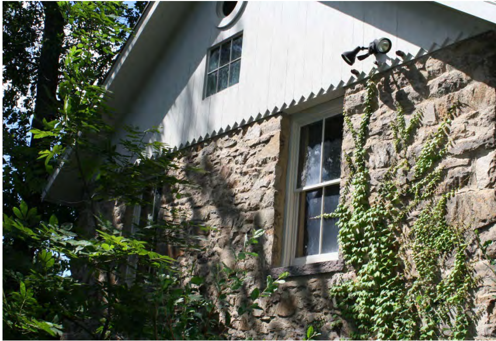
14. South gable-end of the carriage barn, second level, camera facing northwest.