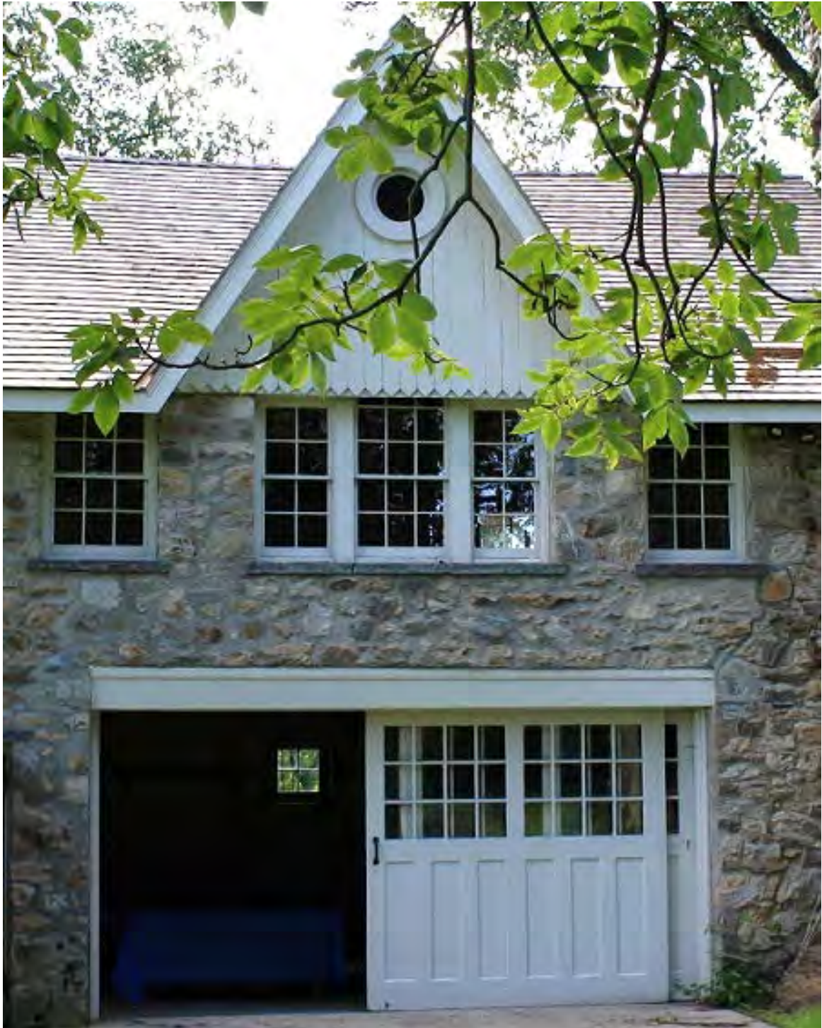
6. East façade of the carriage barn, camera facing west.