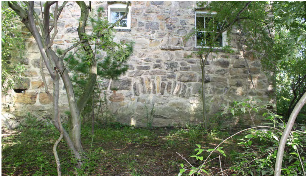
13. West eave-side of the carriage barn, filled-in arch, camera facing east.