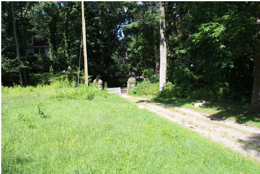
26. View of the yard and gate, camera facing north. The carriage barn is to the southwest of this position.