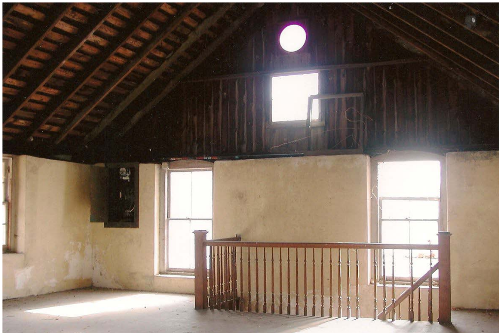
19. Second level interior of barn, balustrade, camera facing south.