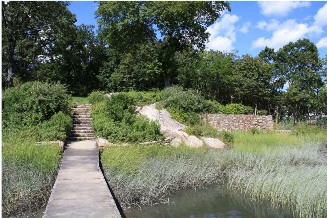
25. View of the pier and former site of the Hart castle, camera facing north. The carriage barn is to the northwest of this position.