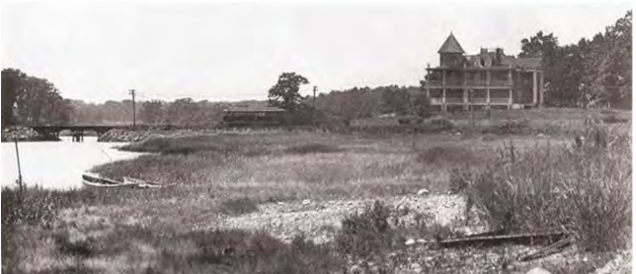
28. Historical photo of the Hart Castle, camera facing west. The carriage barn is just out of site to the north (right).