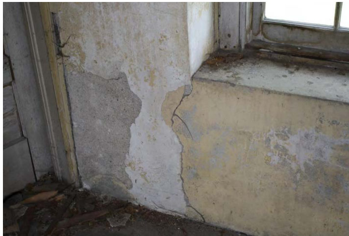
23. Second level interior of barn, detail of failing concrete.