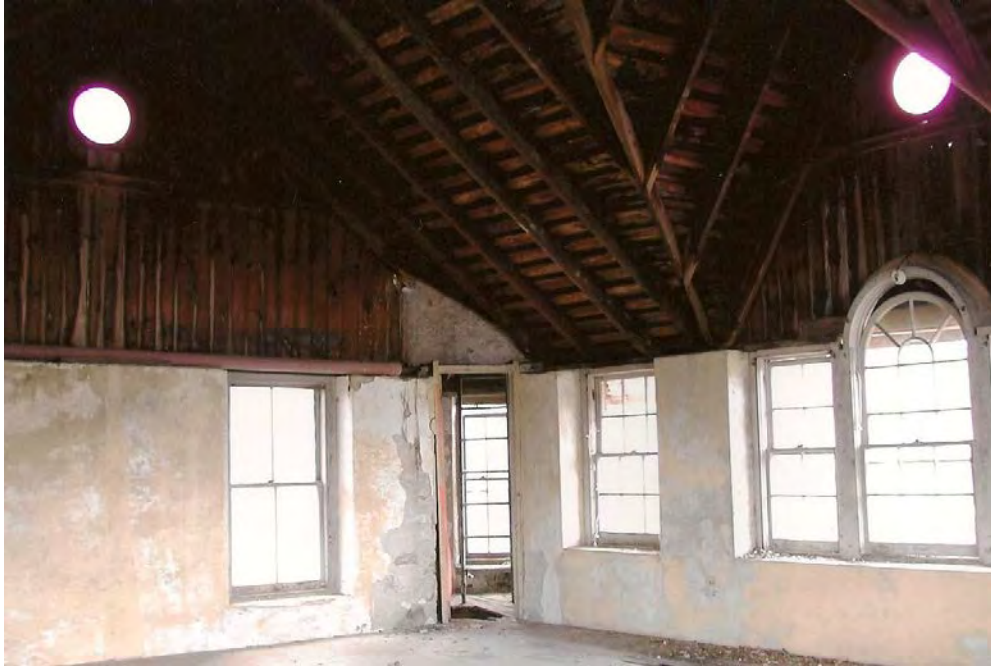
20. Second level interior of barn, entry to turret, camera facing northeast.