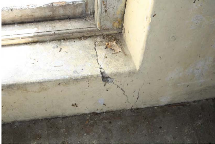
22. Second level interior of barn, detail of failing concrete.