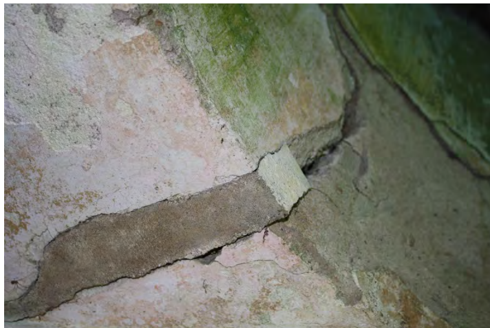
24. First level interior of barn, detail of failing concrete.