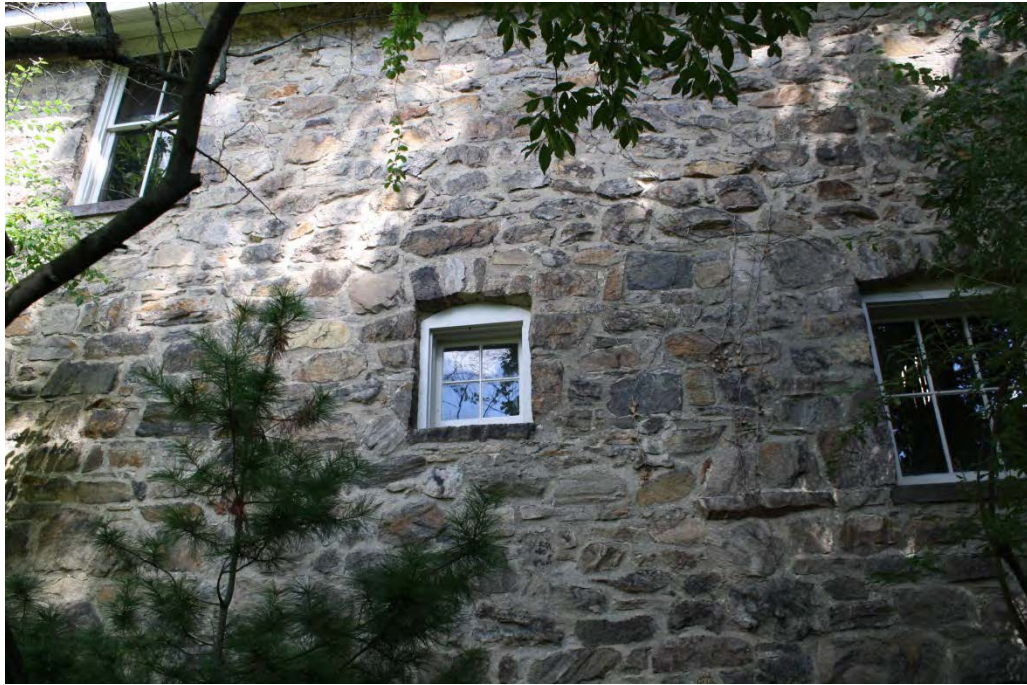
12. West eave-side of the carriage barn, camera facing east.