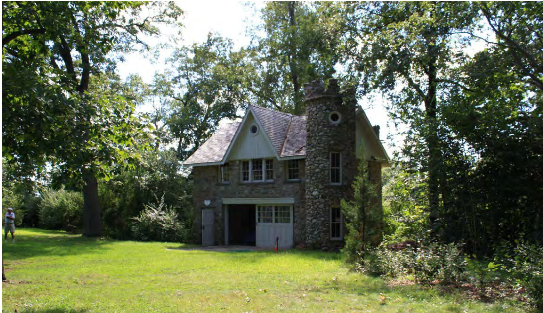
4. Northeast view of the carriage barn, camera facing southwest.