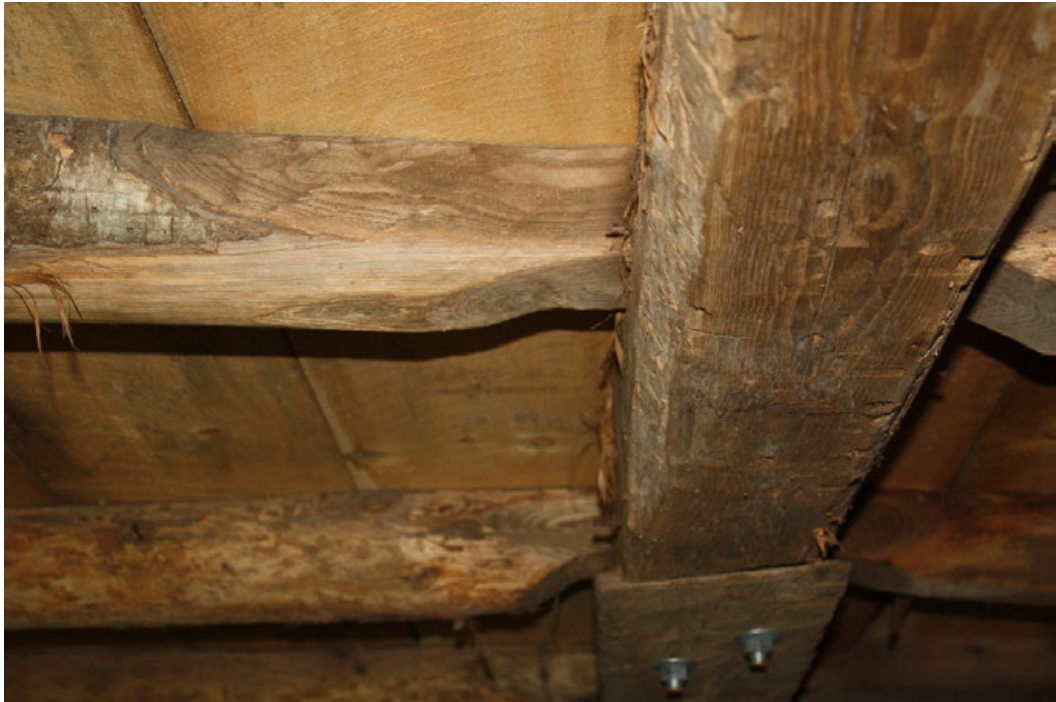
15. Interior basement detail of tobacco shed, camera facing east.