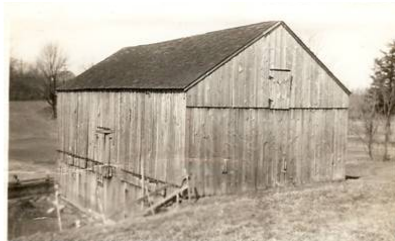
18. Historic photo from the 1950s of the English bank barn (hay barn), now gone.