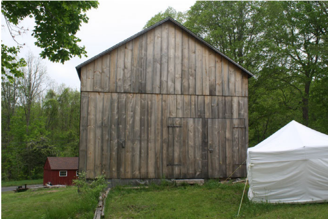
9. South view of Tobacco shed, camera facing north. Workshop is at left rear.