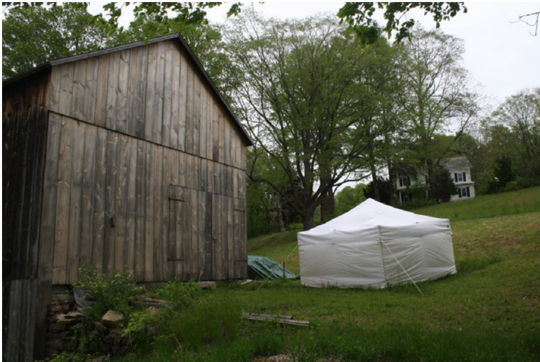
10. Southeast view of tobacco shed, camera facing northeast. Note farmhouse up the hill on the right.