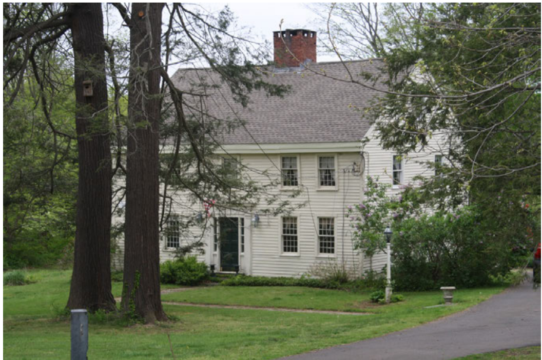
16. South view of 115 Ames Hollow Road, the c. 1796 Nicholas Ames house, camera facing north.