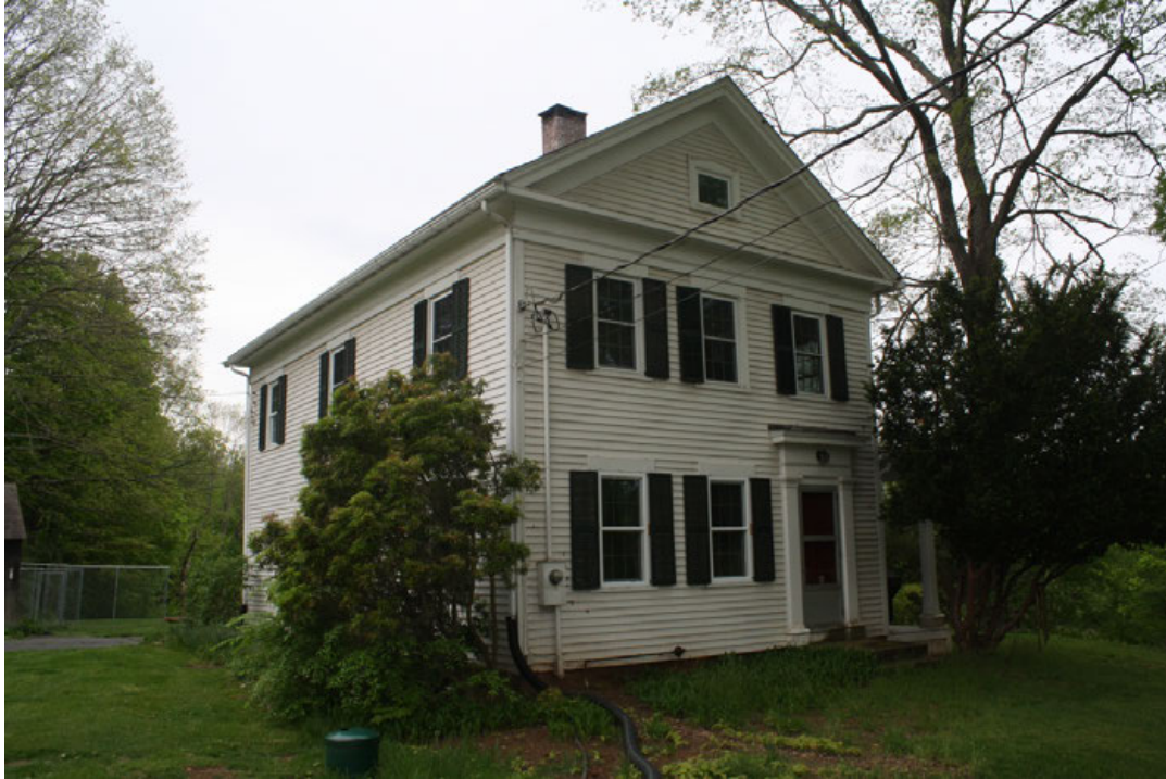
5. Northeast view of c. 1865 Greek Revival-style Farmhouse, camera facing southwest.