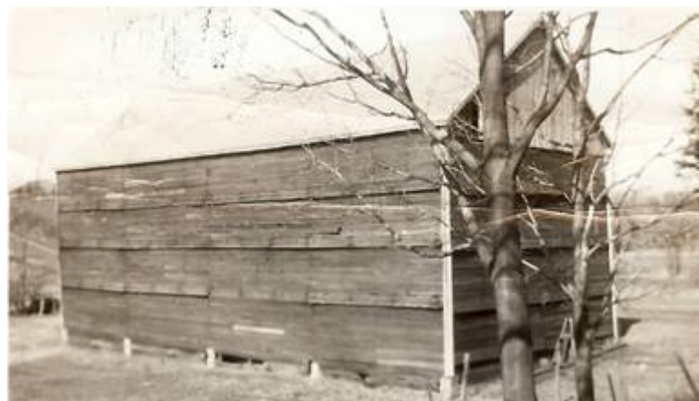
19. Historic photo from the 1950s of the second tobacco shed on the site, now gone.