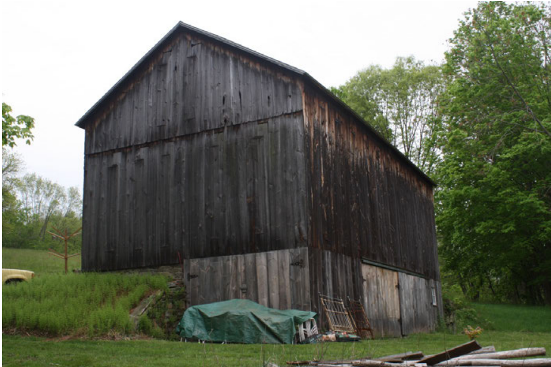
11. Northwest view of tobacco shed, camera facing southwest.