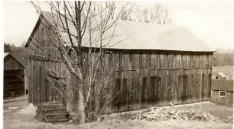
17. Historic photo from the 1950s of the southeast side of the tobacco shed, camera facing northwest. Note gable-end of English bank barn (hay barn) to the left (now gone) and workshop to right.