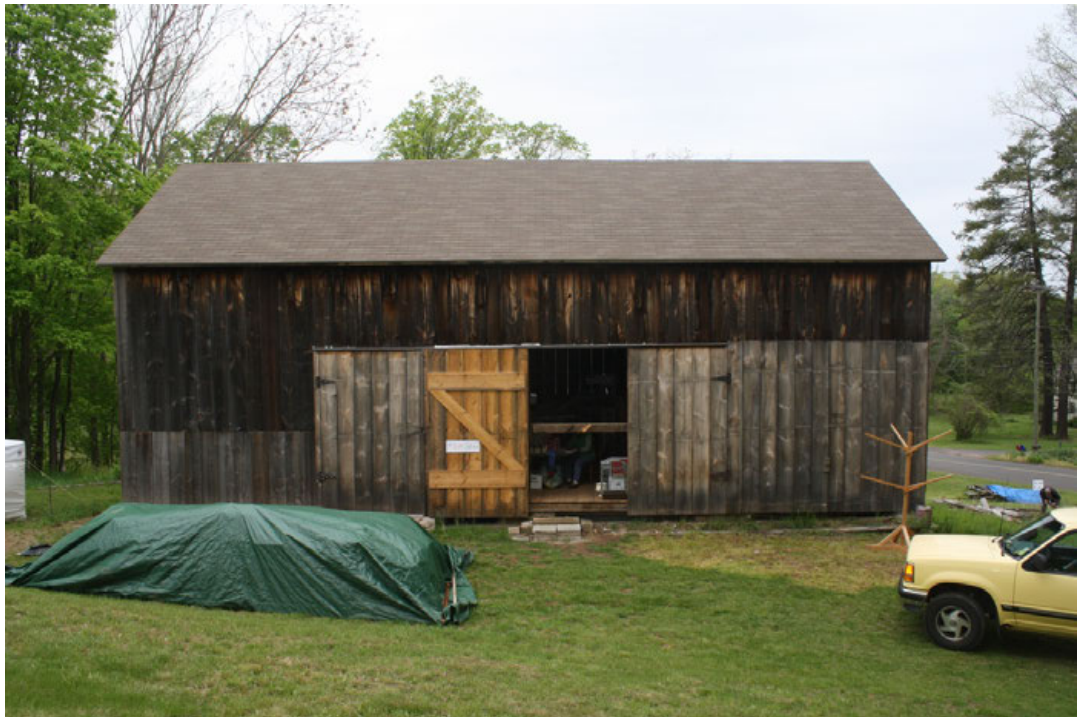
8. East view of Tobacco shed, camera facing west.