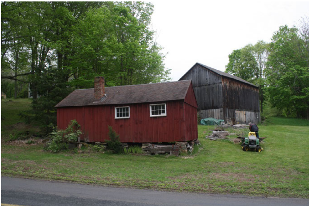
6. North view of workshop, camera facing south. Tobacco shed is to right and Farmhouse to left up the hill.