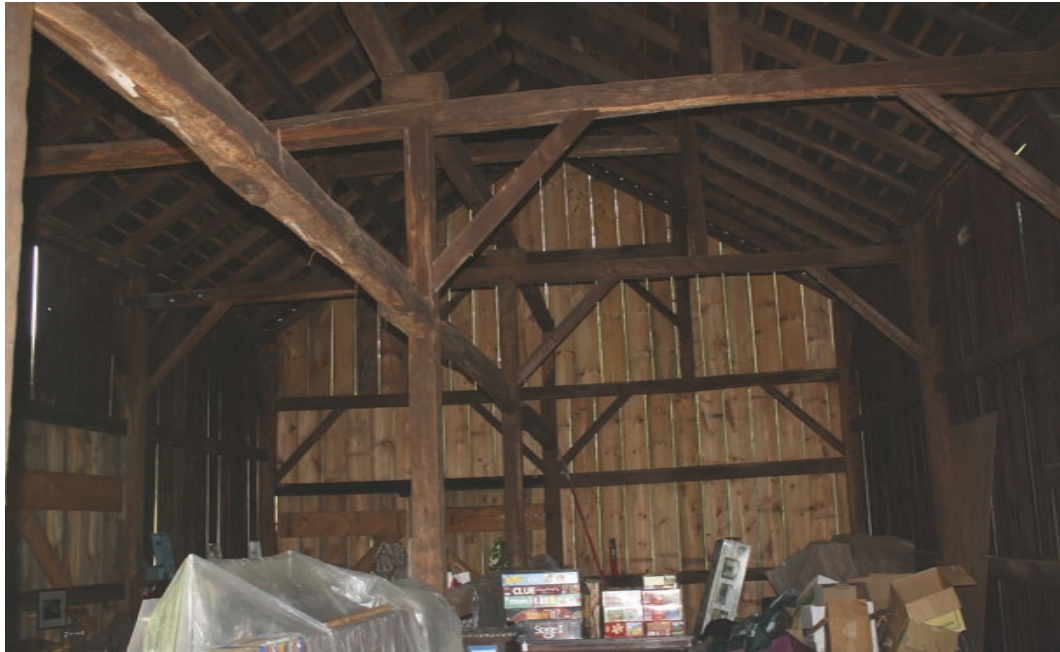
13. Interior view of Tobacco shed, camera facing south. Note new sheathing on the south gable-end.