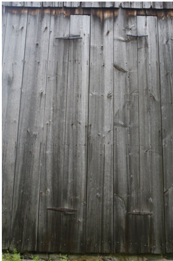
14. Detail of north gable-end of tobacco shed, side-hinged vents, camera facing south.