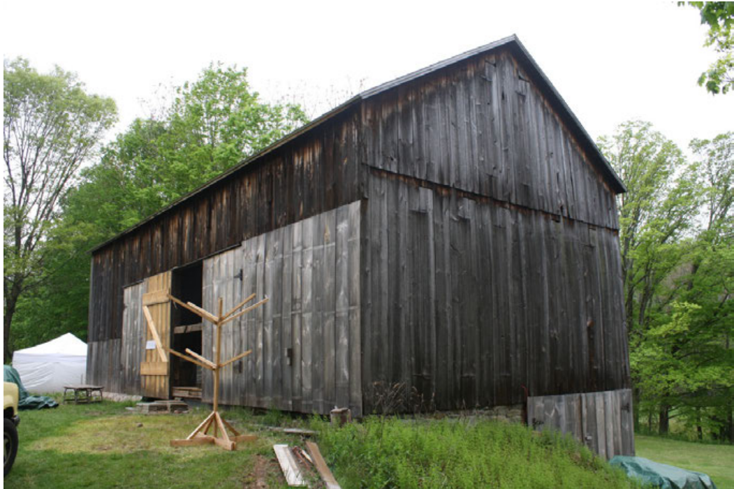
7. Northeast view of Tobacco shed, camera facing southwest.