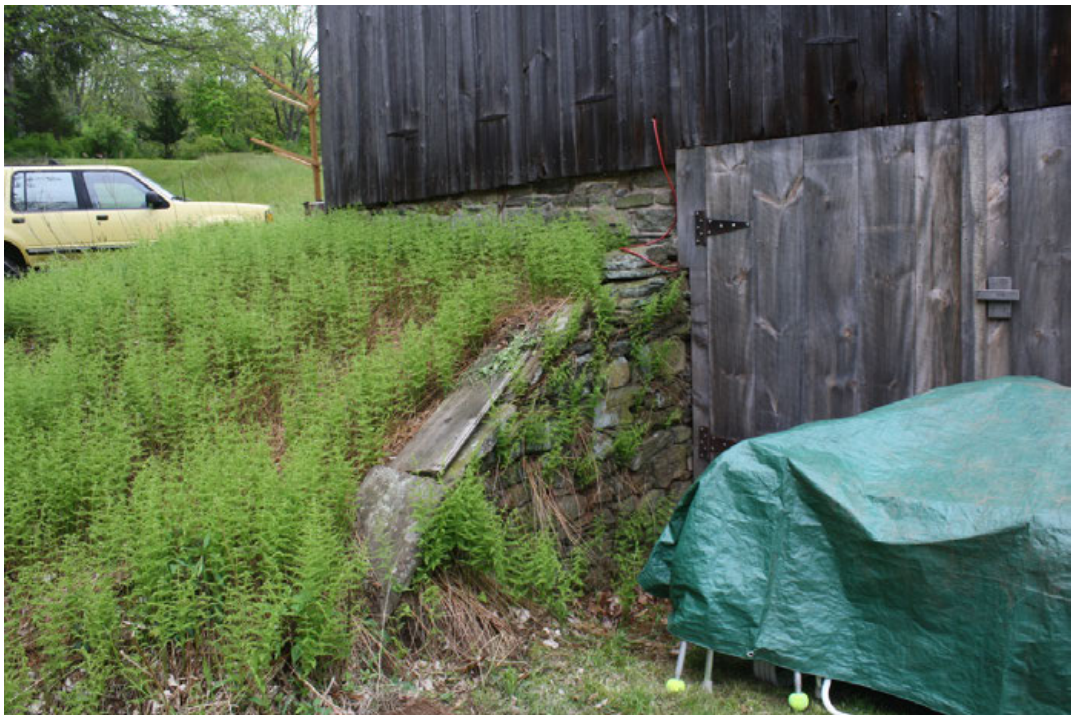
12. Detail of basement level north gable-end of tobacco shed and diminishing retaining wall, camera facing south.