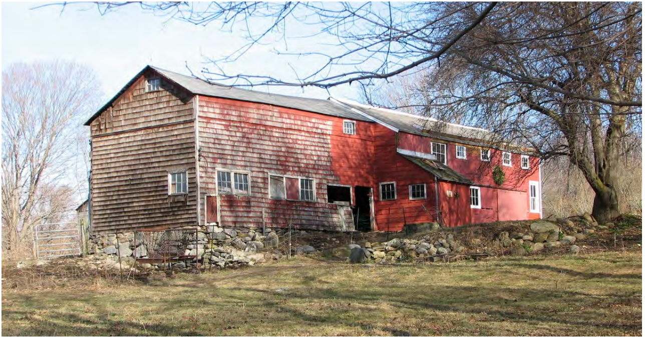
15. Southwest view of Barn I, camera facing northeast. The shingled section is the three-bay English barn; to the right are later additions.