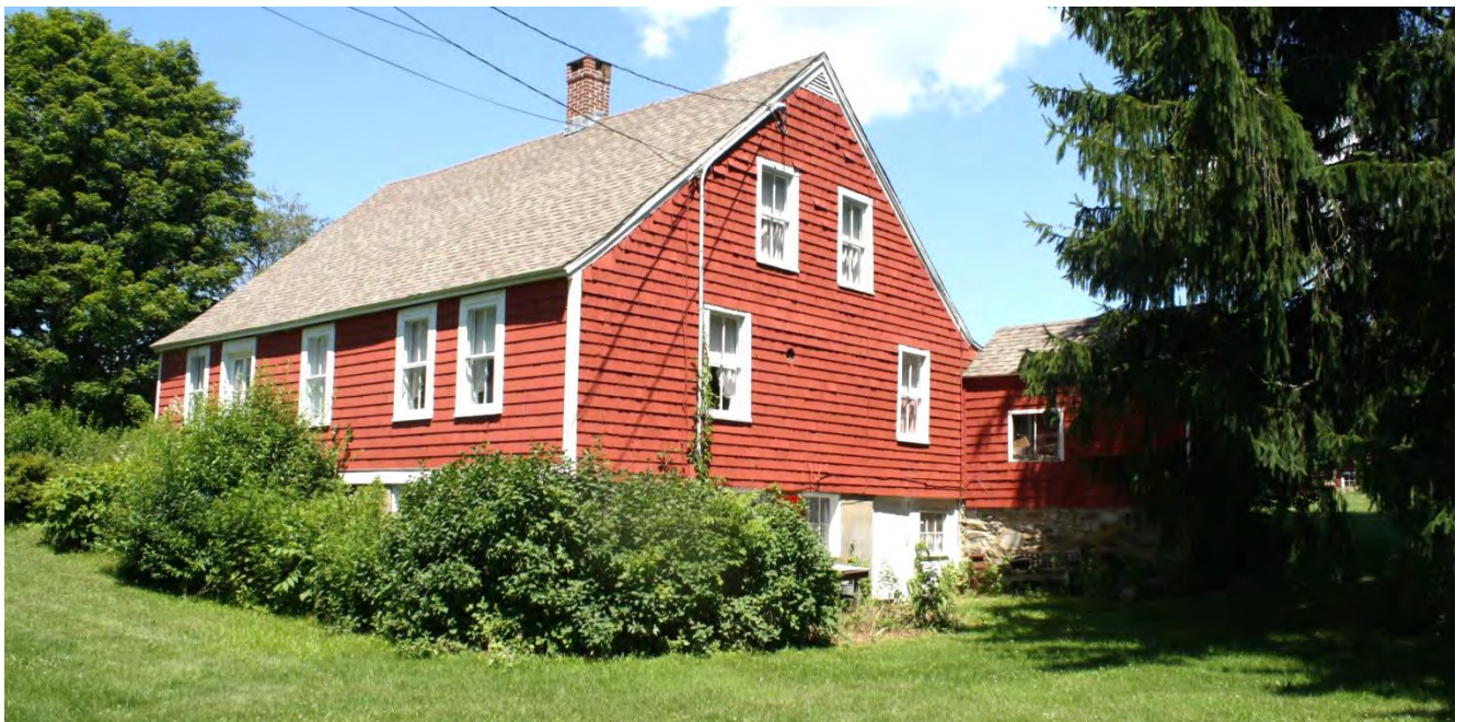
6. Southeast view of Farmhouse, camera facing northwest. Note basement access in east end and well room at right.