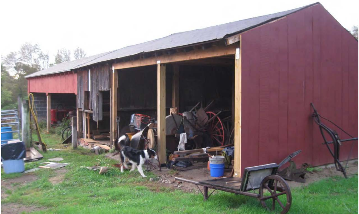
10. Southeast view of Wagon shed II, camera facing northwest.