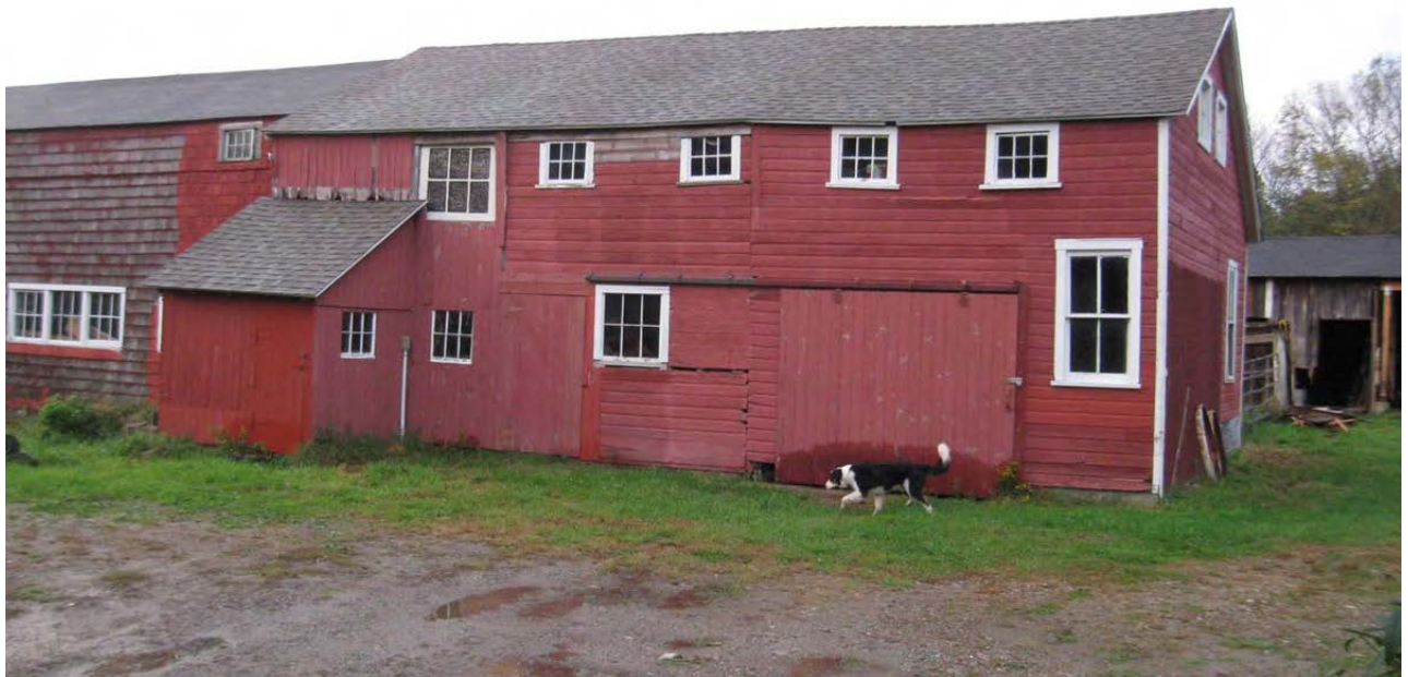
16. South view of Barn I, camera facing north. View prior to rehabilitation work shows different siding on each bay, indicating different times of construction. The projecting addition was the milk room.