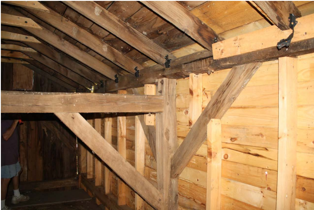
21. Interior view of Barn I loft level, camera facing northwest, showing interior bent with dropped tie girt.=.