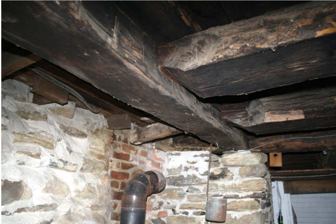
9. Detail view of basement showing the east side of the remnant chimney base and first floor framing, camera facing northwest.