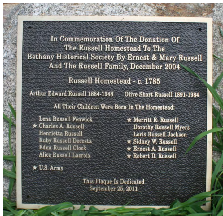
24. Commemorative plaque 2011, Bethany Historical Society.