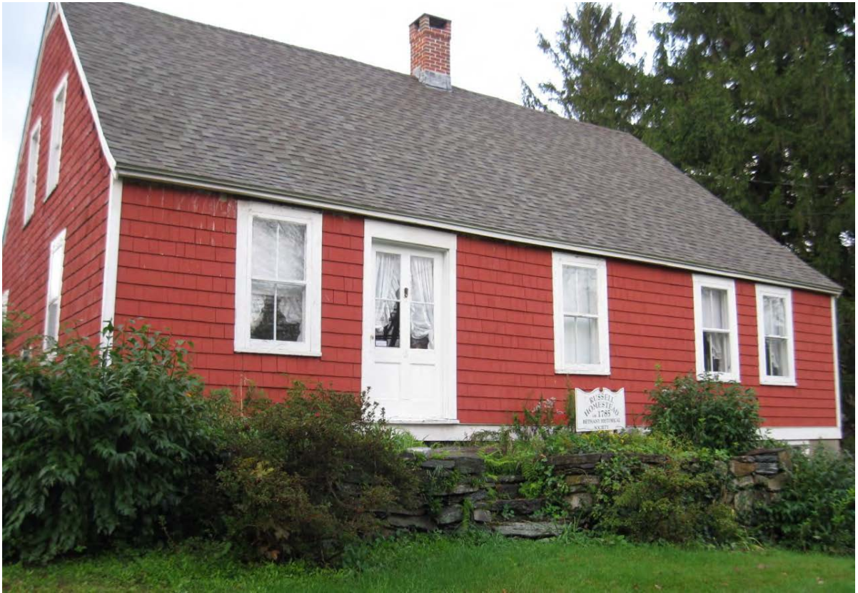
5. Southwest view of Farmhouse, camera facing northeast.