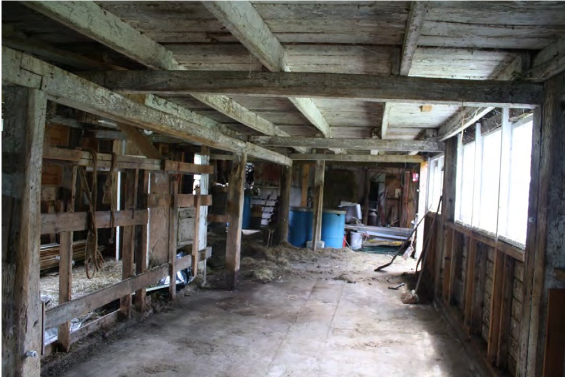
19. Interior view of Barn I ground level, camera facing east, showing structural alterations for dairy stable use.