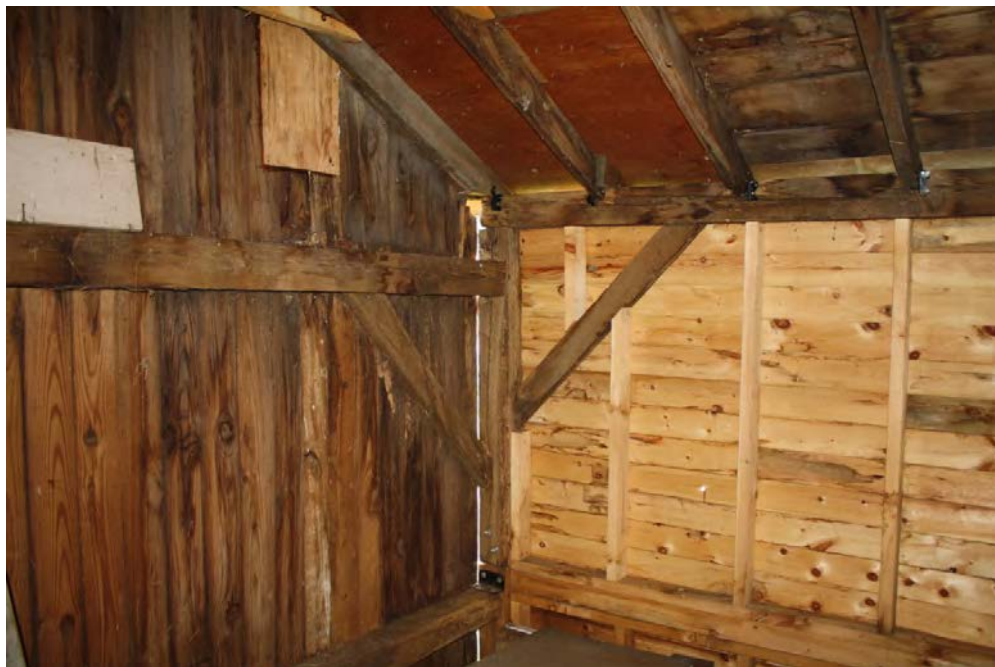
20. Interior view of Barn I loft level, camera facing northwest. View after rehabilitation work shows replacement framing, collar ties, and hurricane clips added to existing post and beam frame with dropped girt. Note left side has vertical board sheathing with wood shingle siding while right (north) wall has replacement horizontal lap siding.