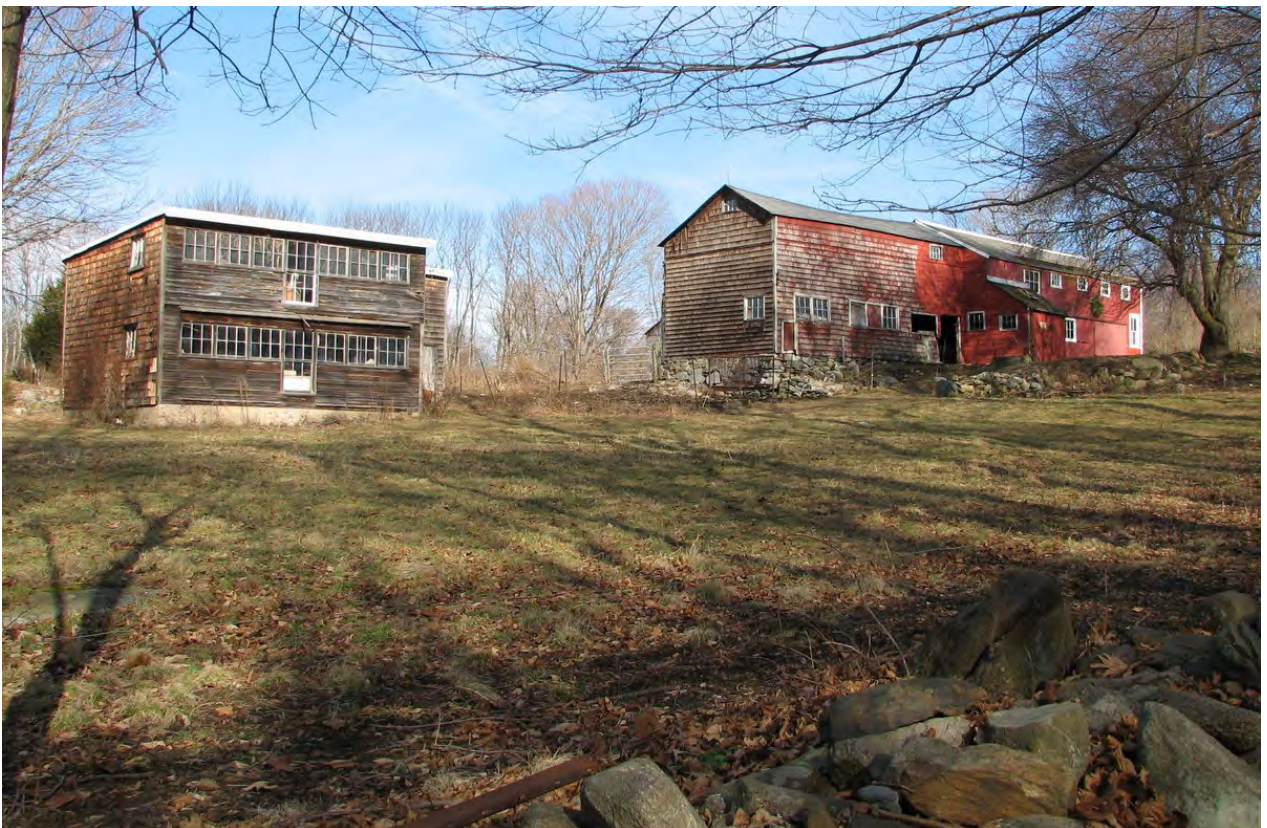
12. Southwest view of Chicken coop III at left and Barn I at right, camera facing northeast.