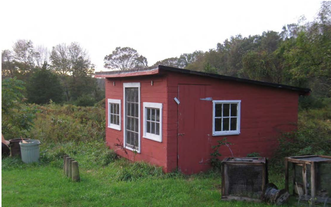
14. Southeast view of Chicken coop IV, camera facing northwest.