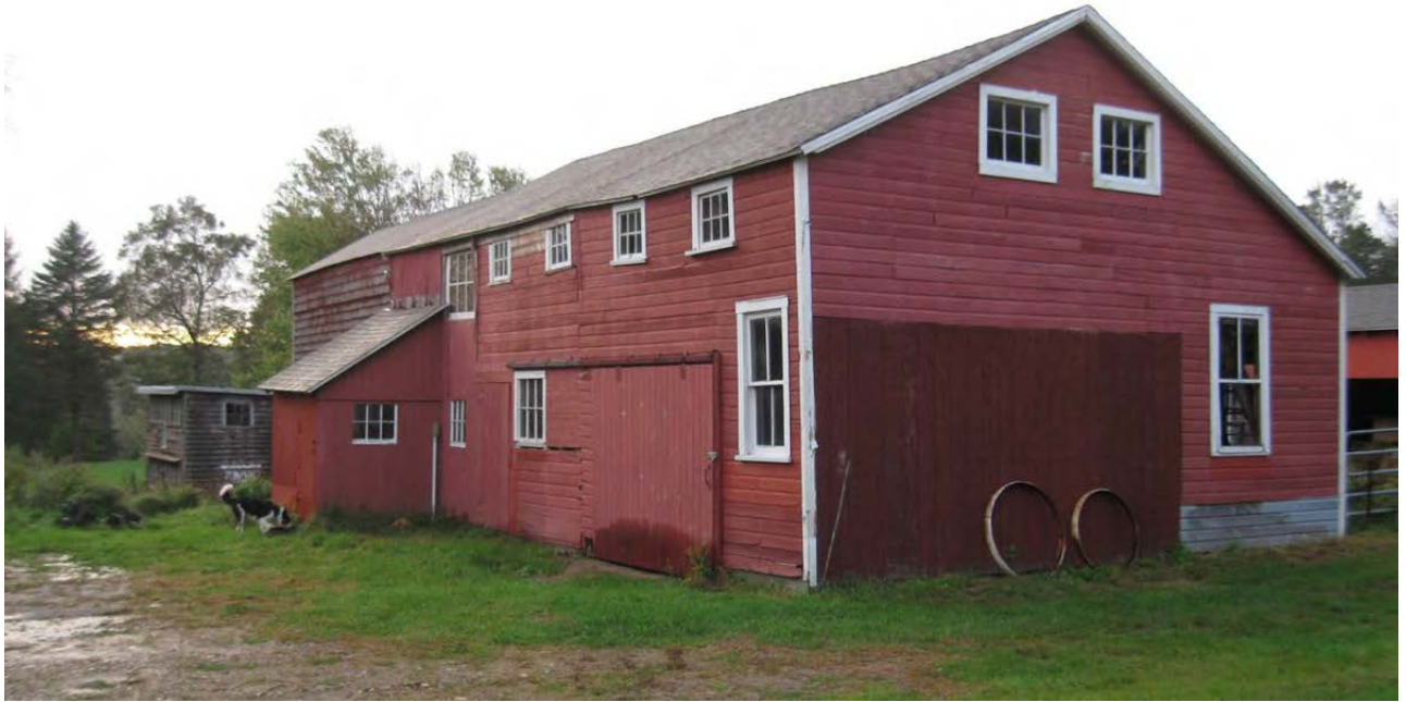
17. Southeast view of Barn I, camera facing northwest. View prior to rehabilitation work.