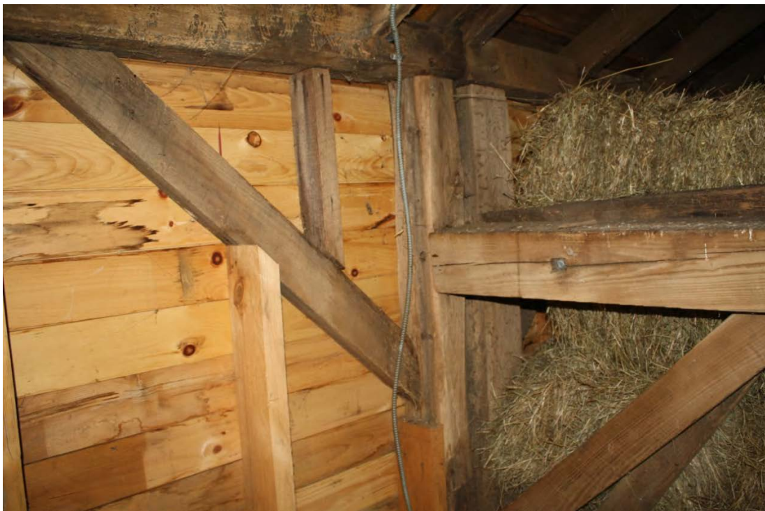
22. Interior view of Barn I loft level, camera facing northeast. This is the easternmost bent of the three-bay English barn frame; note the double post, evidence of a second post and beam frame erected adjacent to the east end of the first frame. Only part of this frame appears to be extant.