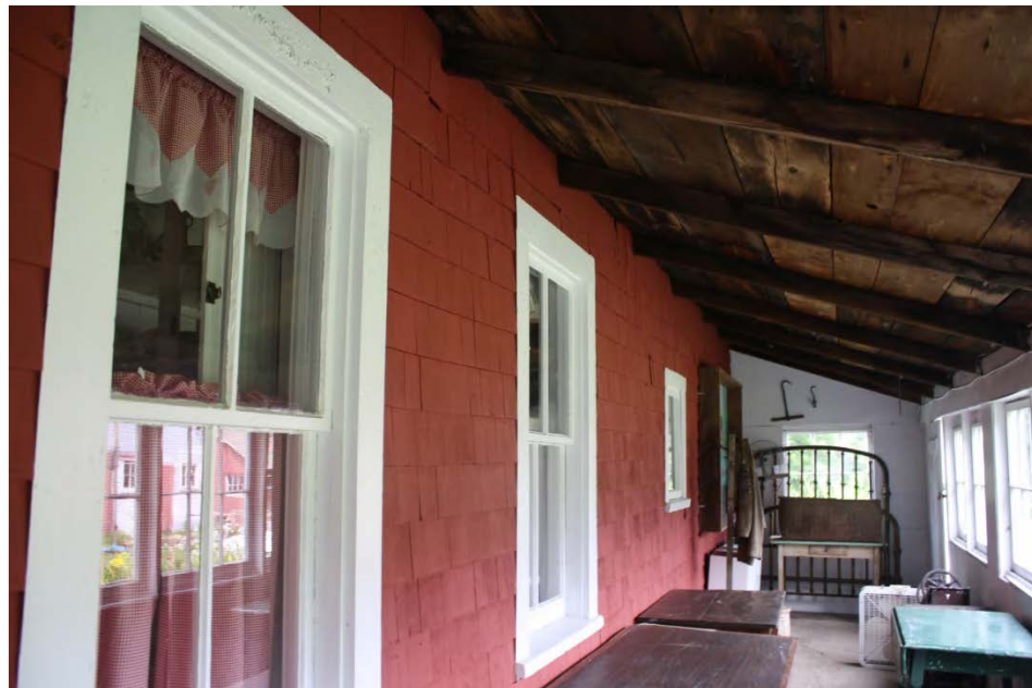
8. View of north wall at interior of shed addition, camera facing west.