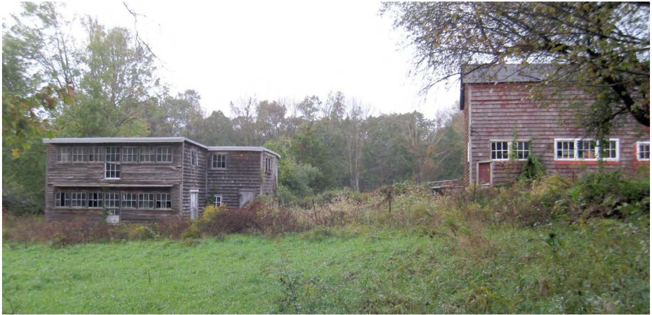
13. Southeast view of Chicken coop III at left and Barn I at right, camera facing north.