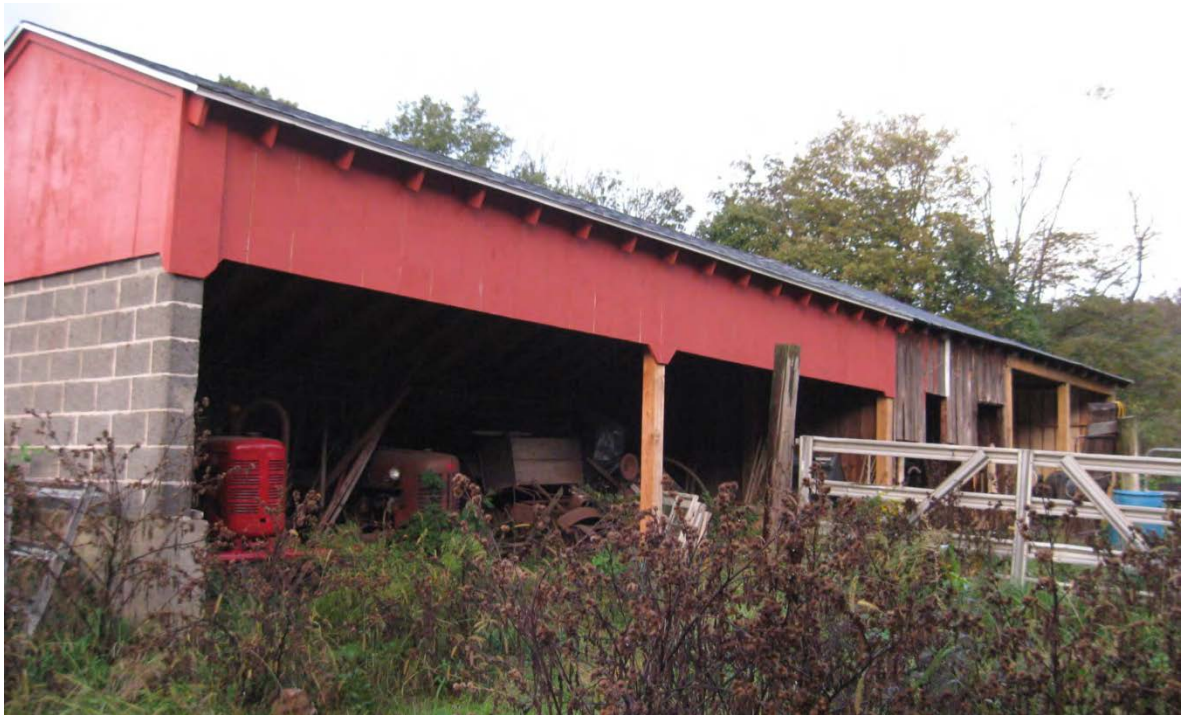
11. Southwest view of Wagon shed II, camera facing northeast.