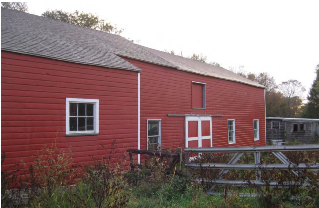
18. North view of Barn I, camera facing southwest. View after rehabilitation work. Coop III is at right rear.