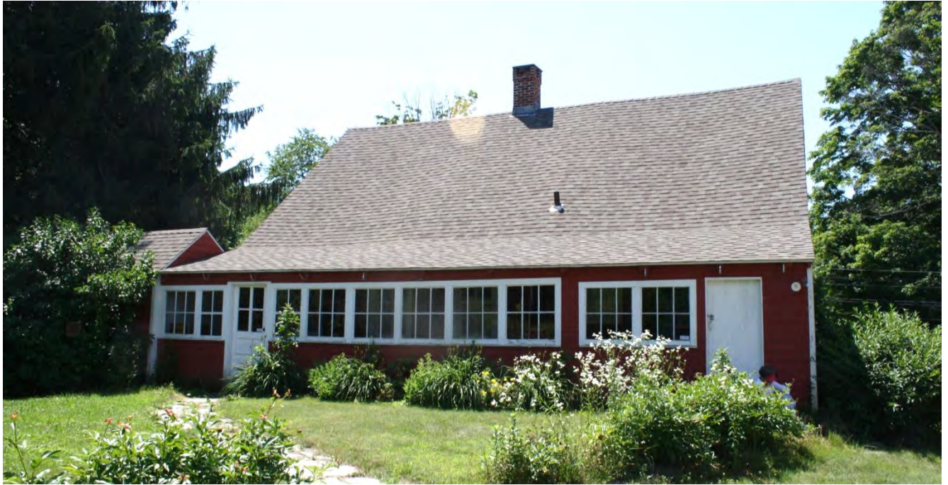
7. North view of Farmhouse, camera facing south.