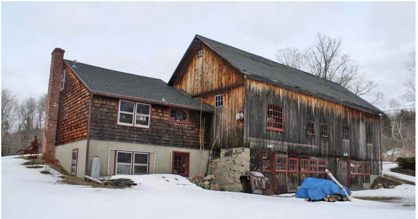
6. Southwest view of c. 1960 Residence and Barn, camera facing northeast. Compare with Figure 7 for recent alterations.