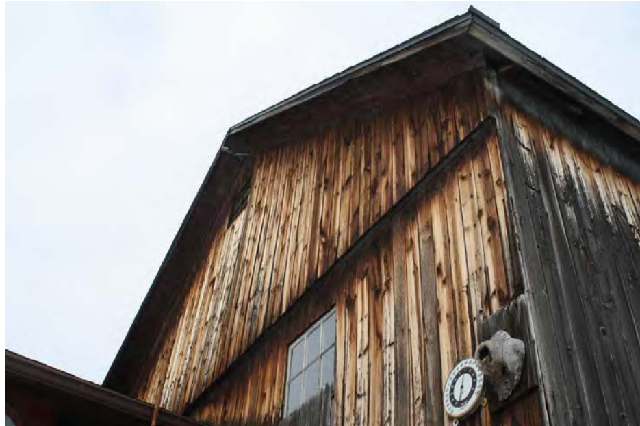
17. Southwest view of Barn, camera facing northeast. Note siding divide where the lower siding is seated in the rabbet on the lower face of the tie-girt.