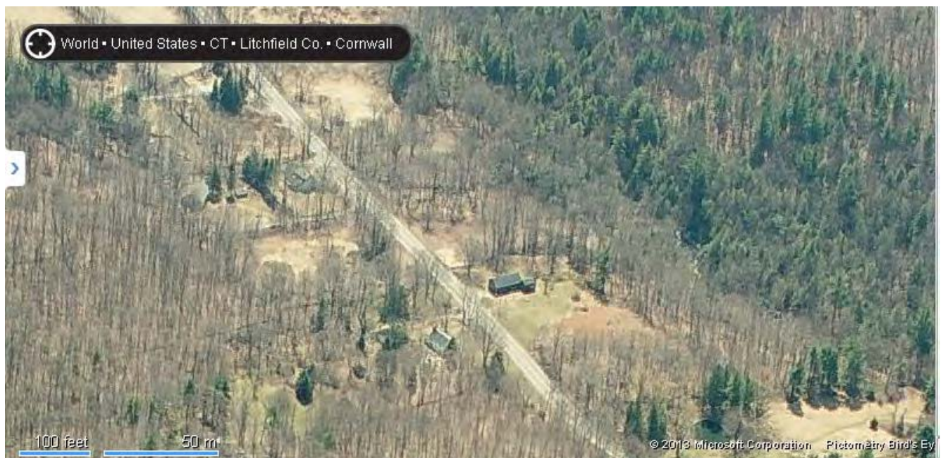
2. North view – aerial “bird’s-eye” map of 99 Warren Hill Road, Cornwall CT – http://www.bing.com/maps accessed 6/12/2013. Note: barn is on the righthand side of the road in this view.