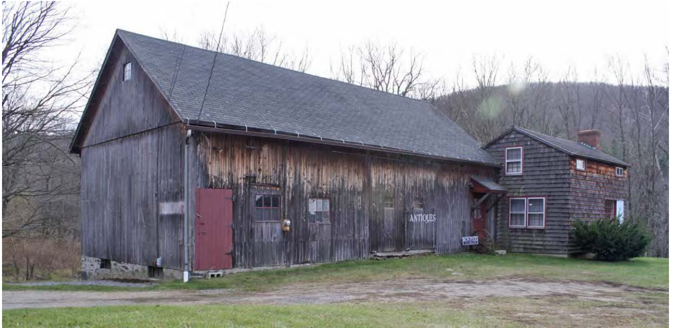
5. Northeast view of Barn and c. 1960 Residence, camera facing southwest.