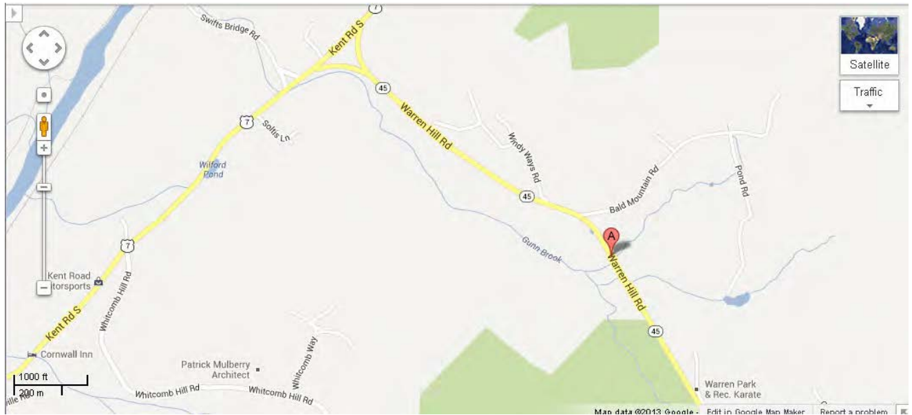
1. Location map of 99 Warren Hill Road, Cornwall CT – from http://maps.google.com/ accessed 6/12/2013.