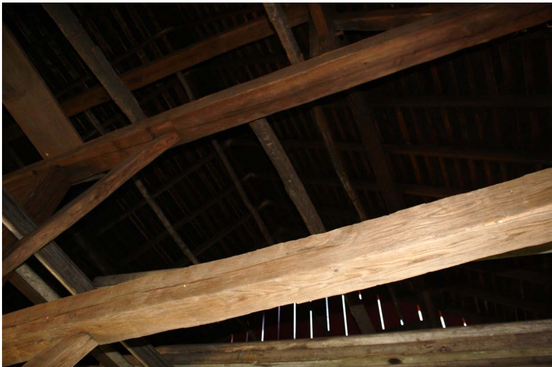
12. Interior of tobacco shed, detail of hand-hewn chestnut beams, camera facing south.