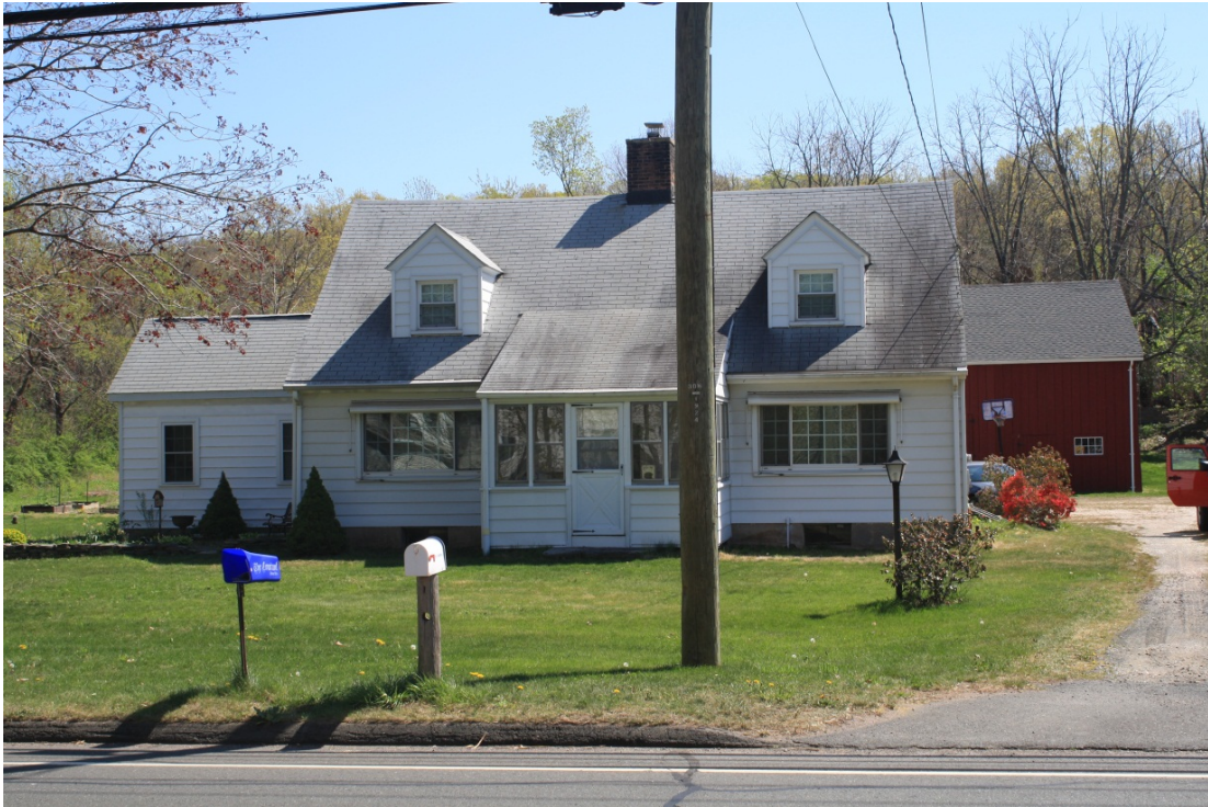
15. West eave-side of house and tobacco shed, camera facing east.