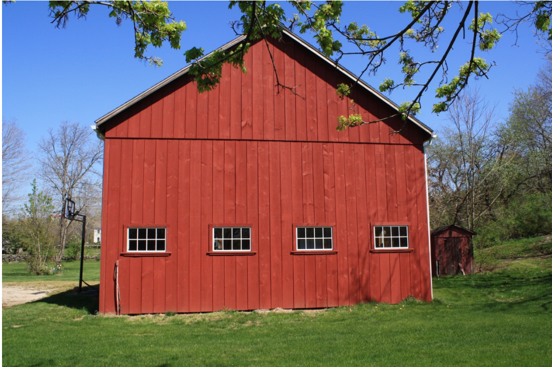
8. South gable-end of Tobacco shed, camera facing north. Note outhouse to the right.