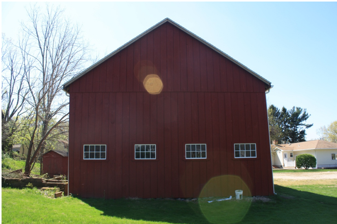
10. North gable-end of Tobacco shed, camera facing south.