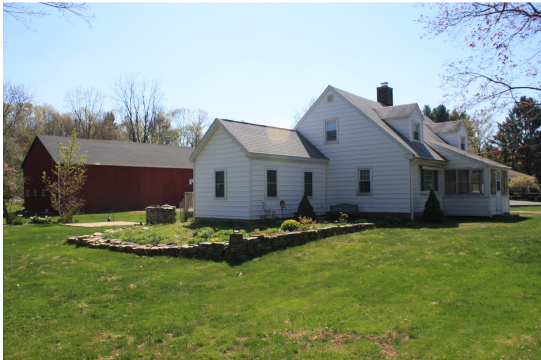
14. Northwest view of the house and Tobacco shed, camera facing southeast. Note the stone well to the left of the house.