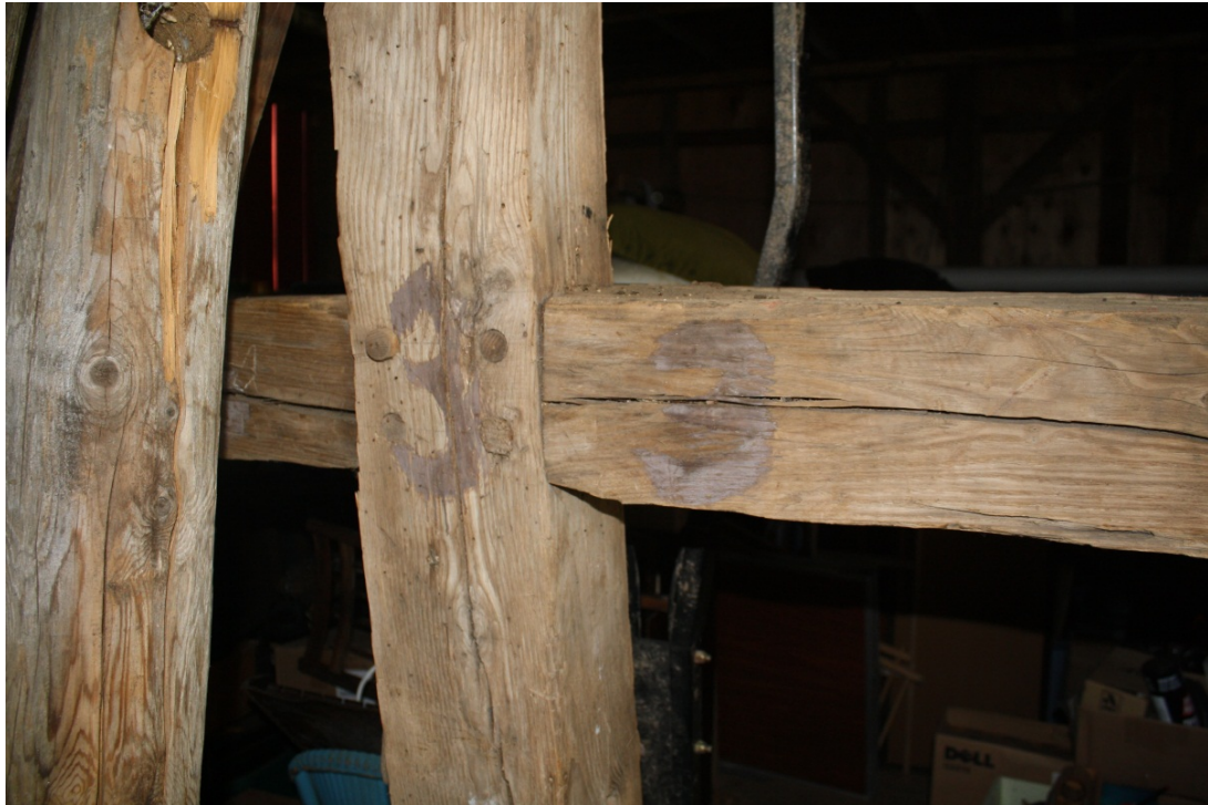
11. Interior of tobacco shed, detail of numbers at the square rule constructed timber frame joints, used for the rebuilding of the relocated shed in 1928, camera facing south.