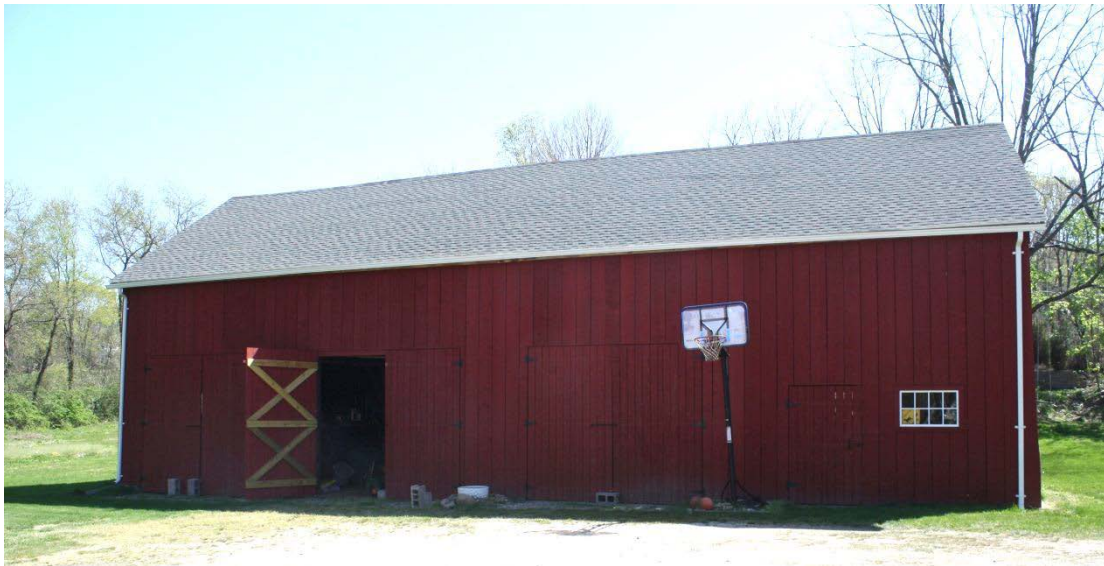
6. West eave-side facade of tobacco shed, camera facing east.