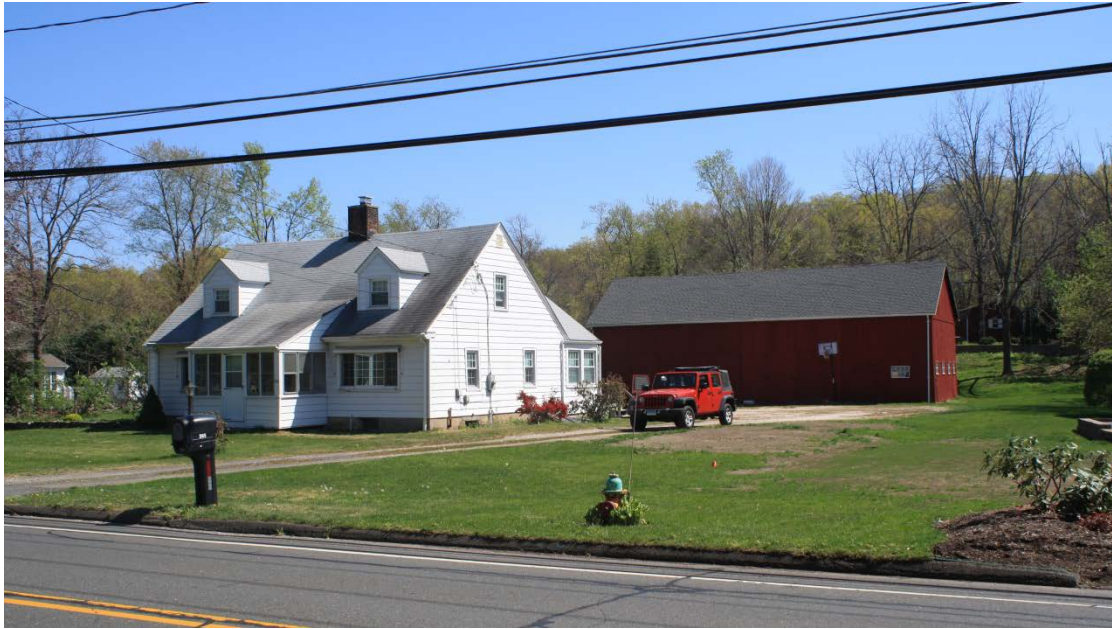
5. West view of 268 Main Street, Farmhouse and Tobacco shed, camera facing east.