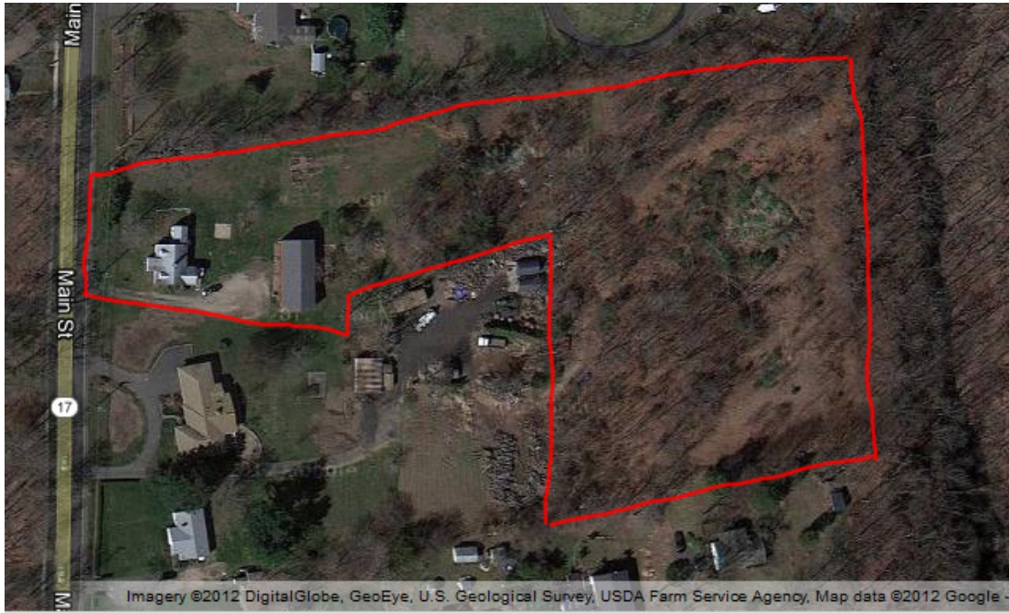
3. Parcel map of 268 Main Street Glastonbury, CT – from Glastonbury GIS Viewer http://www.crcog.org/gissearch/ accessed 6/1 2012.