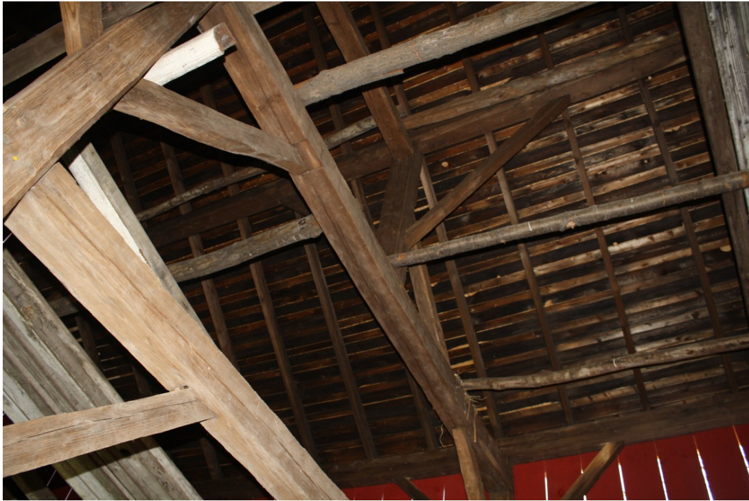
13. Interior of tobacco shed, detail of unfinished timber rails used to hang tobacco bunches as they were drying, camera facing west.