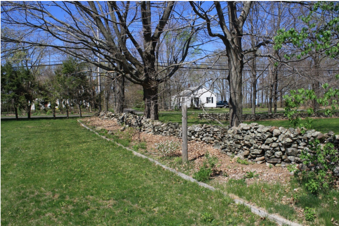
16. South view of stone wall at the north border of the site, camera facing northwest.