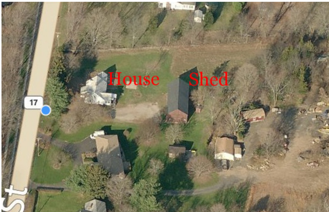
4. South view – aerial “bird’s-eye” detail site plan showing contributing resources