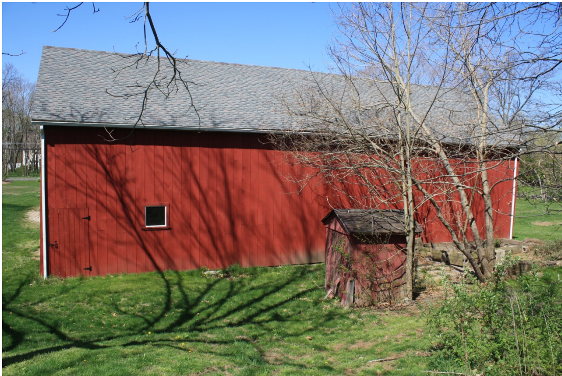
9. East eave-side of tobacco shed and outhouse, camera facing west.