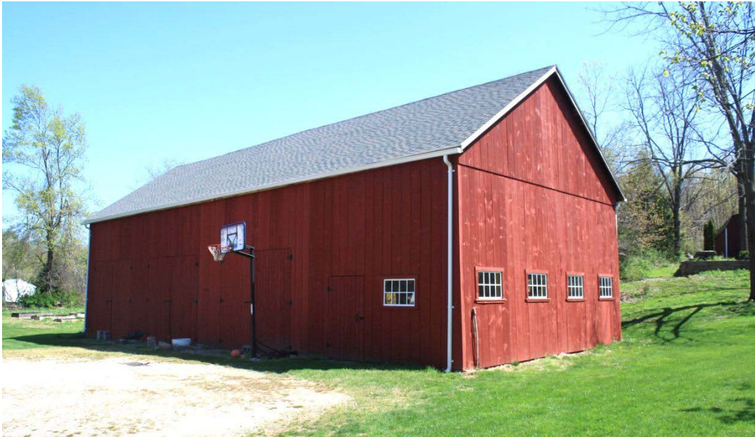
7. Southwest view of tobacco shed, camera facing northeast.