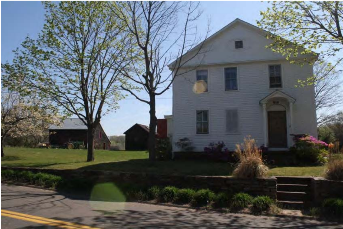
5. West view of the house, camera facing east. Note the saltbox English barn and pumphouse to the left.