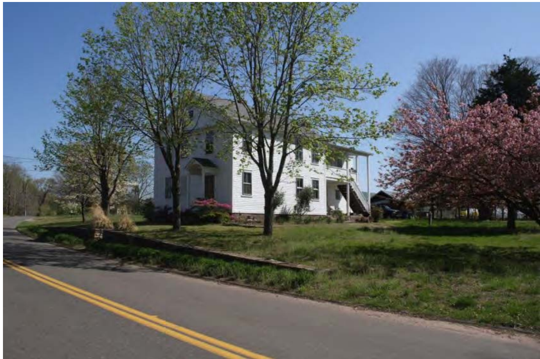
18. Southwest view of the house, camera facing northeast. Note tobacco shed at the right rear.