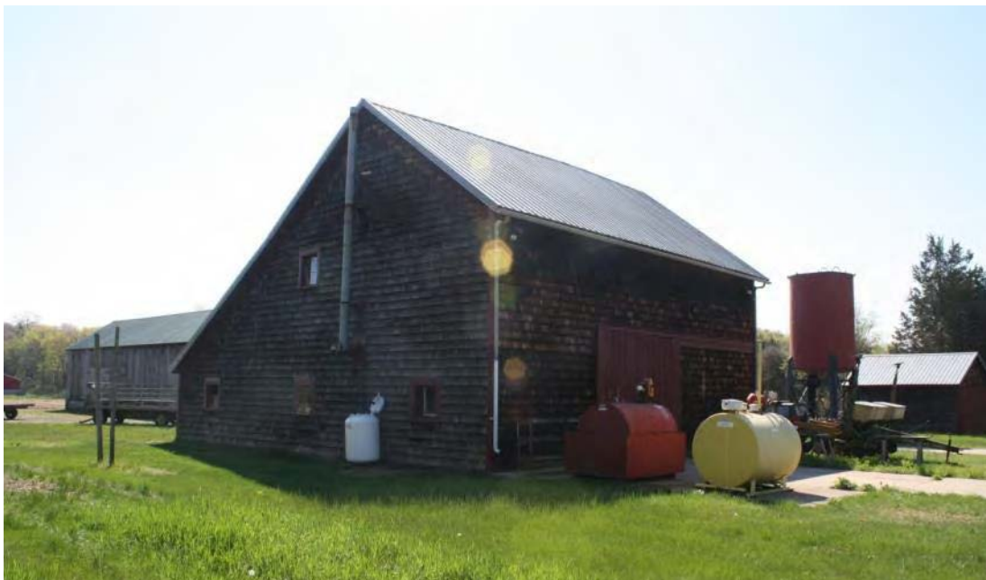
6. Northwest corner of the English saltbox-roofed barn, camera facing southeast. Note the tobacco shed to the left and the water tank and garage on right.