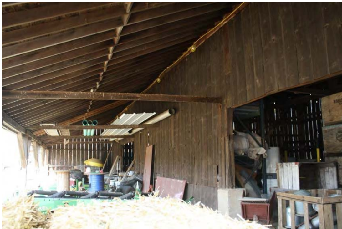
14. Beneath the leanto the original south exterior is visible, camera facing west.