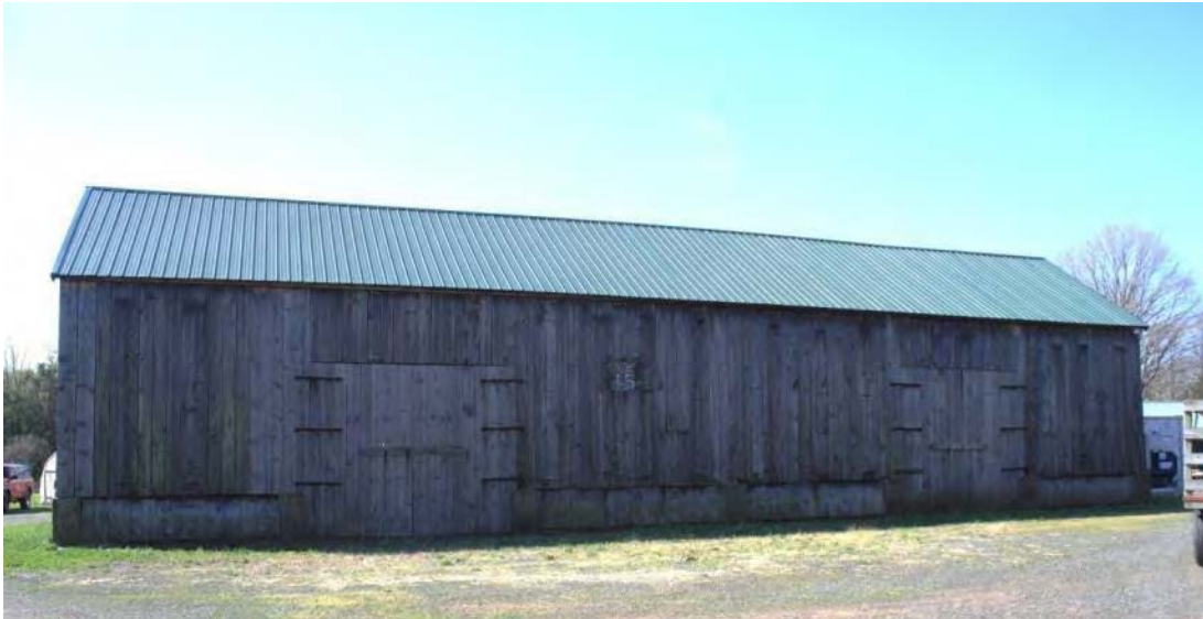
11. North view of the tobacco shed, camera facing south.