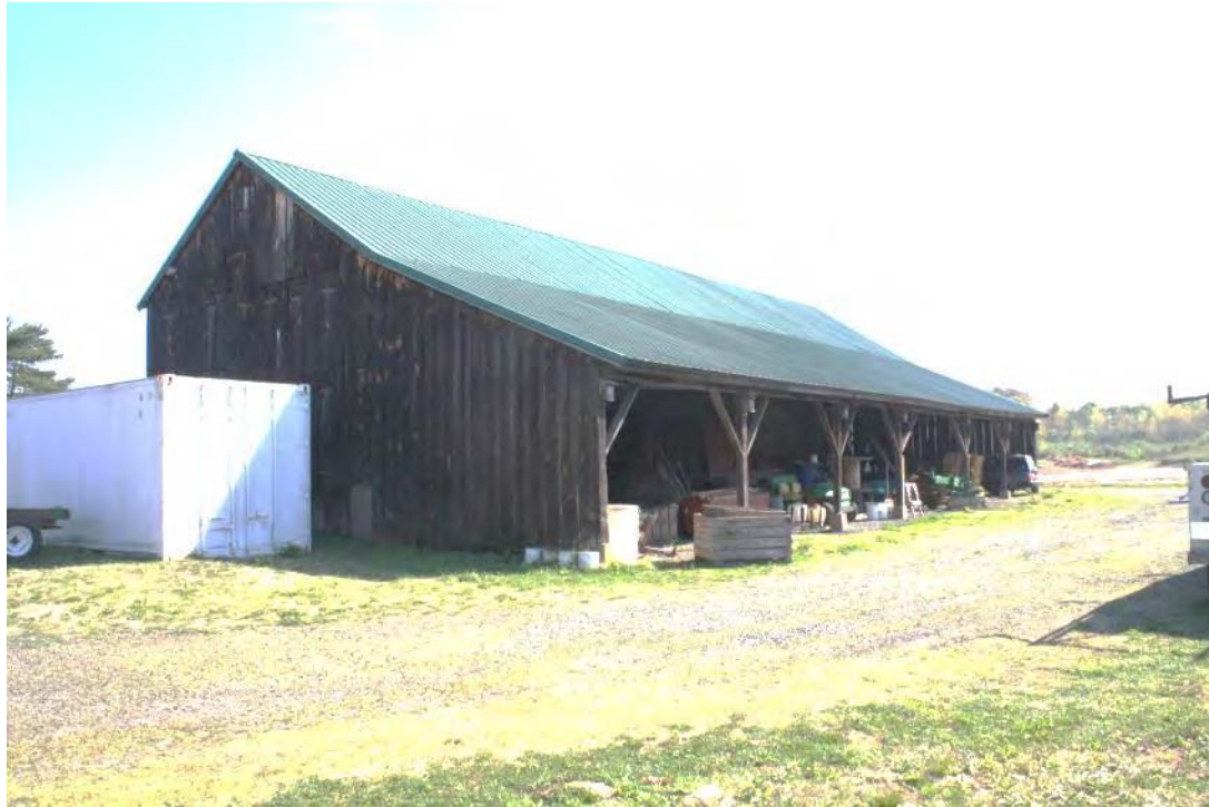
13. Southwest corner of Tobacco shed, camera facing northeast, showing wagon shed leanto attached at south.