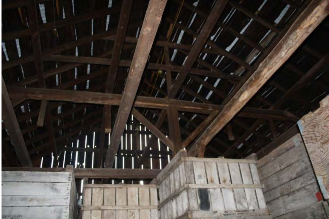
17. Interior detail of the tobacco shed, extra horizontal beams for rails to cure tobacco, camera facing east.