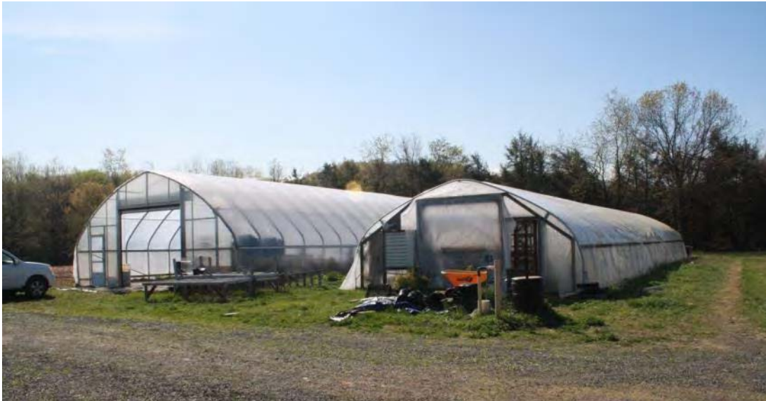
9. North view of greenhouse which are located to the south of the tobacco shed, camera facing south.