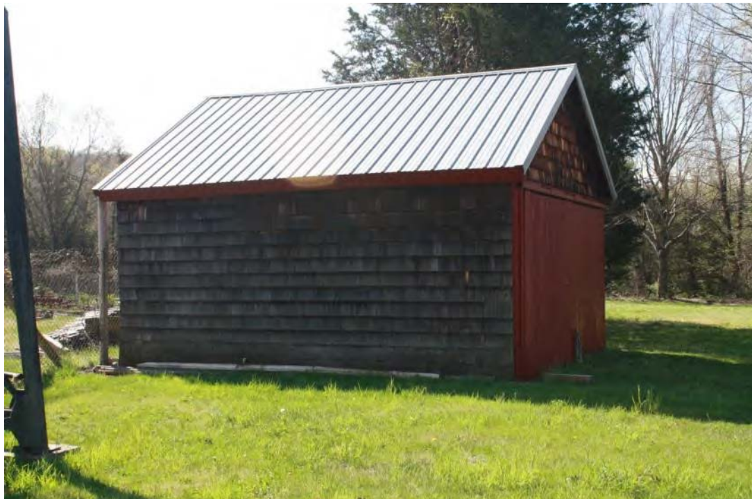
8. North view of the garage, which at one time held a Model A automobile, camera facing south.