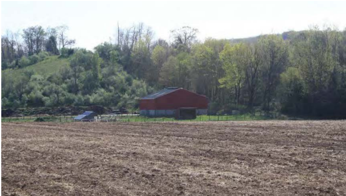
10. West view of 2010 modern gable-roofed barn, camera facing east.