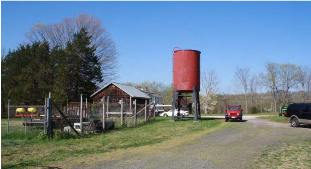
7. East view of water tank and garage on left, camera facing west. Note the house behind the garage.