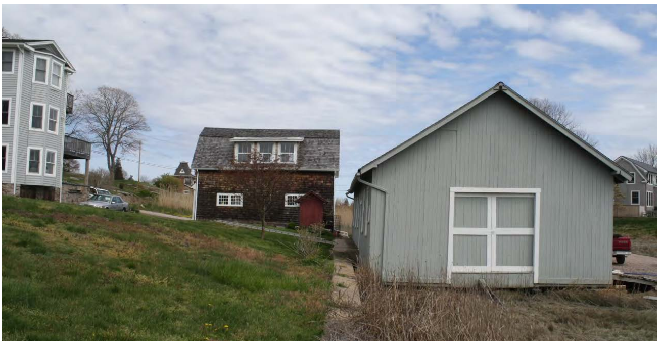
6. West gable-end of Boat shed I at right, Carriage barn/garage II at center, rear of house at left; camera facing east.