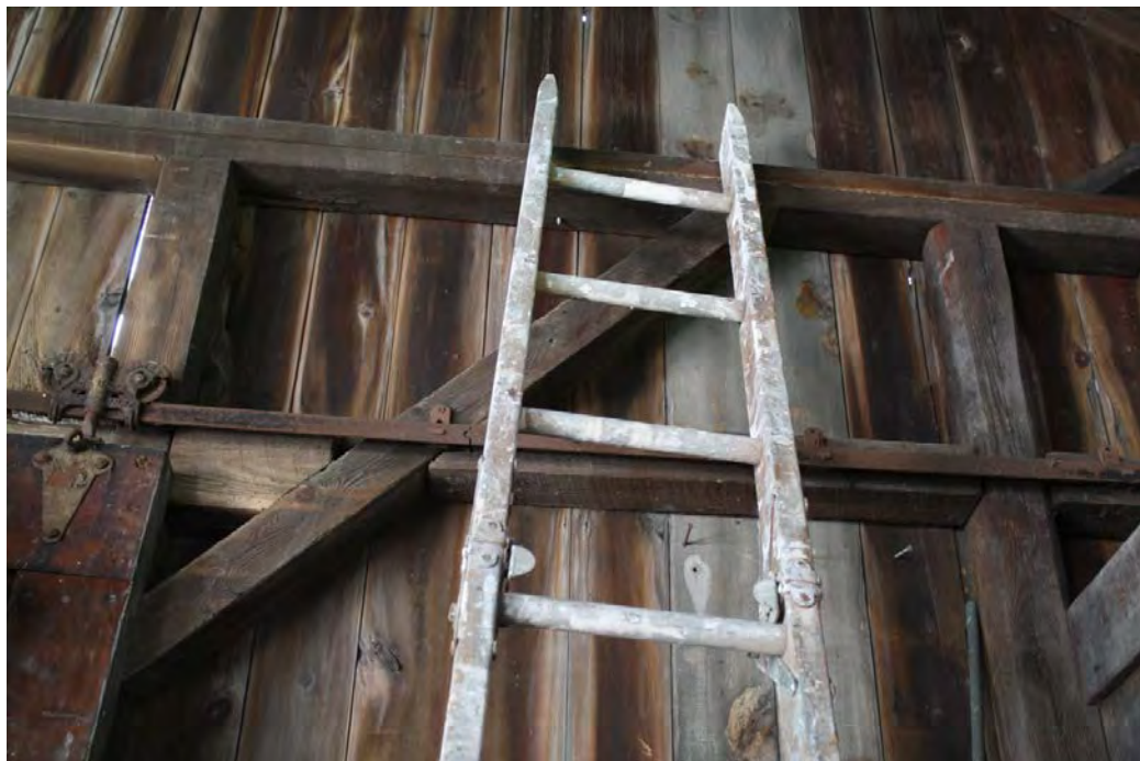
12. Interior view of west gable-end wall showing framing and sliding door at lower left, camera facing west.