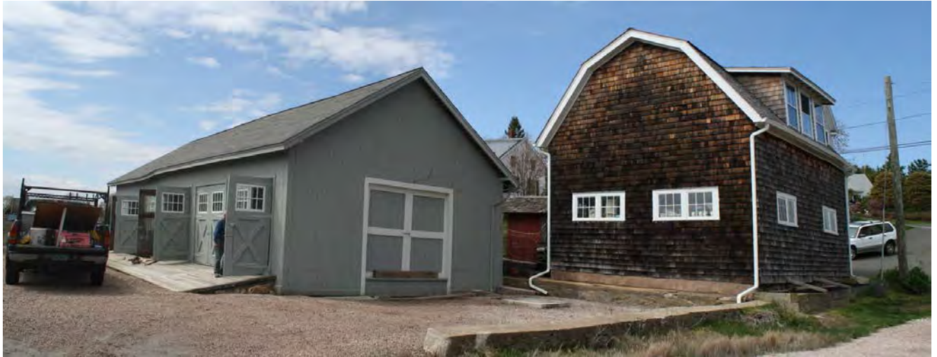
9. Southeast view of Boat shed I (left) and Carriage barn/garage II (right), camera facing northwest.