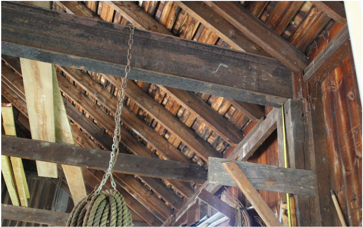
13. Interior view – north end of steel hoist beam, camera facing northwest.