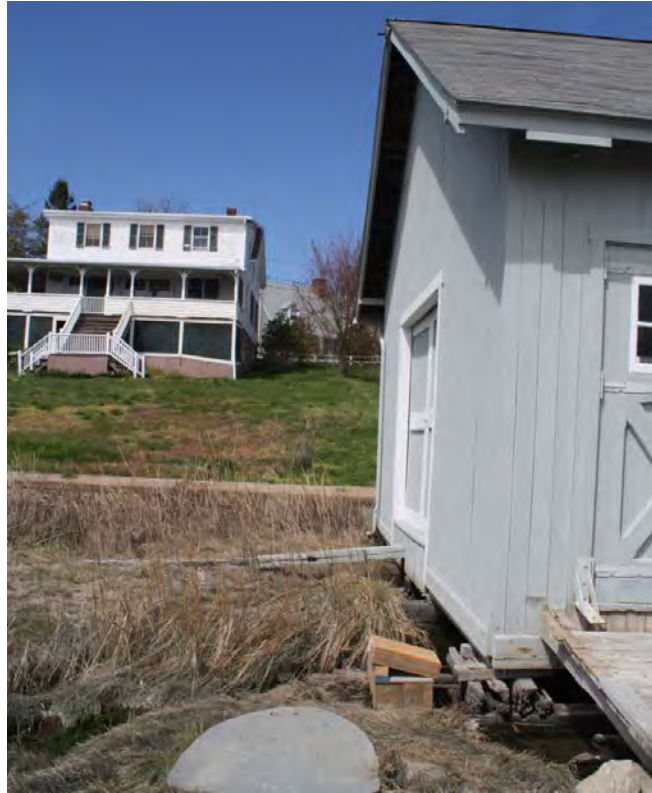
11. South view of corner of Boat shed I, showing crib foundations on mud, camera facing north. 184 Falcon Road is at left rear.