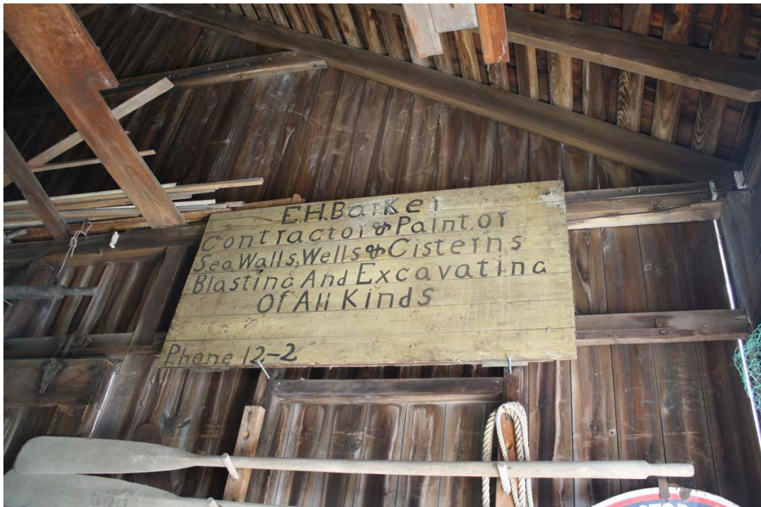
14. Interior view of east gable-end wall, with E. H. Barker's sign; camera facing east.