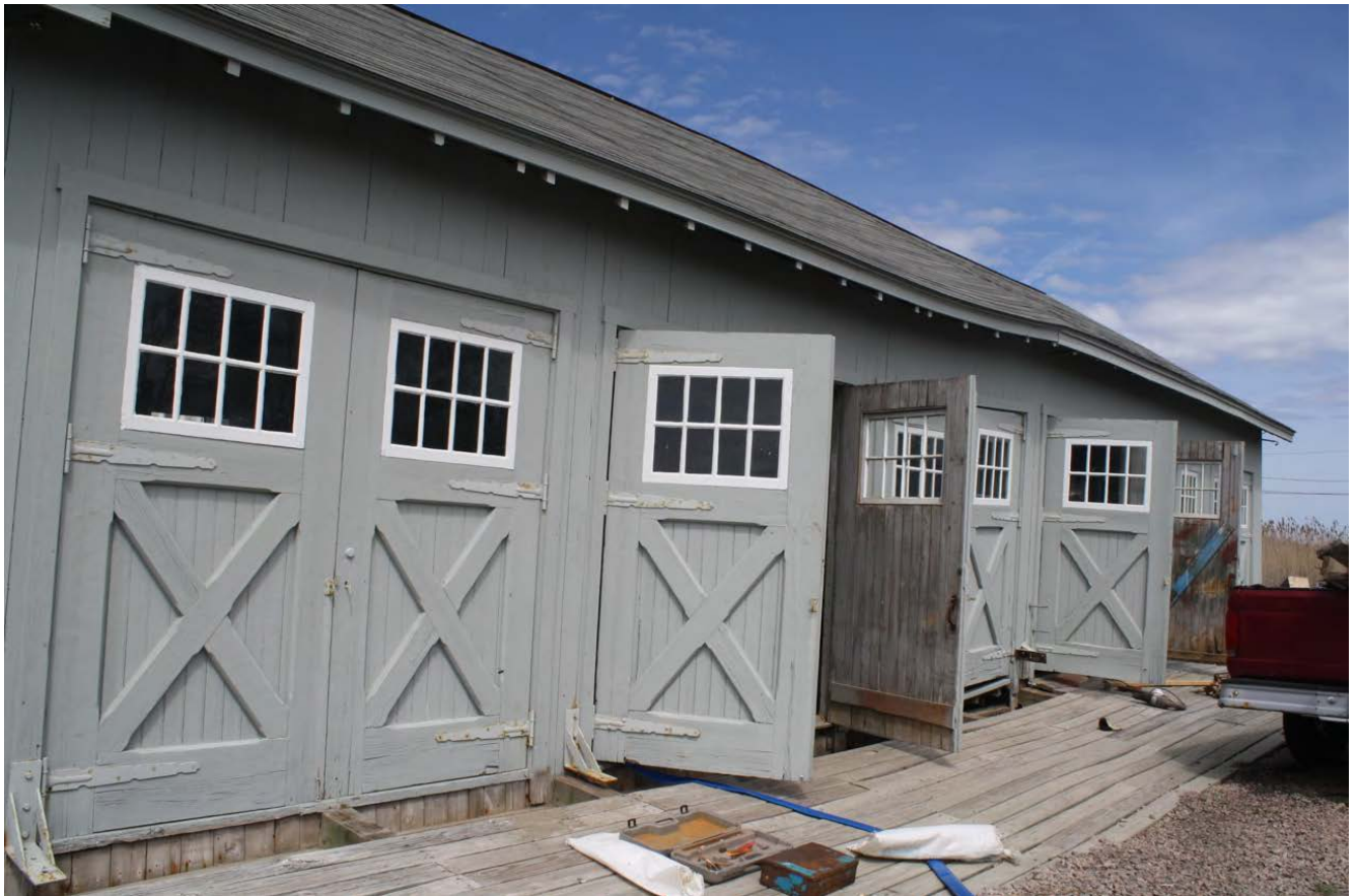
10. South view of Boat shed I showing doors; camera facing northeast.