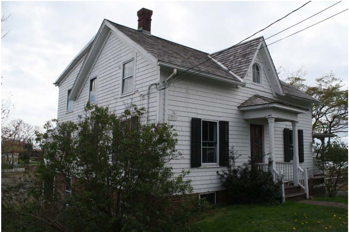
5. Northeast view of house at 184 Falcon Road, camera facing southwest; this is the second house built and owned by George B. Wingood.