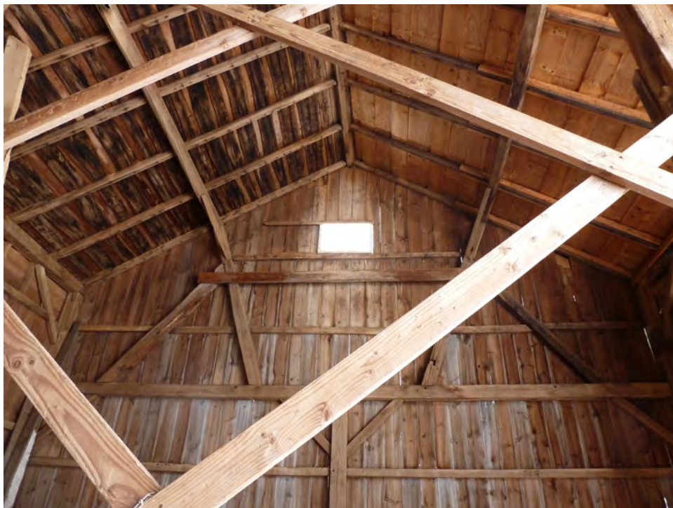
16. Interior view of the east gable-end of the barn. Note the canted queen posts. Camera facing east.