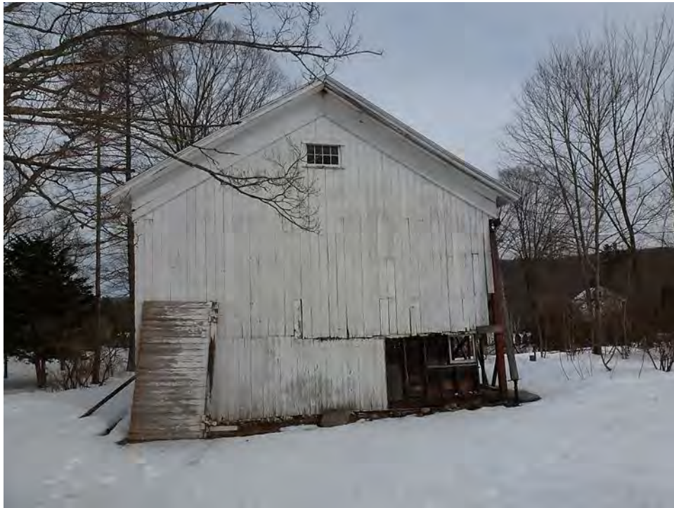
15. West gable-end of the Barn. Camera facing east.