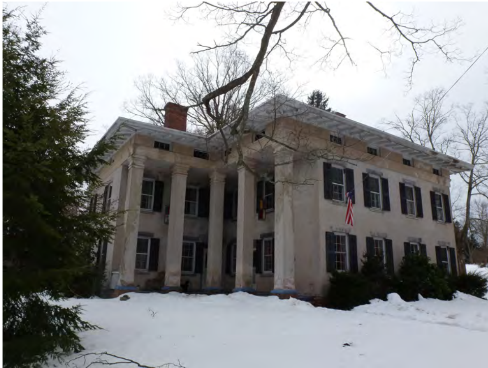
7. Northeast view of the House. Camera facing southwest.