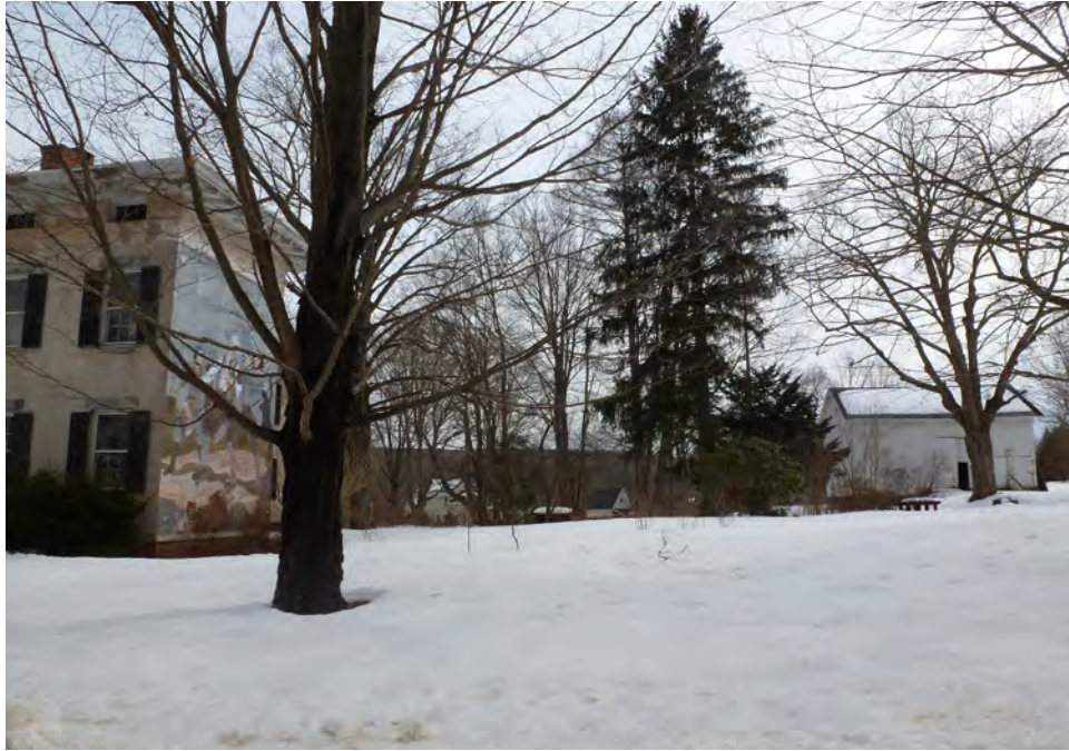
5. North context view of the House (at left) and Barn (at right). Camera facing south.