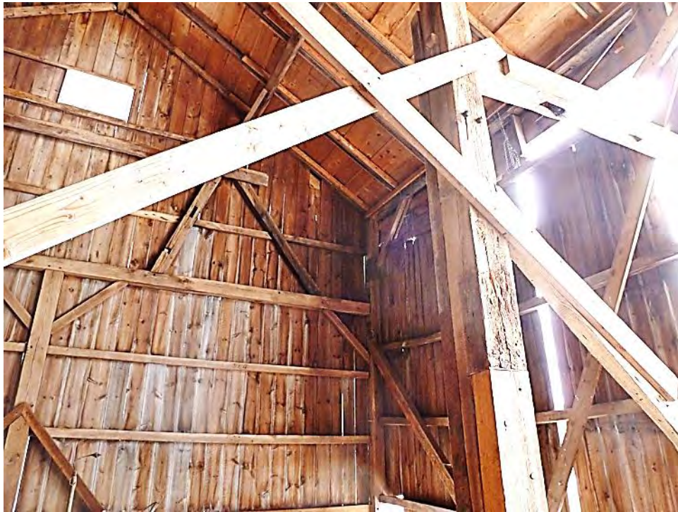
17. Interior view of the southeast corner of the barn. Note the dropped girtd that is attached to the post by the mortise and tenon joint. Camera facing southeast.