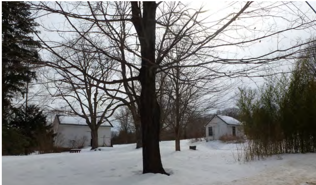
6. Northeast context view of the Barn (at left) and the Shed (at right). Camera facing southwest.