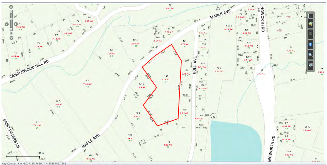
2. Parcel map of 37 Maple Avenue, Haddam, CT – from http://107.20.209.214/HaddamCT_Public/index.html - accessed 3/12/2013.