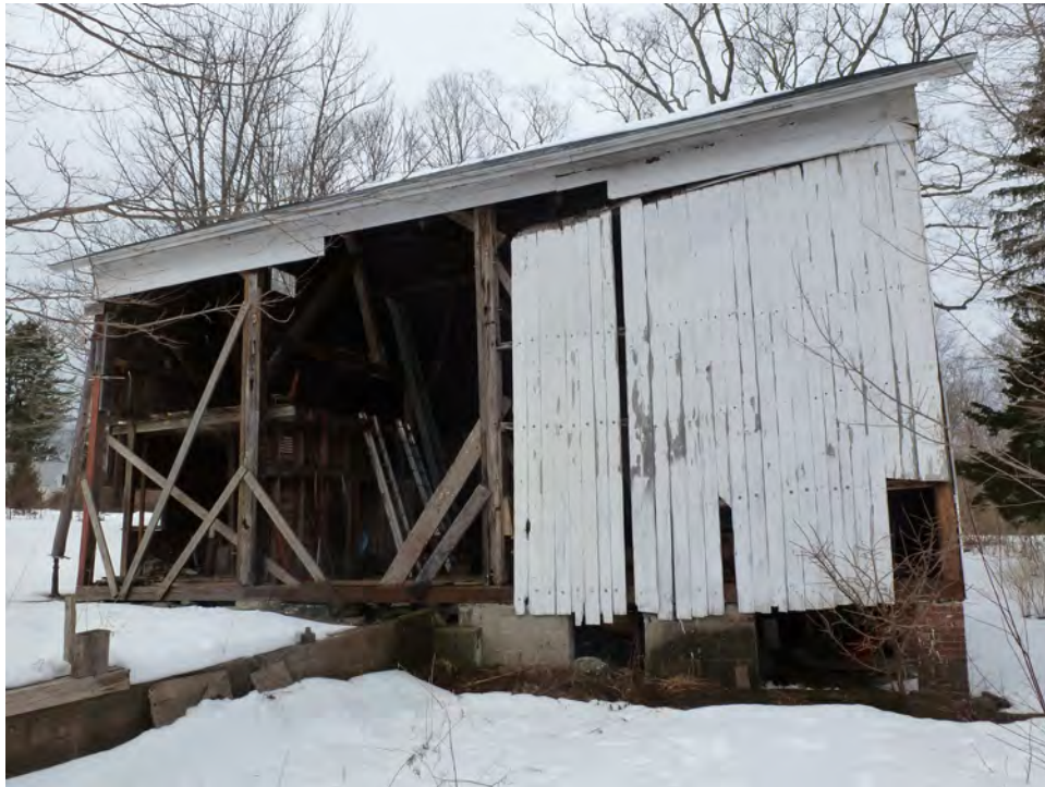
13. South eave-side of the Barn. Camera facing north.