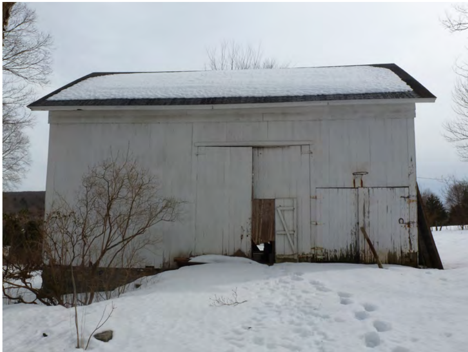
10. North eave-side of the Barn. Camera facing south.