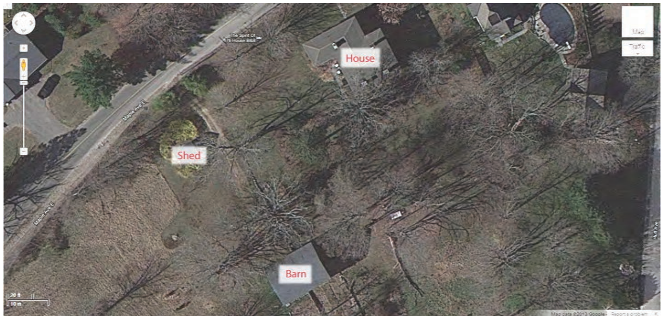
4. Site map of 37 Maple Avenue, Haddam, CT – base image from http://maps.google.com – accessed 3/12/2013.