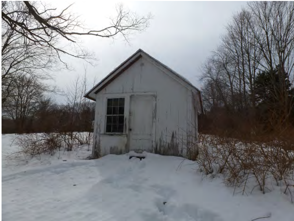
9. East gable-end of the Shed. Camera facing west.