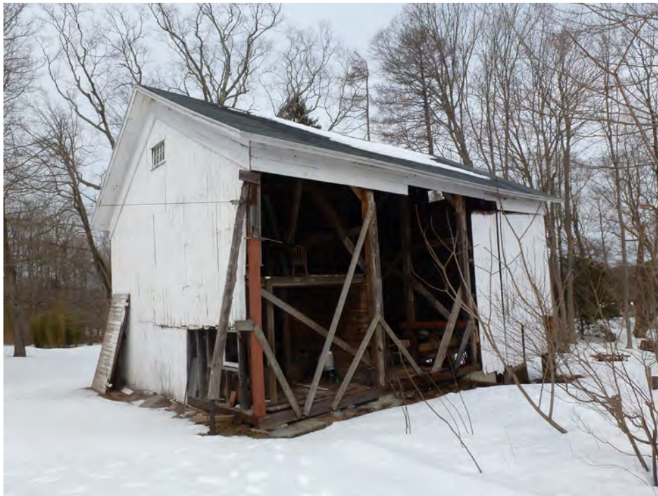
14. South eave-side and west gable-end of the Barn. Camera facing northeast.