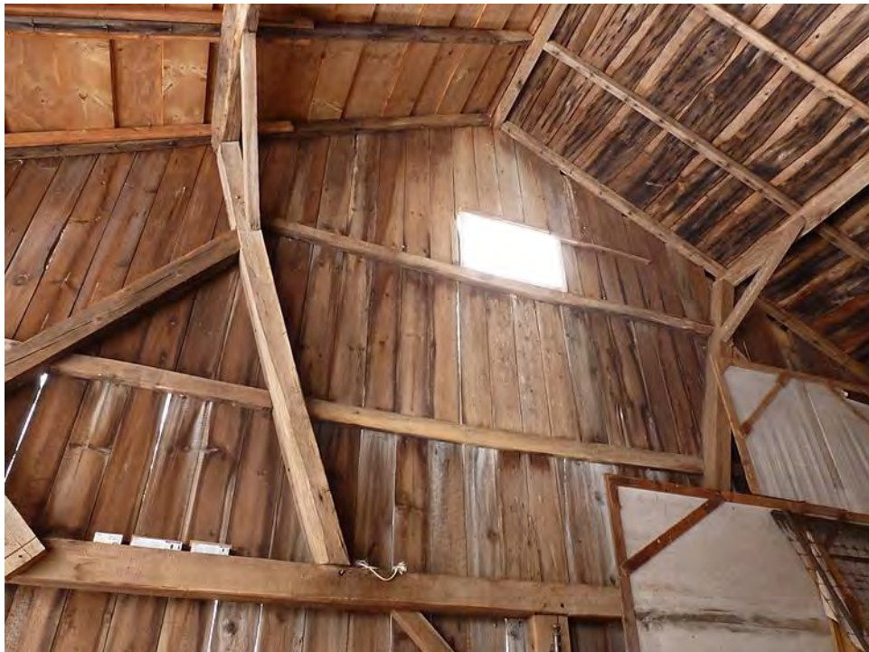
18. Interior view of the west gable-end of the barn. Note the canted queen posts and the common rafters meeting at the peak with a ridge-pole. Camera facing west.