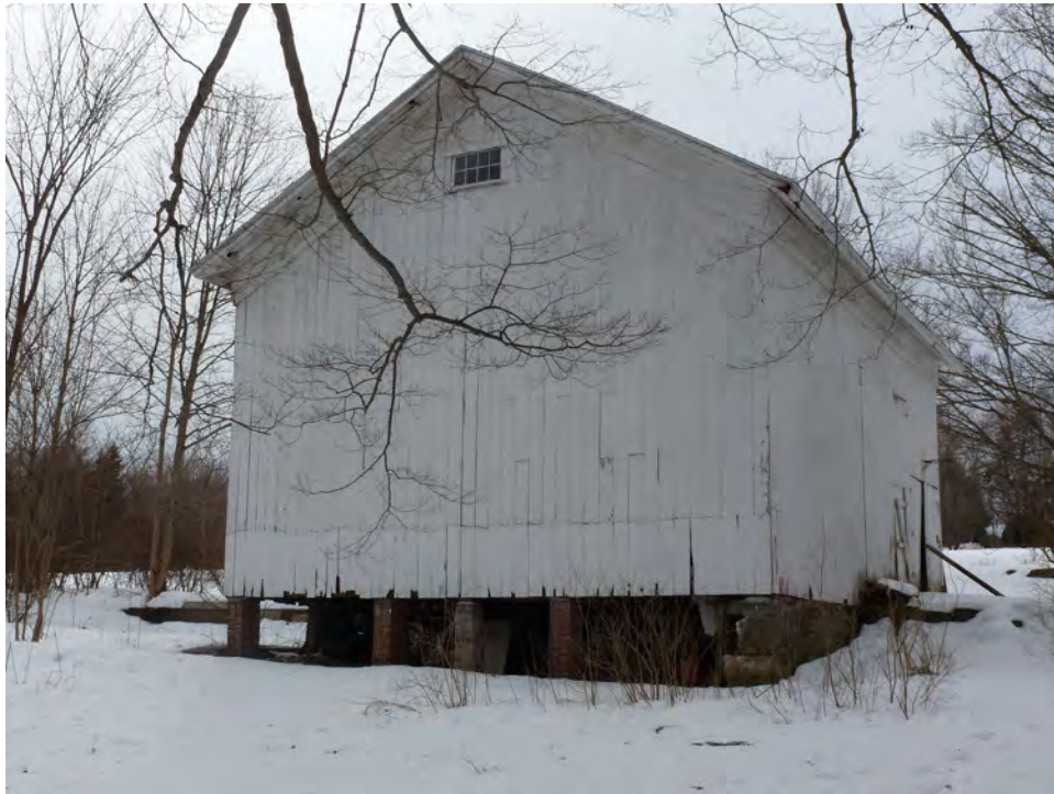
11. North eave-side and east gable-end of the Barn. Camera facing southwest.