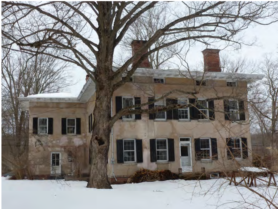
8. South view of the House. Camera facing north.