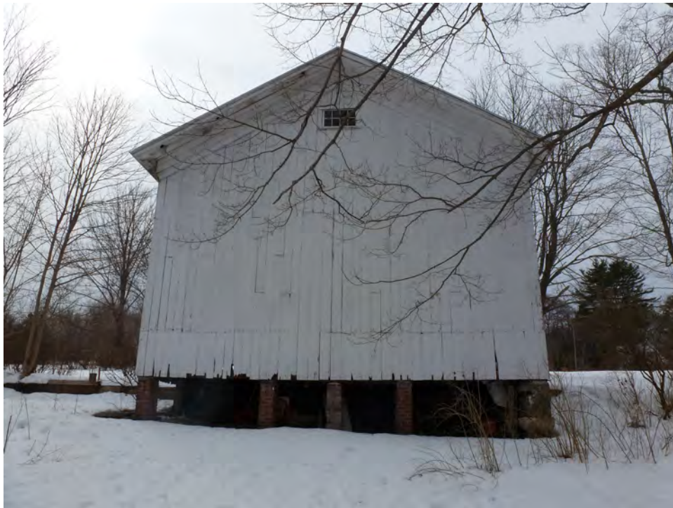
12. East gable-end of the Barn. Camera facing west.