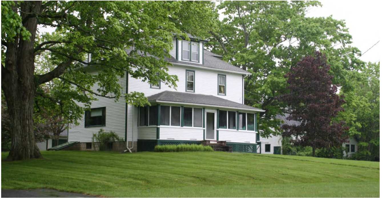
6. Southeast view of Farmhouse with barn at right rear, camera facing northwest.