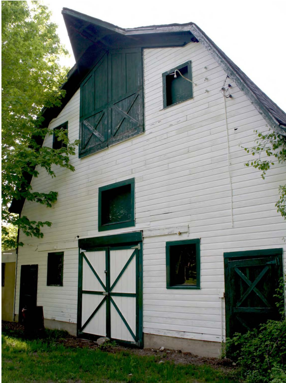
8. South view of Barn gable-end, camera facing north.