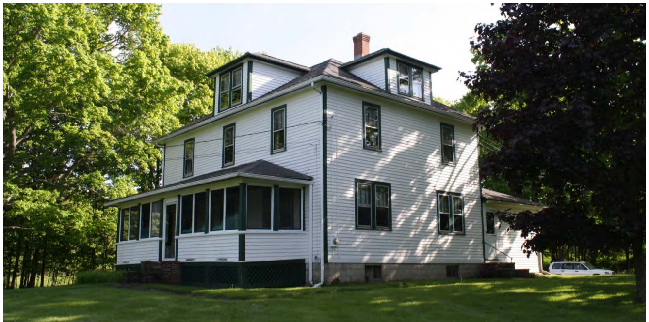
5. Northeast view of Farmhouse, camera facing southwest.