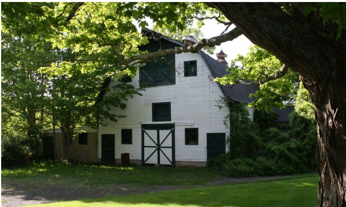
7. South view of the gable-end of the Barn, camera facing north. West addition is visible at far left.