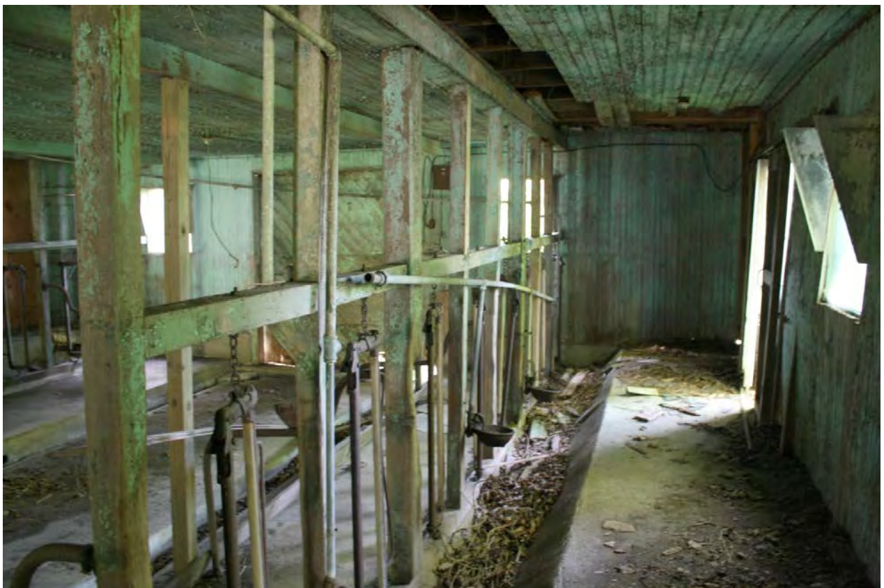
12. Interior view of ground level stable area, camera facing north. East wall with door opening to silo site is at right. Note stanchions, remains of automatic watering system, and feed trough formed into floor.