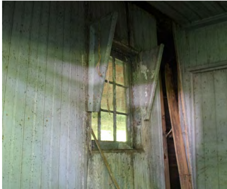
11. Interior view of extant original window located in feed room, camera facing west.