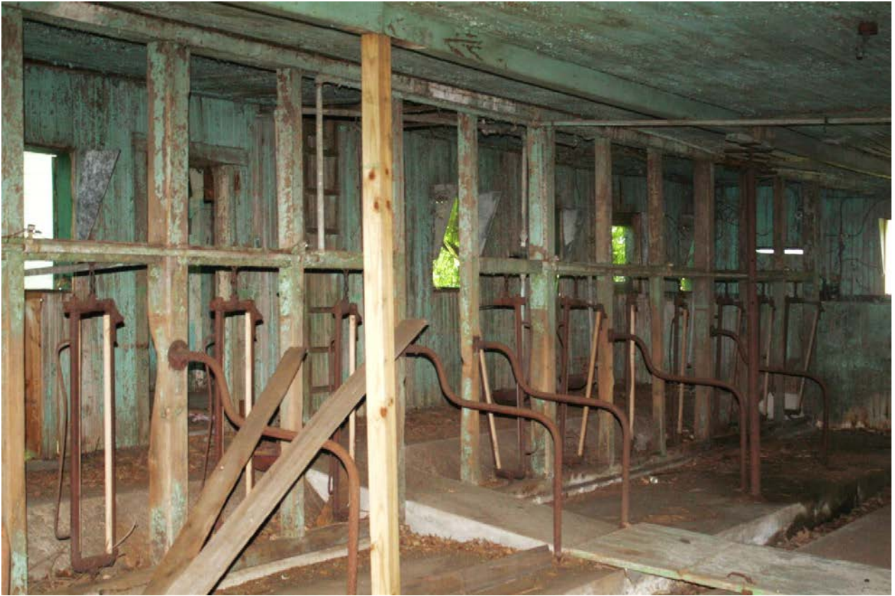
13. Interior view of ground level stable area, camera facing southeast. At left is the door to the Milk room, at right the typical stable windows and stanchions with stall dividers. Note the ramp transition from the walkway aisle near the outer wall to the manure aisle at center.