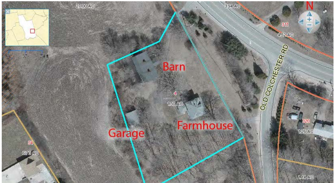
4. Parcel map of 4 Old Colchester Road, Hebron CT