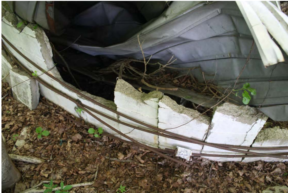
10. View of ruins of concrete stave silo, camera facing north.