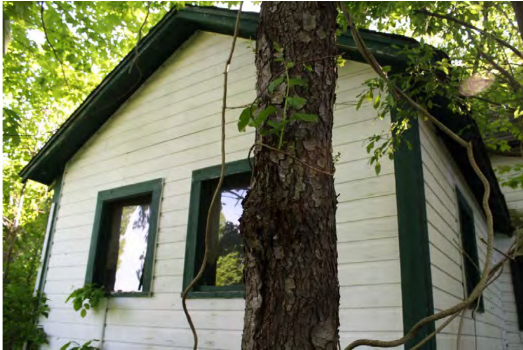
9. Northeast view of Milk room, camera facing southwest.