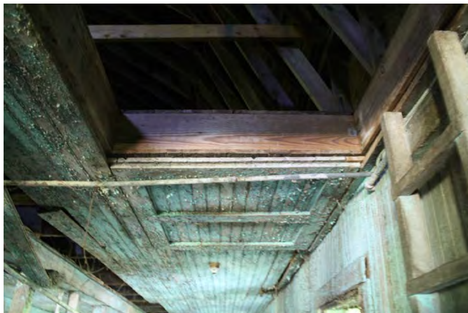
14. Interior detail view of sliding ceiling access hatch to hay loft, camera facing north.