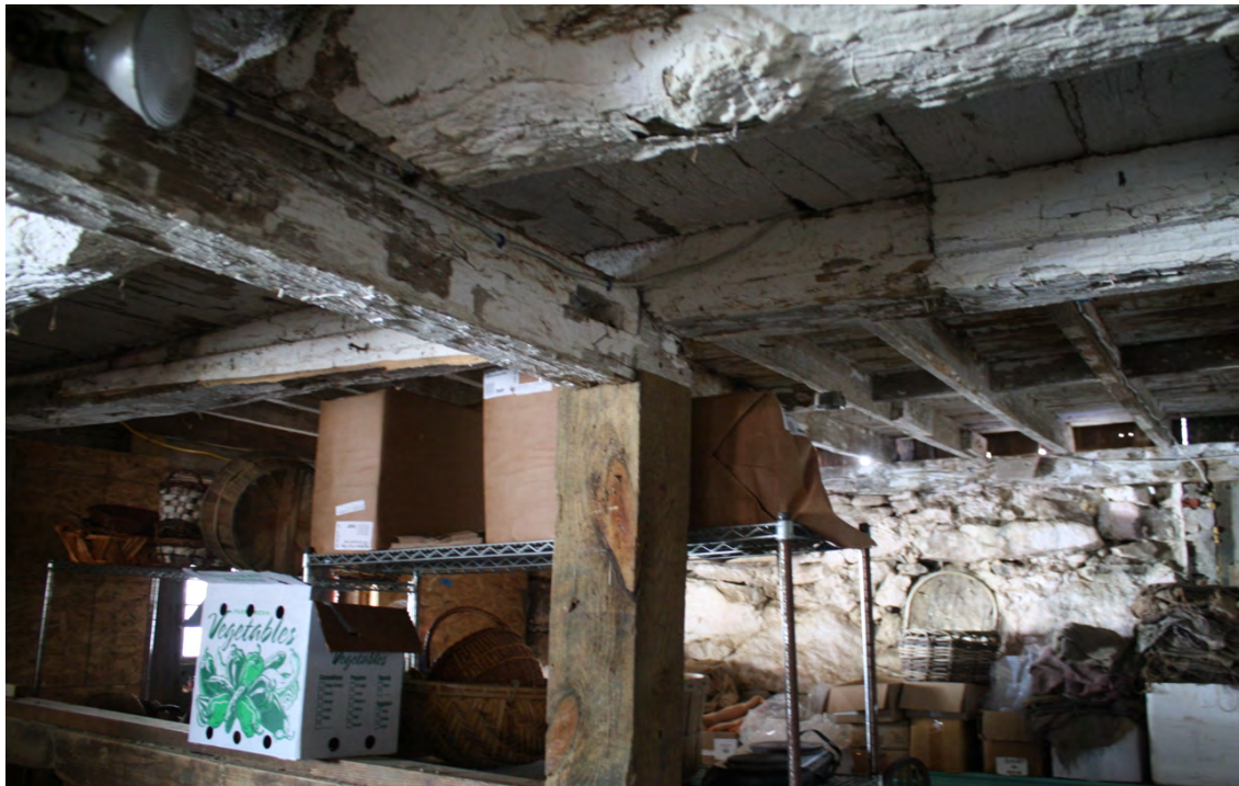
14. Interior view of North Barn basement level, camera facing north, showing the change in framing at the northern bay (right rear of photograph).