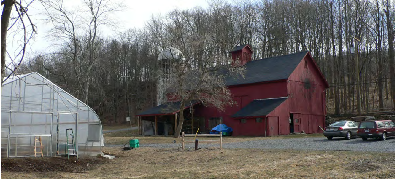
9. Southwest view of North Barn and hoop house, camera facing northeast.