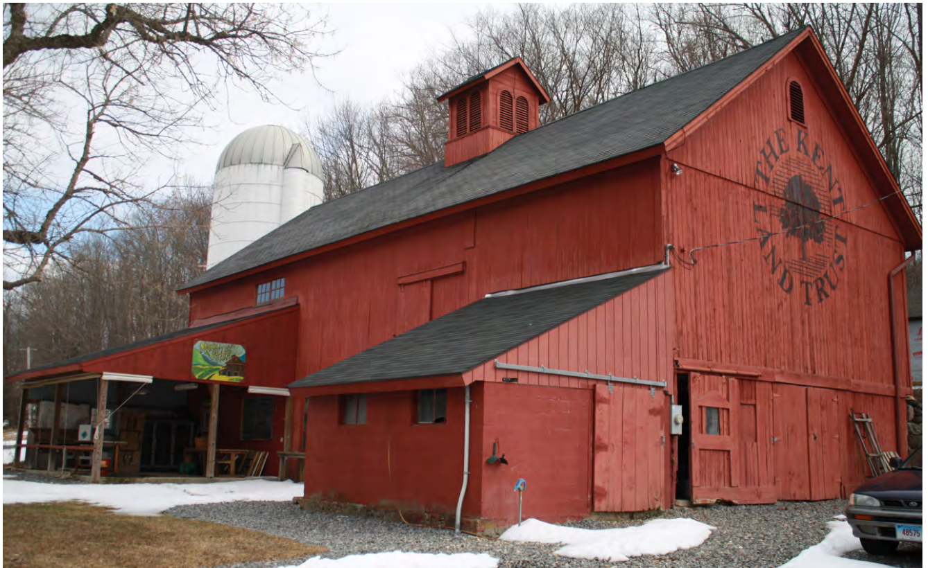
10. Southwest view of North Barn, camera facing northeast.