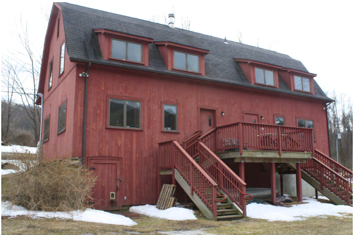
6. West view of South Barn, camera facing southeast, showing the alterations for the current uses as office space at the main level and an apartment above.