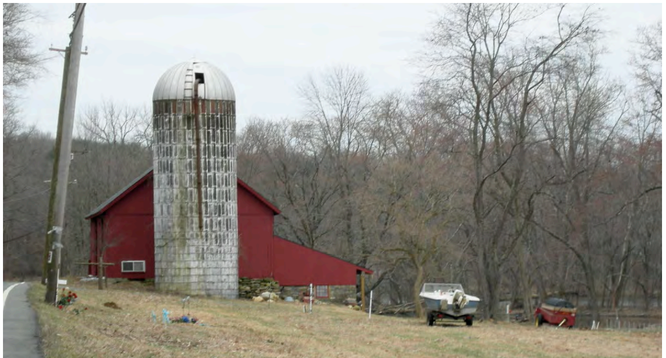
12. North view of North Barn, camera facing south.