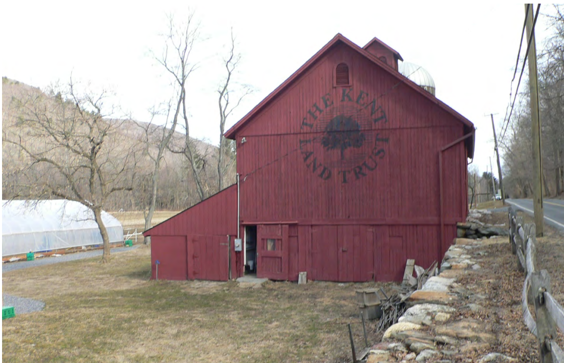
8. South view of North Barn, camera facing north.