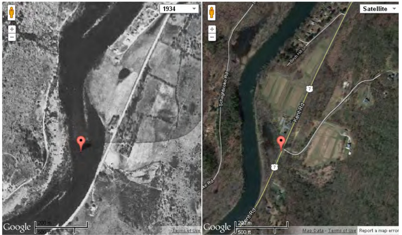
19. Fairchild 1934 aerial photograph at left, showing the site comparison with Google Map view at right.