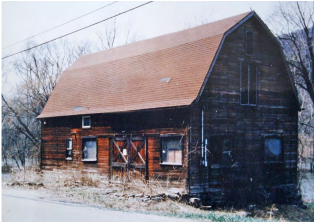
17. Photograph of South barn c. 1996 prior to renovation, camera facing southwest, courtesy of Kent Land Trust.