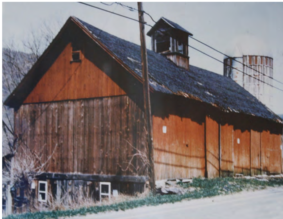
18. Photograph of North barn c. 1996 prior to renovation, camera facing northwest, courtesy of Kent Land Trust.