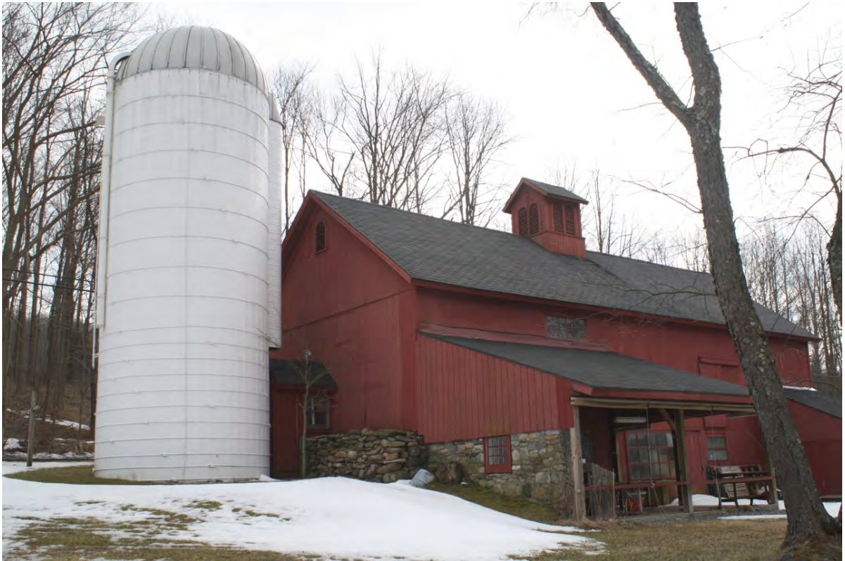
11. Northwest view of North Barn and silo, camera facing southeast.