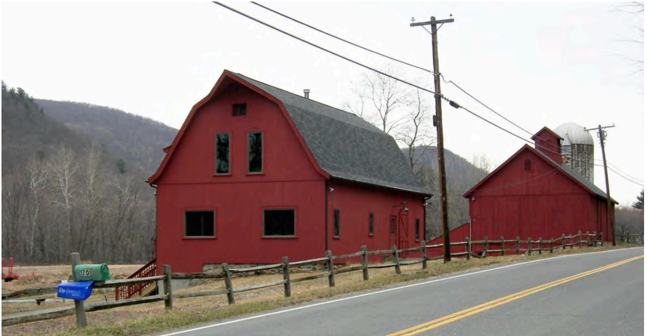
5. Southeast view of South Barn at left and North Barn at right rear, camera facing northwest.