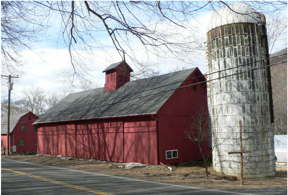
7. Northeast view of North Barn and Silo, with South Barn at left rear, camera facing southwest.