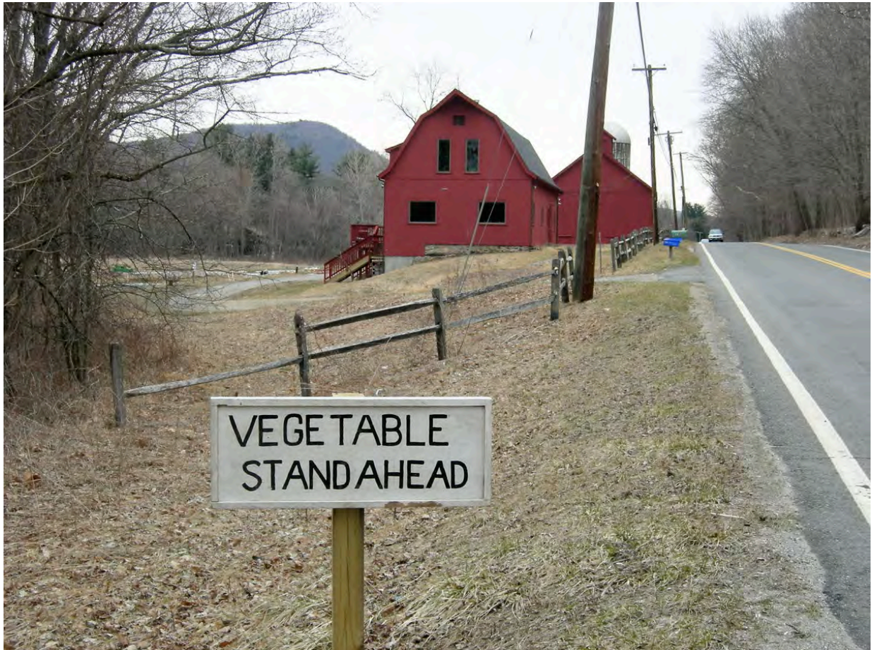
4. South view of South Barn with North Barn at rear, camera facing north.