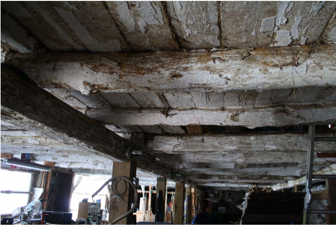
13. Interior view of North Barn basement level, camera facing north. Note hand hewn girders and joists.