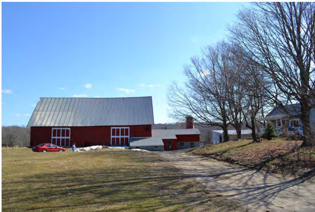
6. North context view of 1041 Exeter Road, Lebanon, CT, camera facing south. From left to right, Barn, Chicken coop, rear ell of Farmhouse.