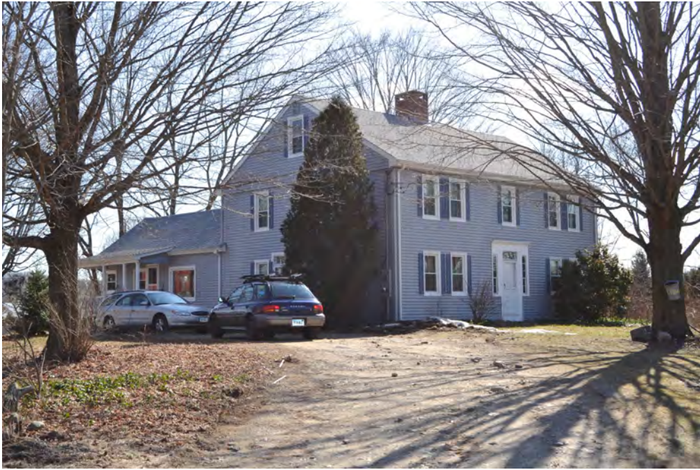
9. North eave-side and east gable-end of Farmhouse and west eave-side of rear ell, camera facing southwest.