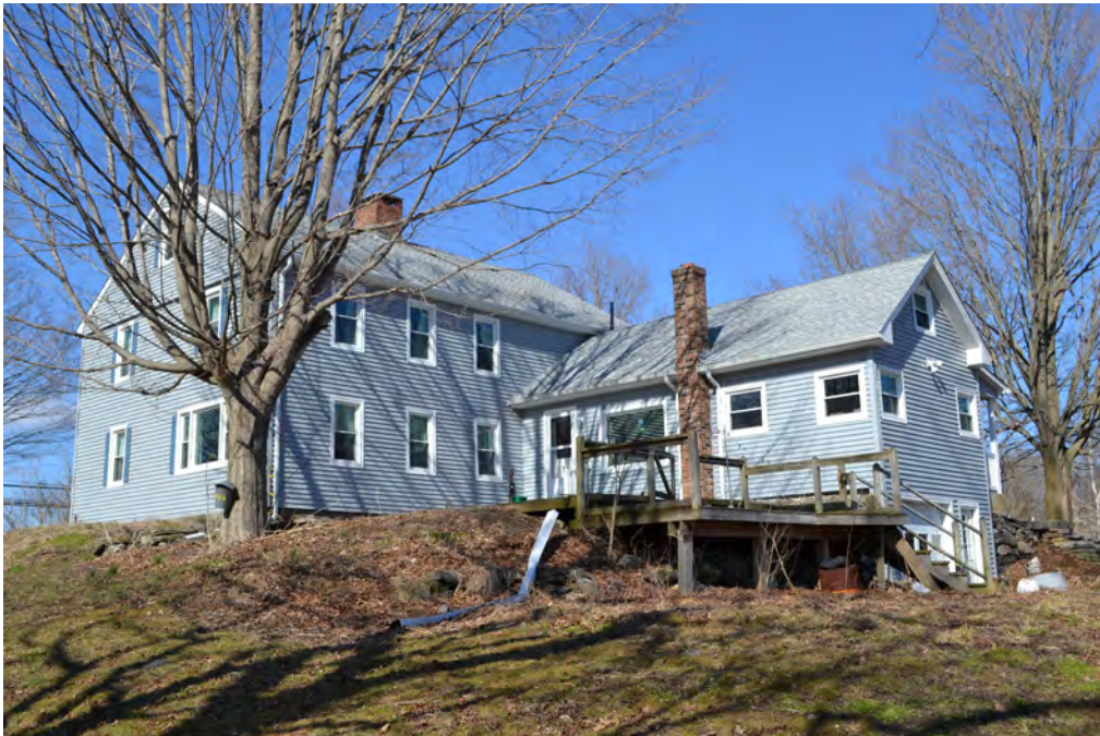
10. South eave-side and west gable-end of Farmhouse and west eave-side and south gable-end of rear ell, camera facing northeast.