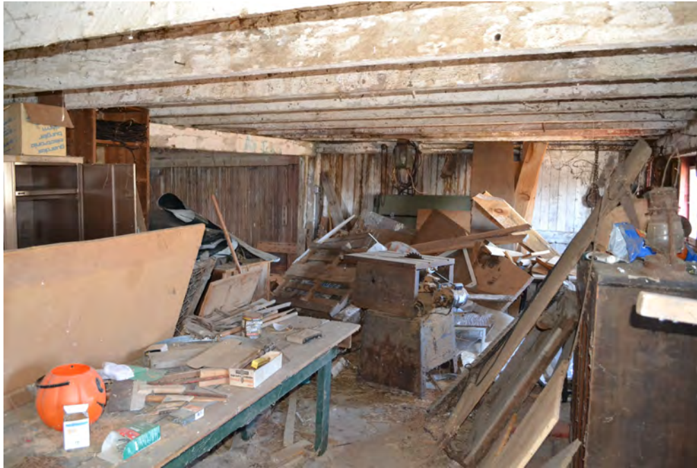
23. Interior view of Barn main level easternmost bay, showing interior details, camera facing north. Note whitewashed walls, floor joists above.