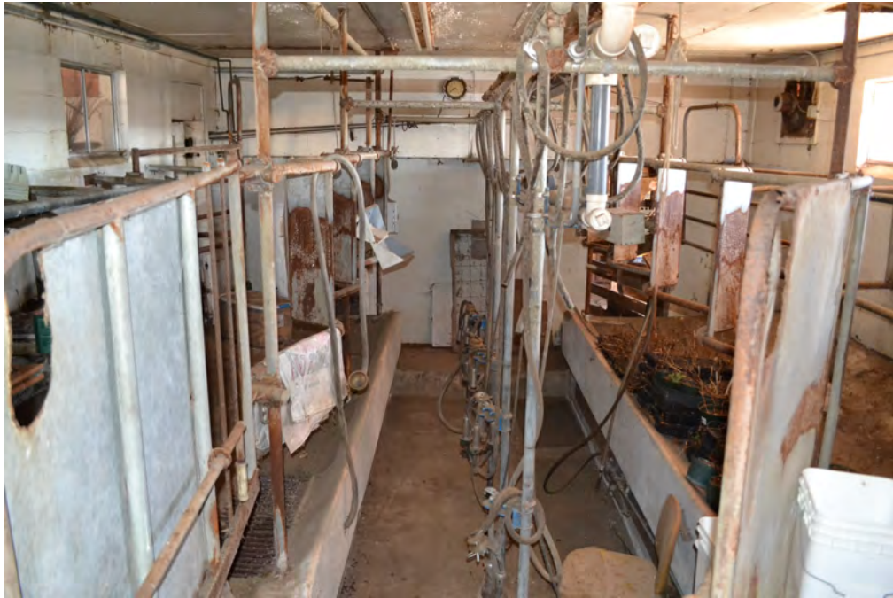
25. Interior view of Barn milking parlor, showing interior details, camera facing east. Note recessed milking station, milking equipment.