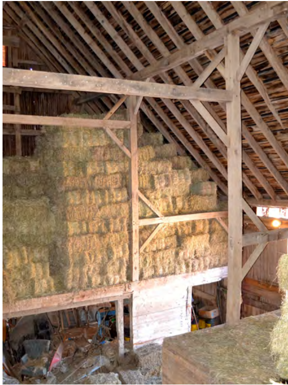
19. Interior view of Barn main and loft levels, showing framing details, camera facing northwest. Note mixed hand-hewn and sawn posts, girts, and purlin, sawn braces.