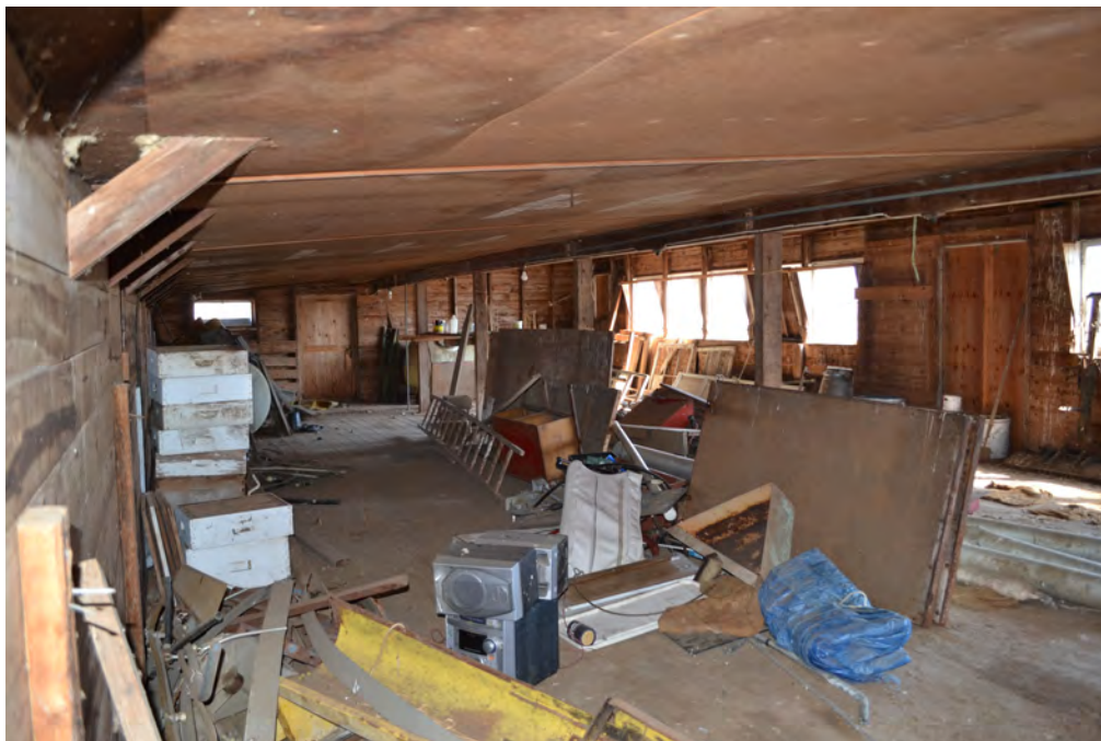
34. Interior view of Chicken coop upper level, showing framing and interior details, camera facing southeast.