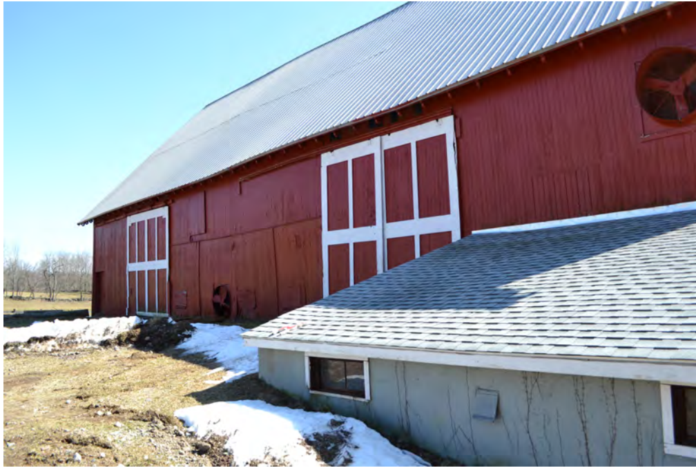
13. North eave-side of Barn and milk room, camera facing southeast. Note east and west sliding doors, center side-hinged doors, ventilator fans.