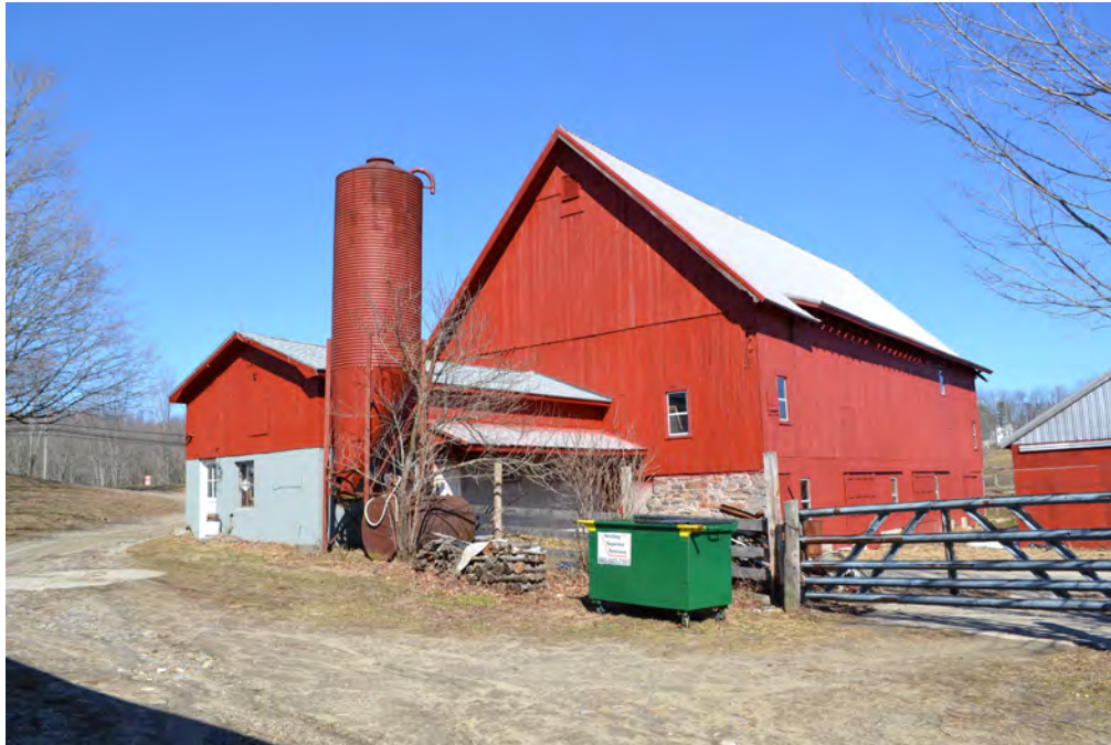
15. South eave-side and west gable-end of Barn, camera facing northeast. Note and milking parlor/office addition, and grain silo at left, Garage at far right.