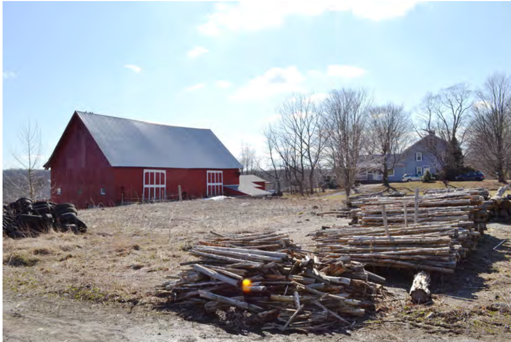
5. Northeast context view of 1041 Exeter Road, Lebanon, CT, camera facing southwest. Barn is at left, Farmhouse at right.