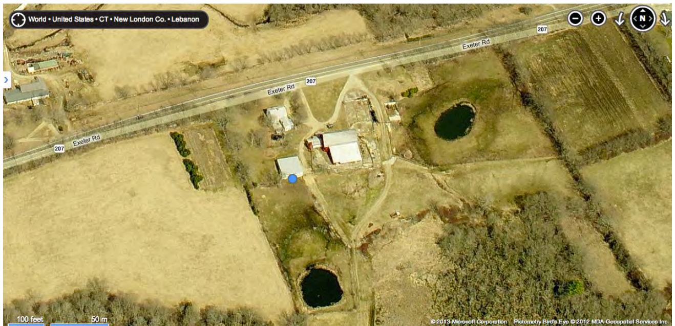
2. Southern view – aerial “bird’s-eye” map of 1041 Exeter Road, Lebanon, CT – http://www.bing.com/maps accessed 3/13/2013. Note: this photograph, from before 2011, shows the shed-roofed addition to the Barn.