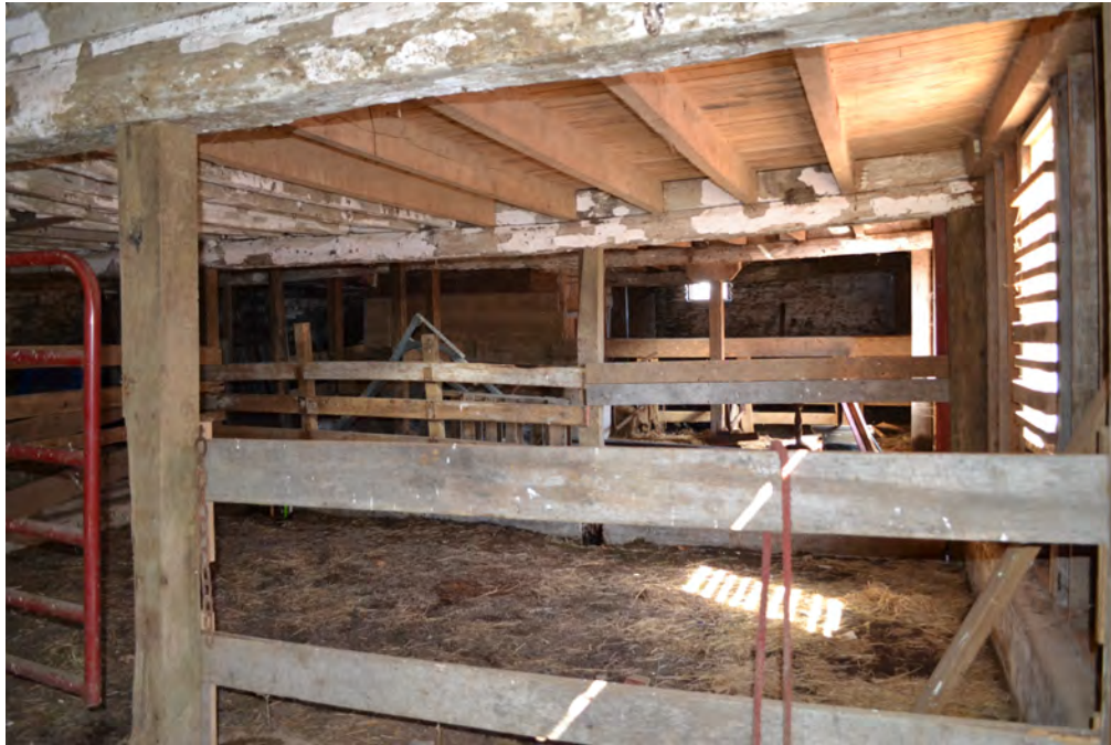
29. Interior view of Barn lower level, showing framing and interior details, camera facing east. Note birthing stall.