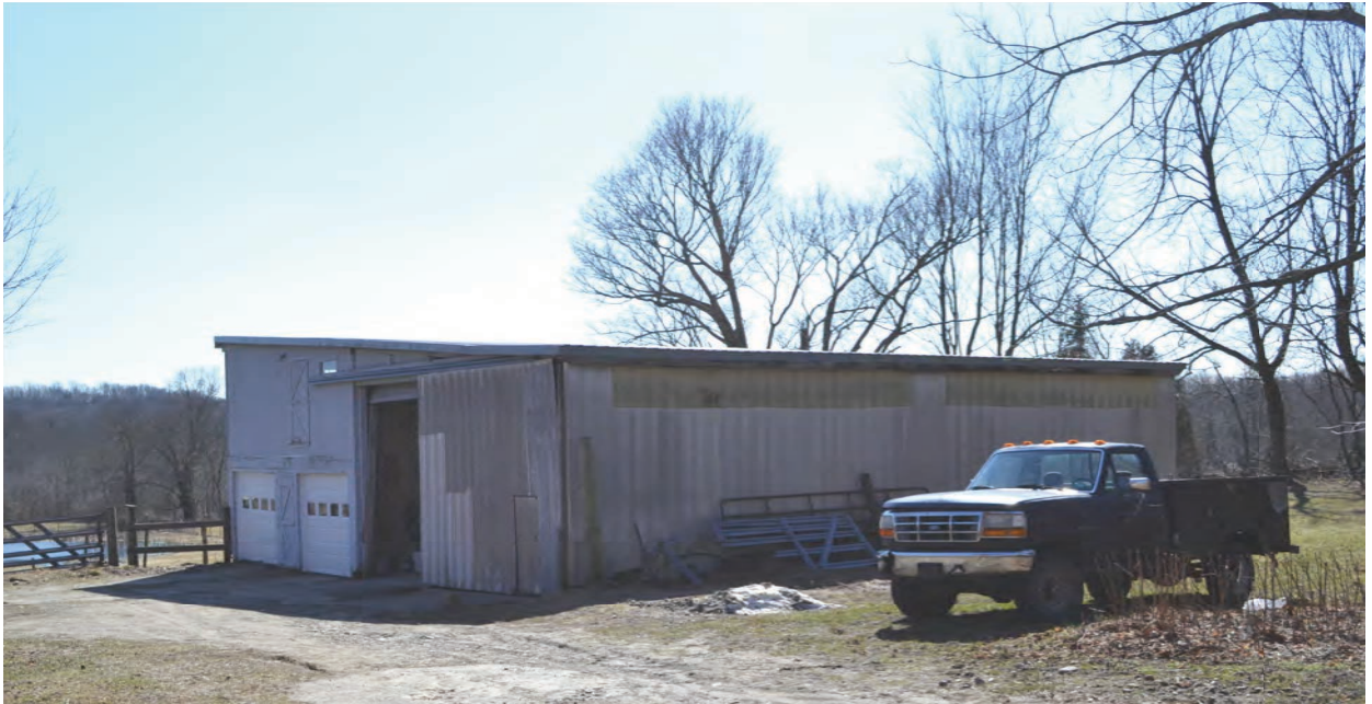
31. East gable-end and north eave-side of Chicken coop, camera facing southwest. Note workshop addition on north eave-side.