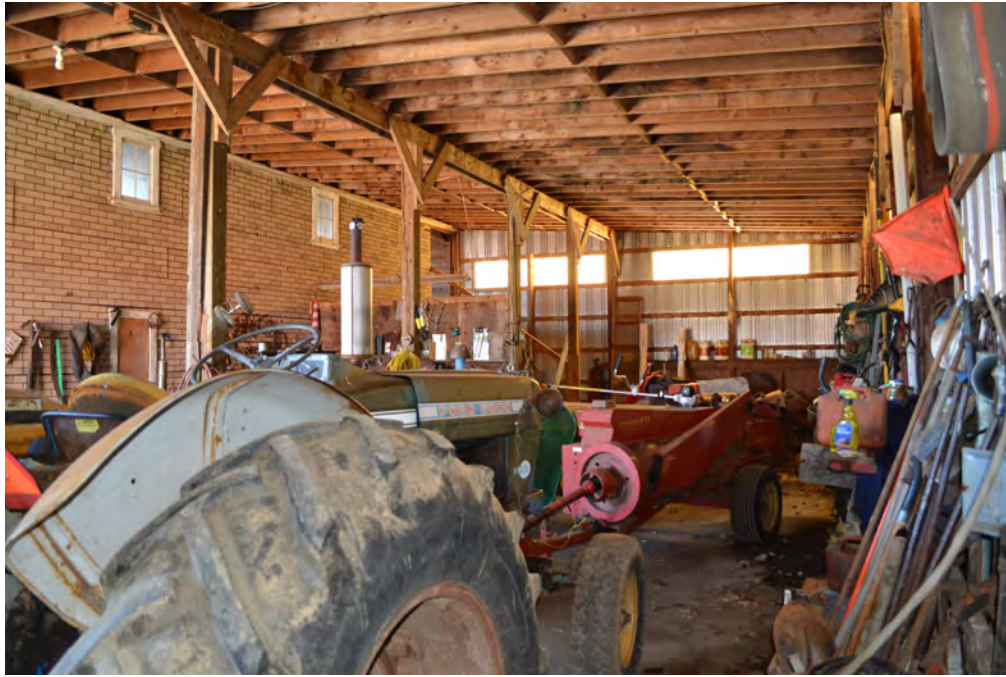
33. Interior view of Workshop addition to Chicken coop, showing framing and interior details, camera facing southwest. Note original north eave-side of Chicken coop at left, workshop area at right.