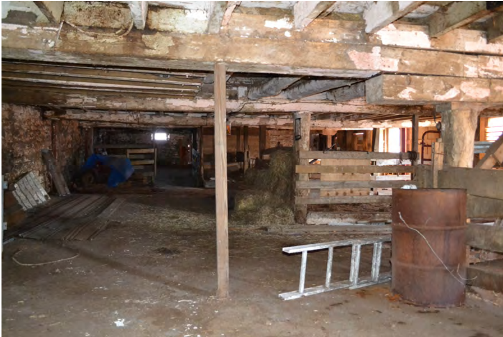
27. Interior view of Barn lower level, showing framing details, camera facing east. Note mixed hand hewn and sawn posts, girders, and joists.