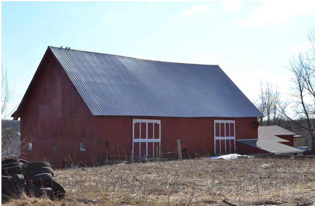
12. North eave-side and east gable-end of Barn, camera facing southwest.