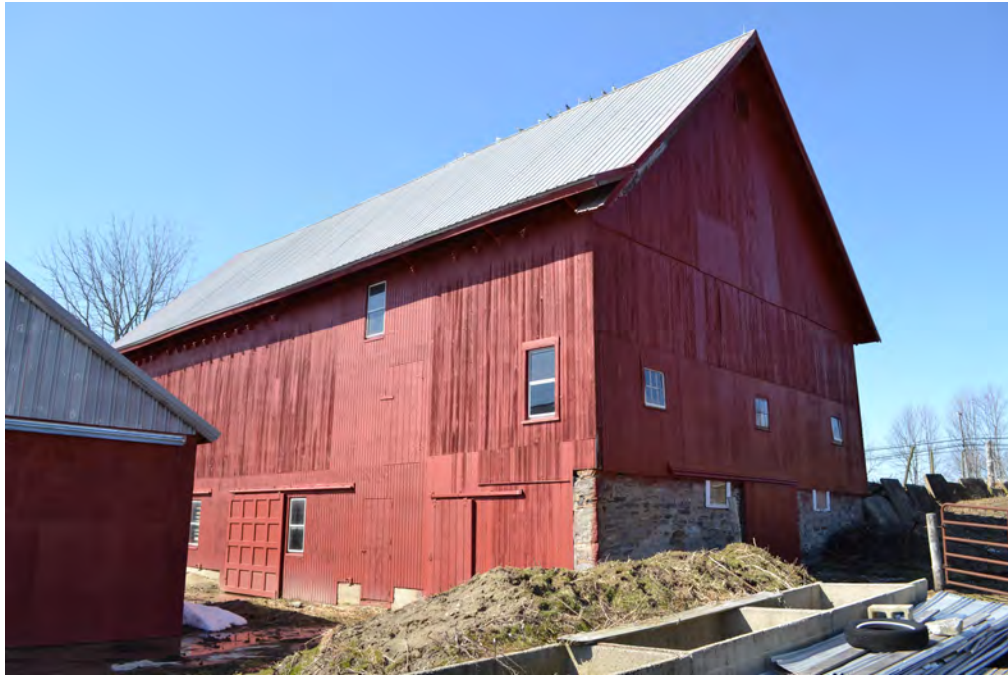
17. South eave-side and east gable-end of Barn, camera facing northwest. Note sliding door on east gable-end lower level, Garage at left.