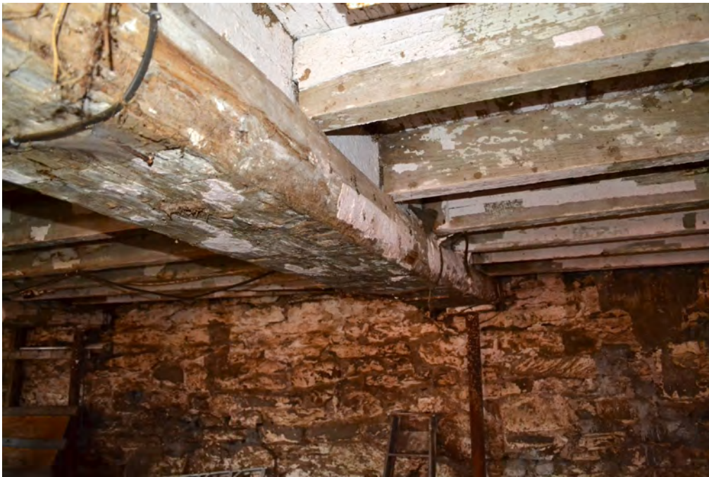
28. Interior view of Barn lower level, showing framing details, camera facing north. Note 18” hand-hewn girder, sawn joists, lally column.