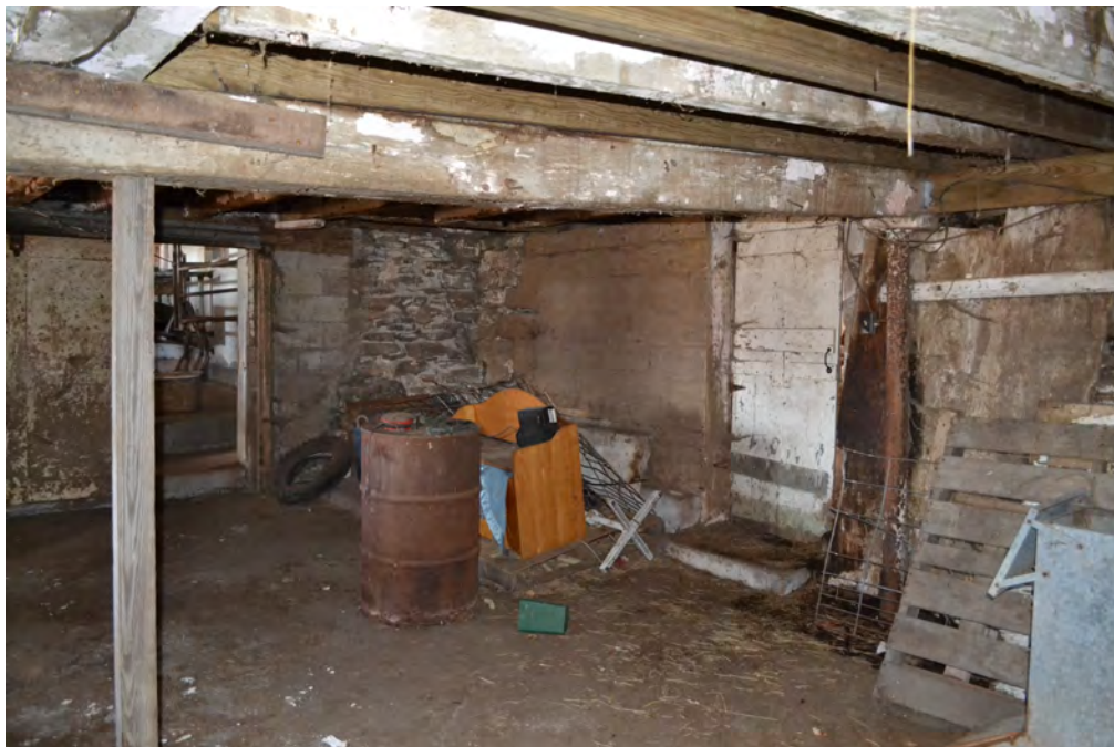
30. Interior view of Barn lower level, showing framing and interior details, camera facing northwest. Note sliding door to milking parlor at left, pass-through door to milk room at right.