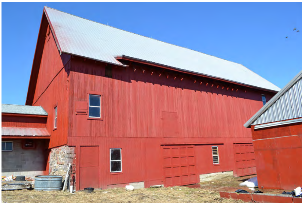
16. South eave-side and west gable-end of Barn, camera facing northeast. Note sliding and pass-through doors on lower level, roof-line at junction with former free-stall barn addition, and extant sawn rafter tails.