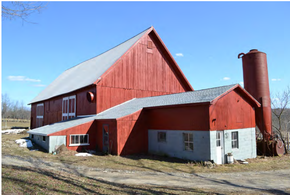
14. North eave-side and west gable-end of Barn, camera facing southeast. Note milk room and milking parlor/office additions, grain silo.