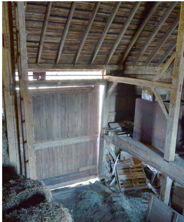
18. Interior view of Barn main and loft levels, showing framing details, camera facing southwest. Note mixed hand-hewn and sawn posts and girts, sawn braces, and north eave-side sliding door.