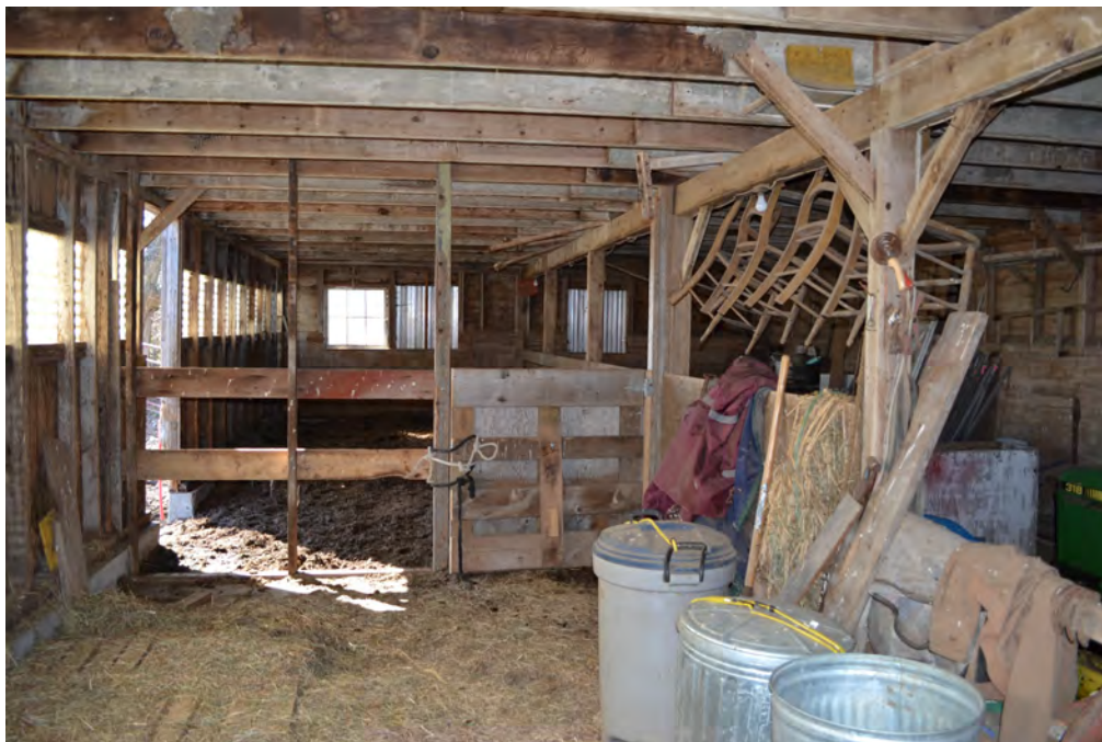
32. Interior view of Chicken coop lower level, showing framing and interior details, camera facing west. Note free stalls at left, storage area at right.