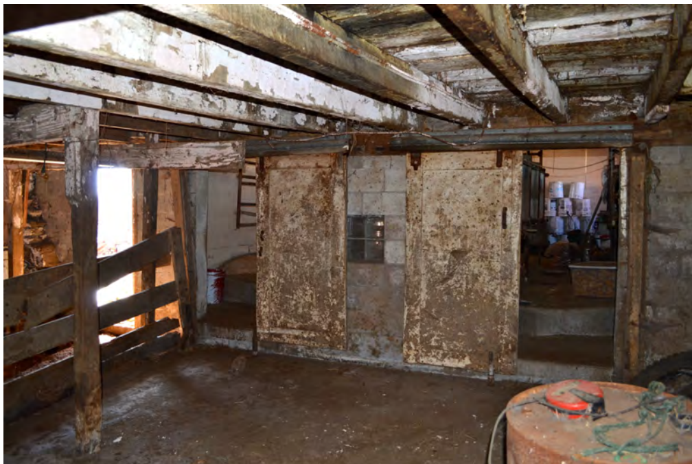
26. Interior view of Barn lower level, showing interior framing, camera facing west. Note sliding doors between milking parlor and barn.