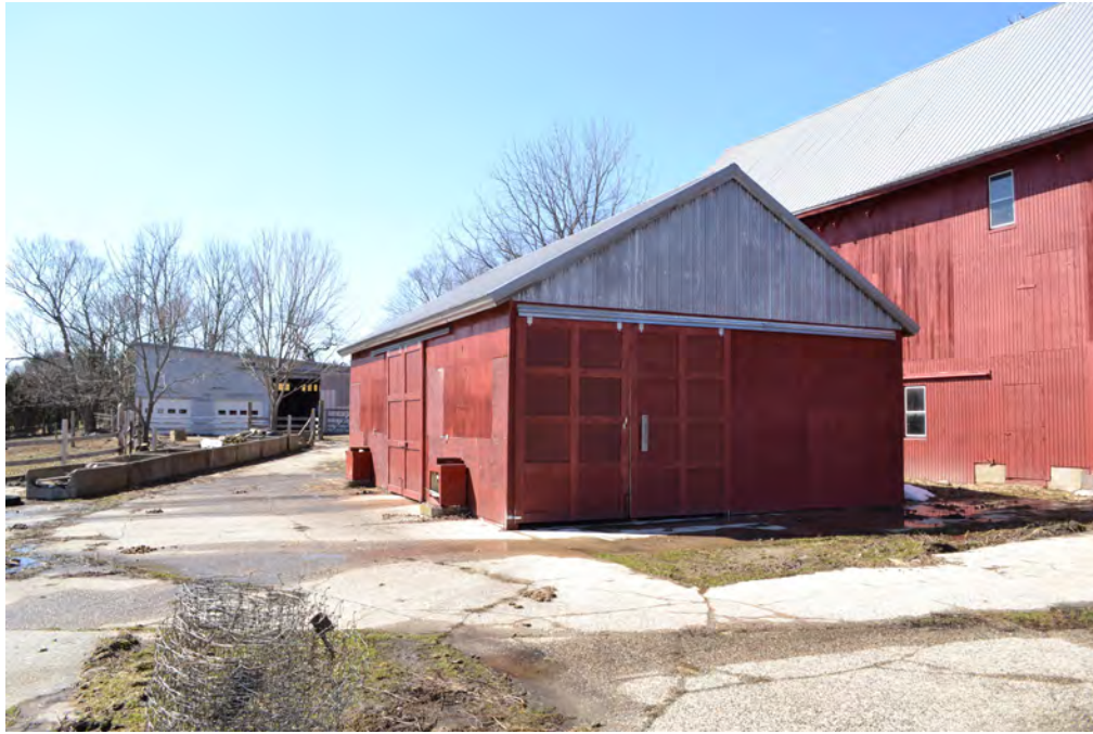
11. South eave-side and east gable-end of Garage, camera facing northwest. Note Chicken coop at left rear, south eave-side of Barn at right.