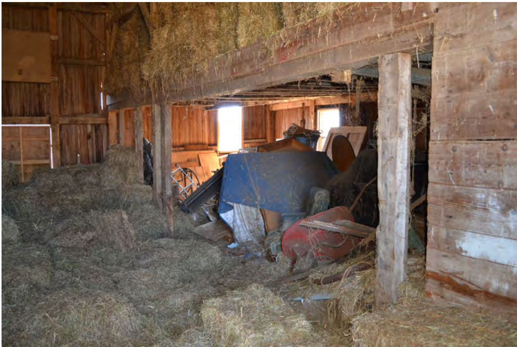
22. Interior view of Barn main level westernmost bay, showing framing details, camera facing southwest.