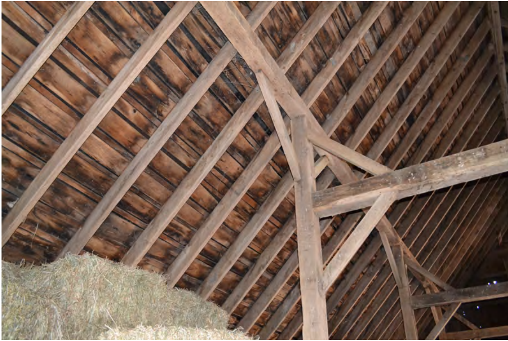
21. Interior view of Barn loft level, showing framing and roof details, camera facing southwest. Note mixed hand-hewn and sawn posts, girts, and purlin, sawn braces.