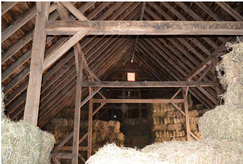
20. Interior view of Barn loft level, showing framing and roof details, camera facing west. Note mixed hand-hewn and sawn posts and girts, sawn braces.