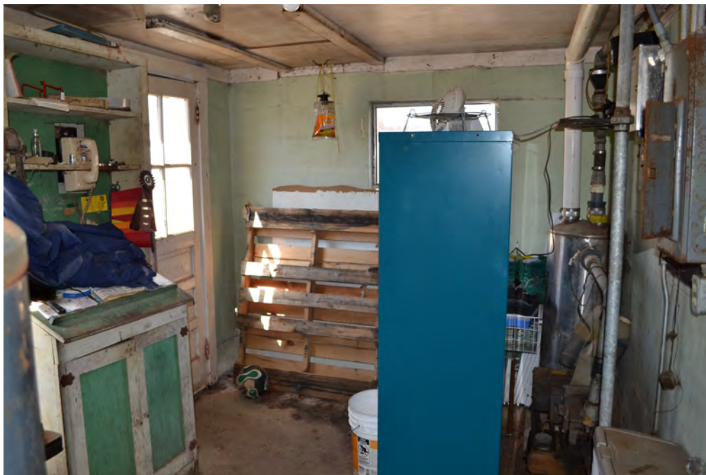
24. Interior view of Barn office, showing interior details, camera facing northwest.