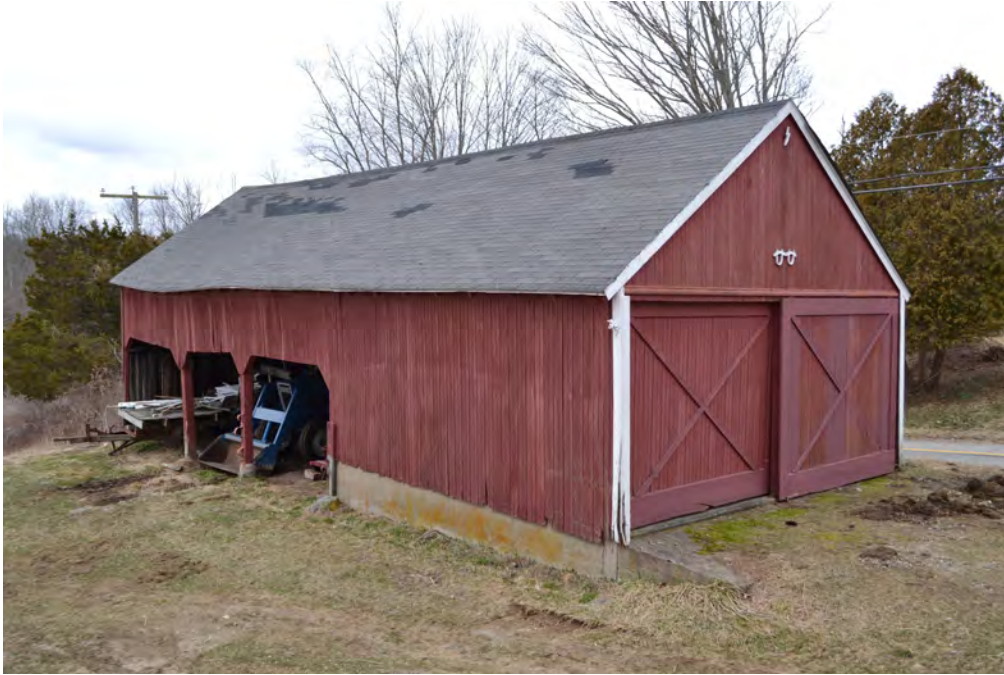
13. East gable-end and south eave-side of Wagon shed I, camera facing northwest.