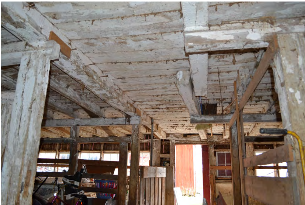
30. Interior view of Barn I lower level, showing framing details, camera facing south. Note framing alterations at junction of original portion and eastern addition to barn.