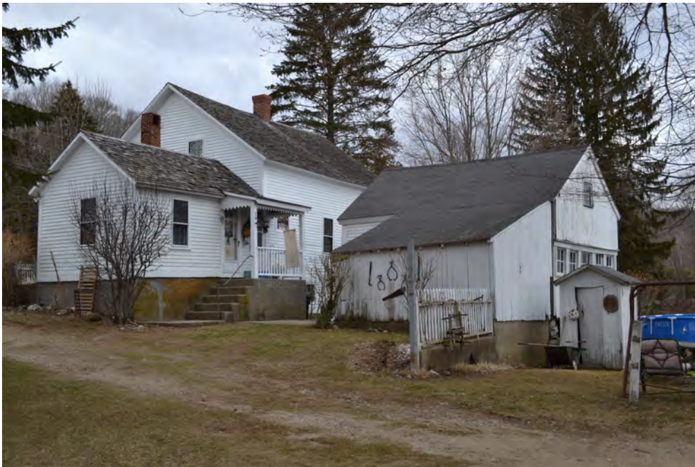
10. South eave-side and west gable-end of Farmhouse, west eave-sides and south gable-ends of Button shop, and west gable-end and south eave-side of Privy, camera facing northeast.