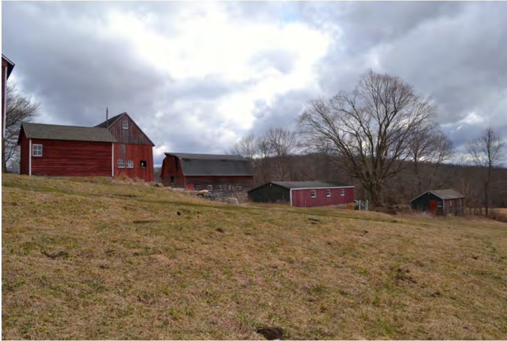
7. Northwest context view of 112 Kick Hill Road, Lebanon, CT, camera facing southeast. From left to right, Milk house, Horse barn, Barn II, Chicken coop I, Chicken coop II.