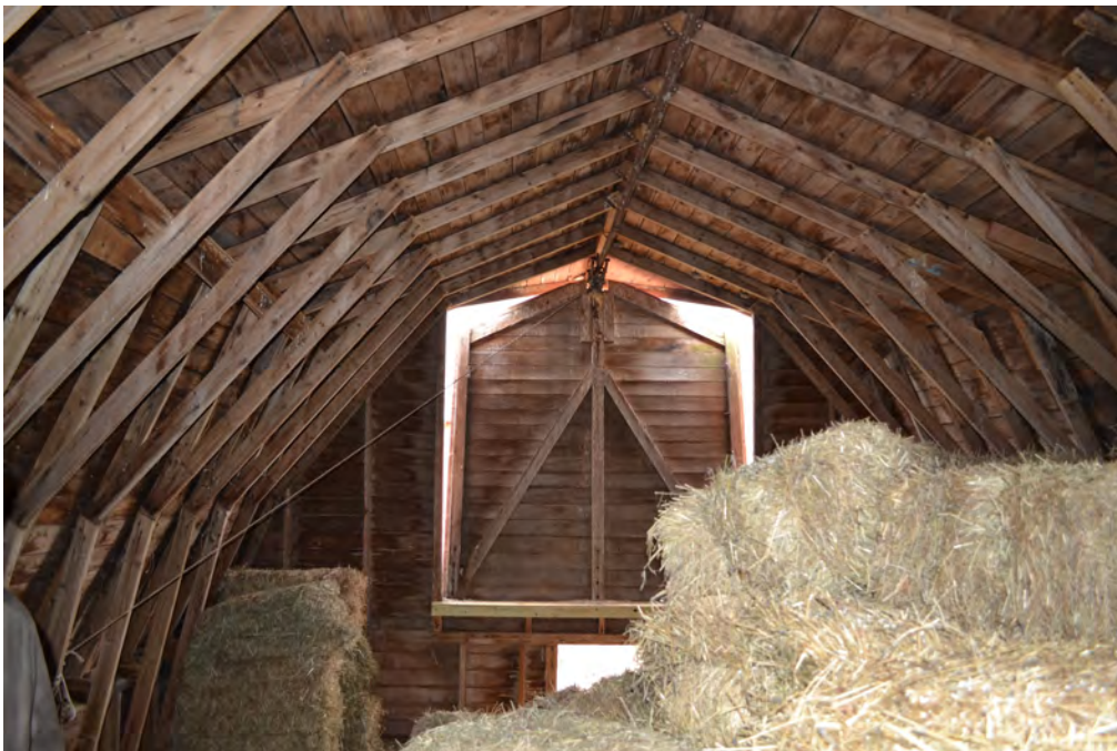
36. Interior view of Barn II loft level, showing framing and hay door details, camera facing north. Note balloon framing, hay track along ridge-line.