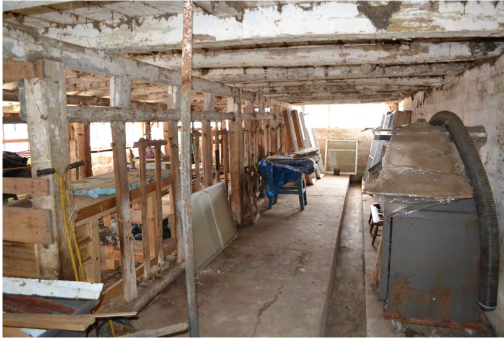
27. Interior view of Barn I lower level, showing framing and floor details, camera facing west. Note mixed hand-hewn and sawn posts, girders, and joists, frame stanchions, poured concrete floor with manure gutter.