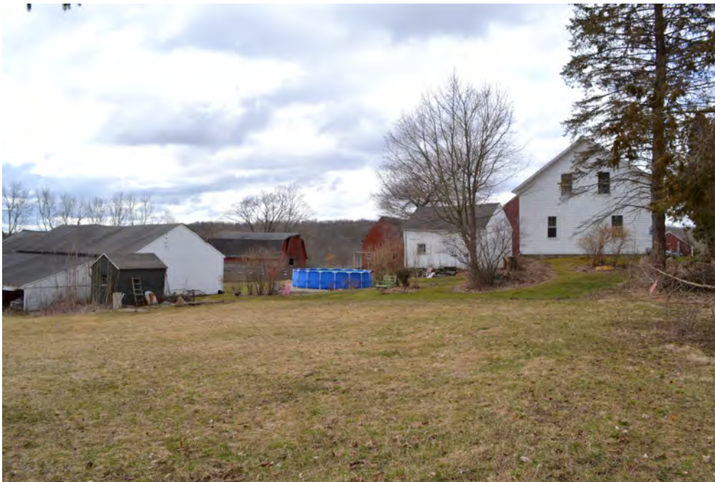
8. East context view of 112 Kick Hill Road, Lebanon, CT, camera facing west. From left to right, Well house, Wagon shed II, Barn II, Horse barn, Button shop, Barn I, Farmhouse, Wagon shed I.