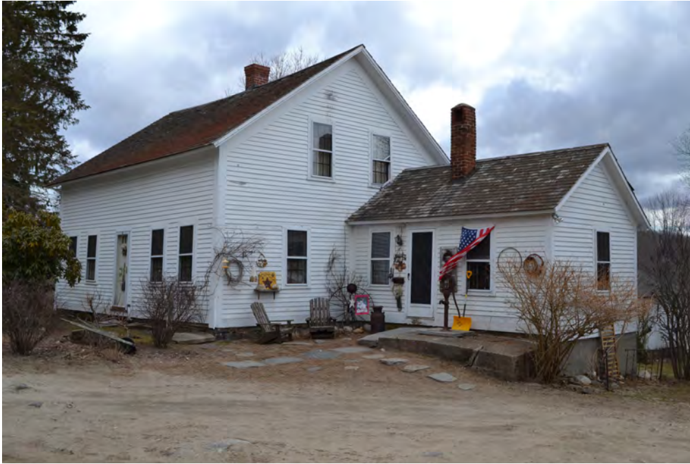
9. North eave-side and west gable-end of Farmhouse, camera facing southeast.