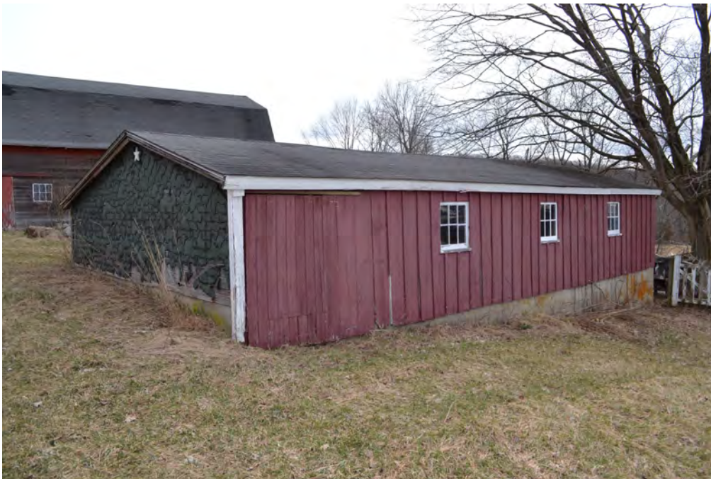
18. West eave-side and north gable-end of Chicken coop I, camera facing southeast. Note Barn II at rear left.