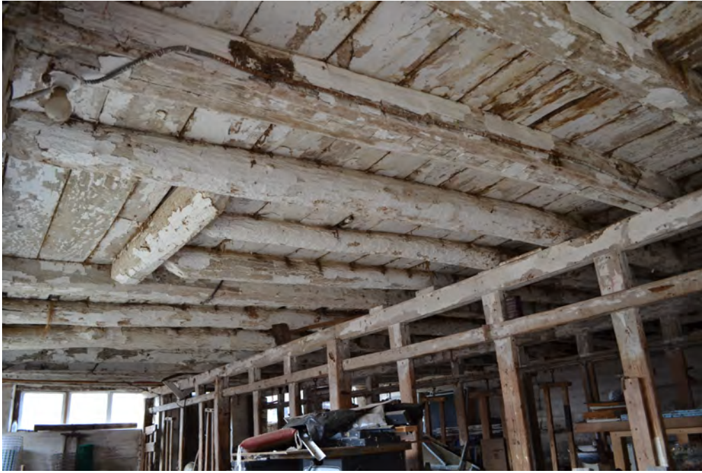
29. Interior view of Barn I lower level, showing framing details, camera facing northwest. Note sawn posts and girder, and hand-hewn joists.