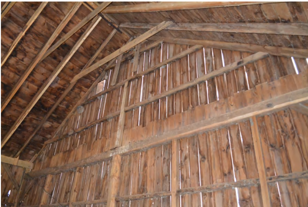
24. Interior view of Barn I main level, showing west gable-end framing details, camera facing southwest. Note mixed hand-hewn and sawn posts and girts, sawn braces, vertical board siding, horizontal board roof sheathing.