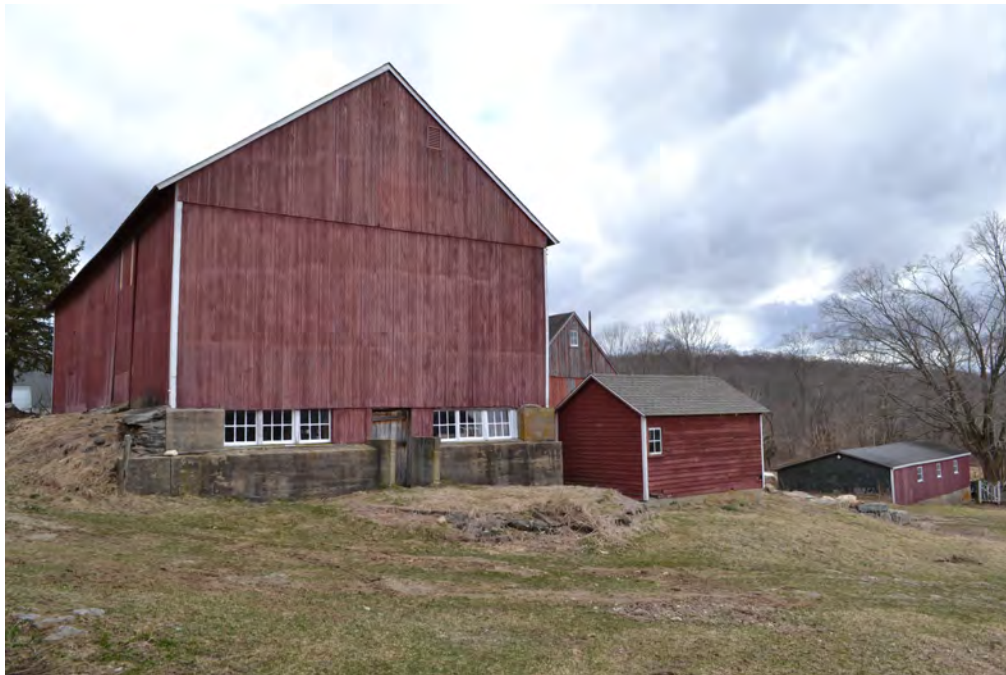
22. North eave-side and west gable-end of Barn I, camera facing southeast. Note silo foundation at center, Milk house, Horse barn, and Chicken coop I at right.