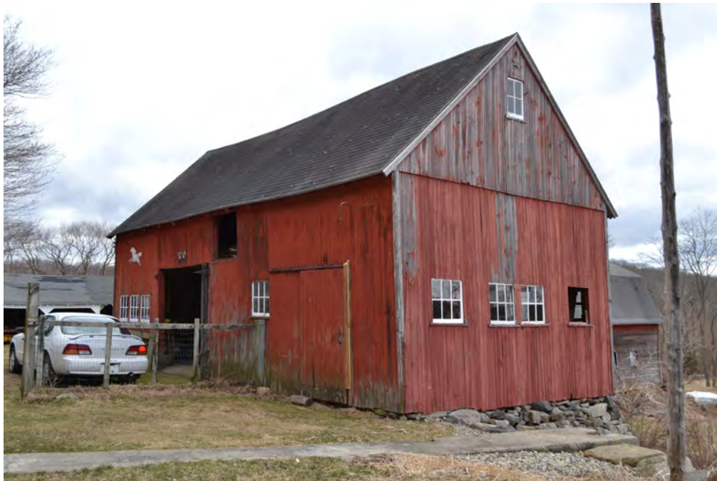
16. North eave-side and west gable-end of Horse barn, camera facing southeast. Note Wagon shed II at rear left, Barn II at rear right.