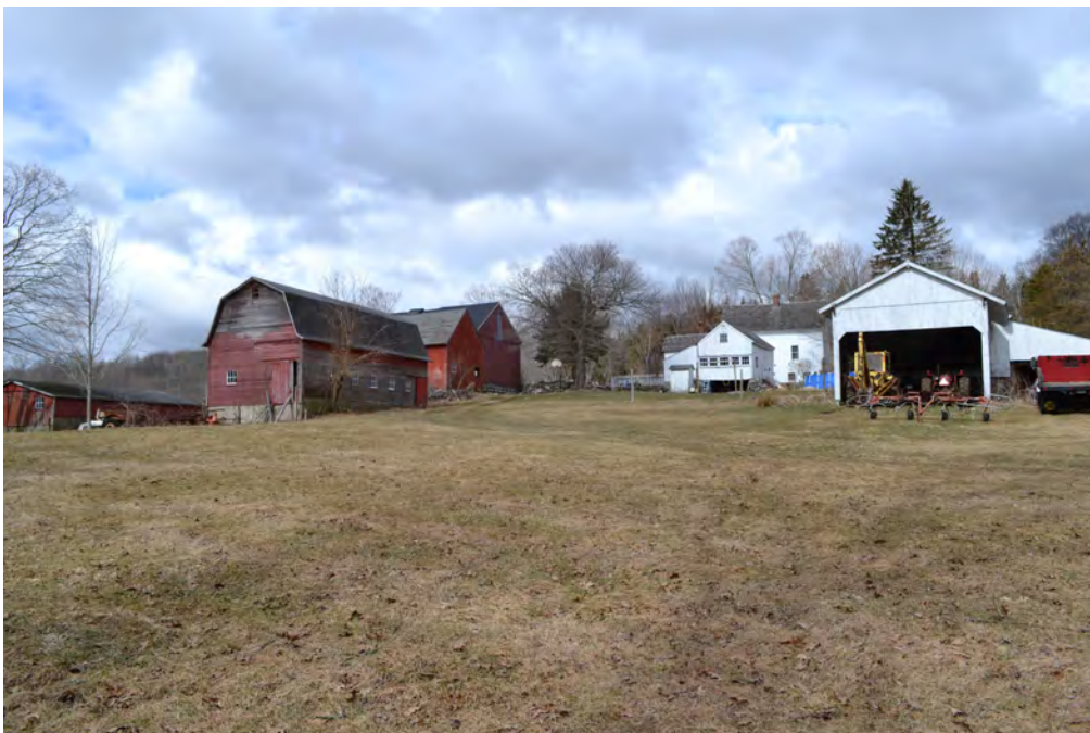
6. Southeast context view of 112 Kick Hill Road, Lebanon, CT, camera facing northwest. From left to right, Chicken coop I, Barn II, Horse barn, Barn I, Privy, Button shop, Farmhouse, Wagon shed II.