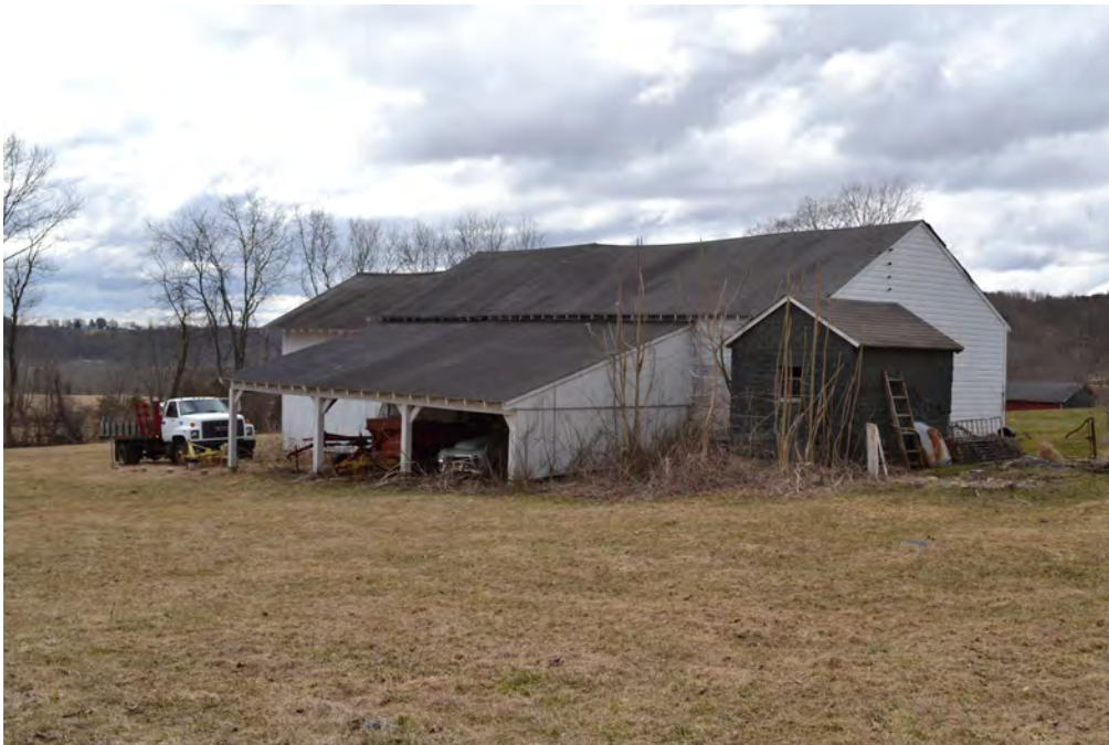
12. East gable-end and north eave-side of Well house and east eave-sides and north gable-ends of Wagon shed II, camera facing southwest.