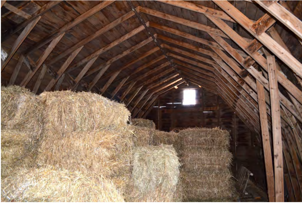
35. Interior view of Barn II loft level, showing framing details, camera facing south. Note balloon framing, hay track along ridge-line.