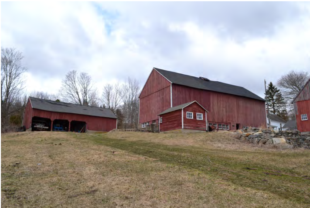
14. West gable-end and south eave-side of Wagon shed I, west eave-side and south gable-end of Milk house, and west gable-end and south eave-side of Barn I, camera facing northeast.