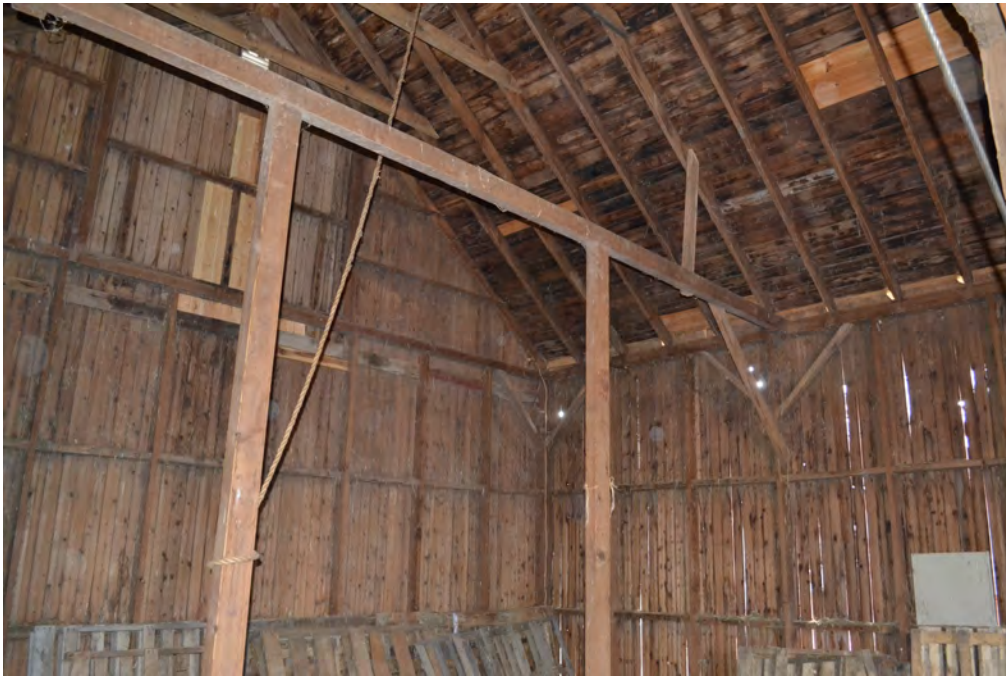
25. Interior view of Barn I main level, showing framing details of two-bay eastern addition, camera facing southeast. Note balloon frame construction with sawn timbers.