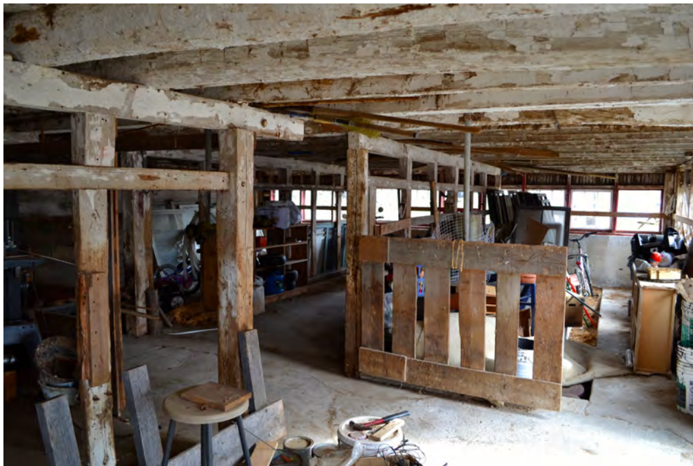
28. Interior view of Barn I lower level, showing framing and floor details, camera facing northeast. Note mixed hand-hewn and sawn posts, girders, and joists, poured concrete floor with manure gutter.