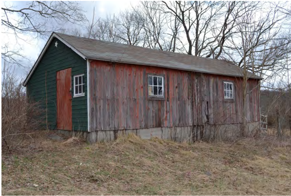
19. West eave-side and north gable-end of Chicken Coop II, camera facing southeast.