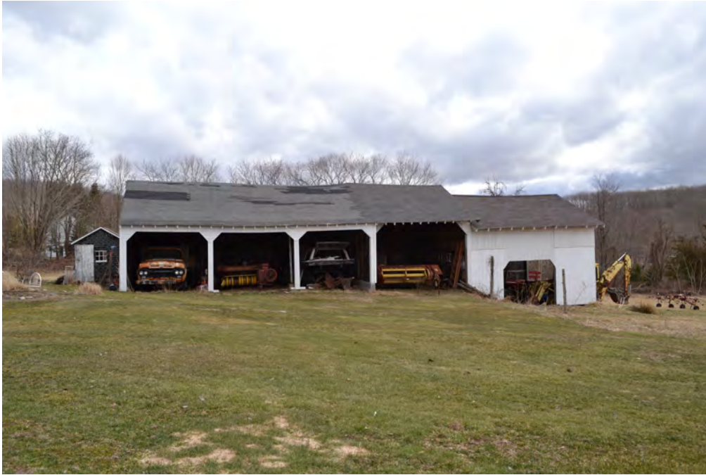
11. West gable-end of Well house and west eave-side of Wagon shed II, camera facing east.