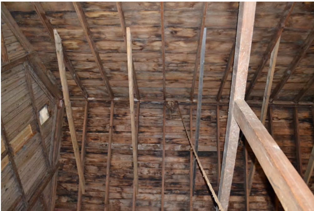
26. Interior view of Barn I main level, showing roof details of two-bay eastern addition, camera facing southeast. Note rope extending to hay track, later rater ties.