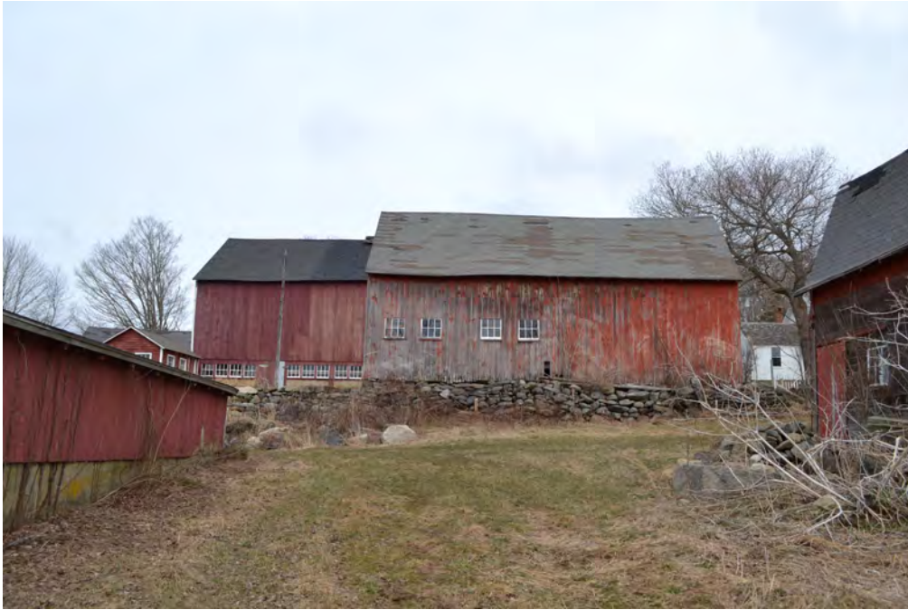
17. South eave-side of Horse barn, camera facing north. Note Chicken coop I, Milk house, and Barn I at left, Barn II at right.