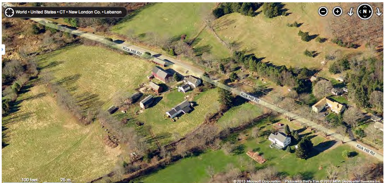
2. East view – aerial “bird’s-eye” map of 112 Kick Hill Road, Lebanon, CT