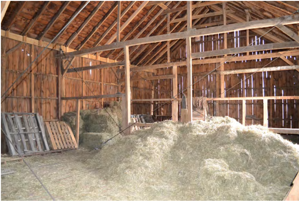
23. Interior view of Barn I main level, showing framing details, camera facing southwest. Note mixed hand-hewn and sawn posts and girts, sawn braces, and cable supports.