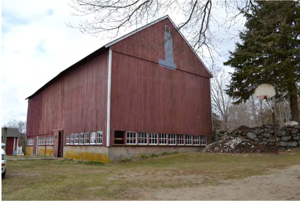
21. South eave-side and east gable-end of Barn I, camera facing northwest.