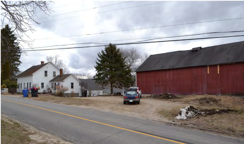
5. Northwest context view of 112 Kick Hill Road, Lebanon, CT, camera facing southeast. From right to left, Barn I, Button Shop, Farmhouse.