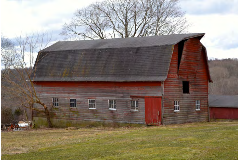
31. North gable-end and east eave-side of Barn II, camera facing southwest. Note hay door under projecting hood.