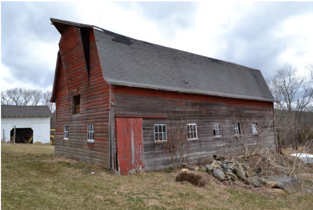
32. North gable-end and west eave-side of Barn II, camera facing southeast. Note hay door under projecting hood.