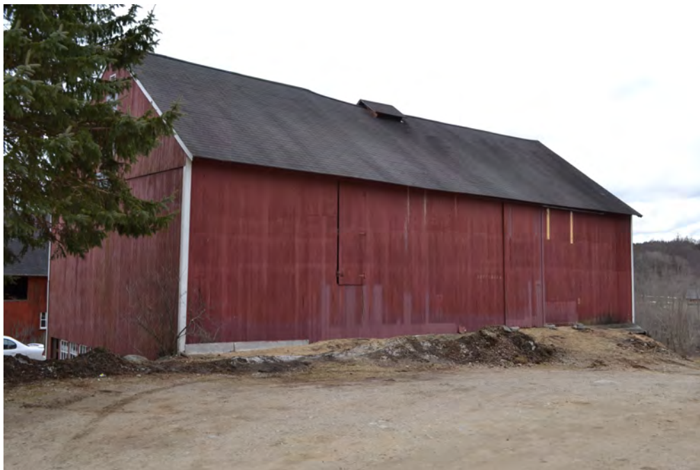
20. North eave-side and east gable-end of Barn I, camera facing southwest.