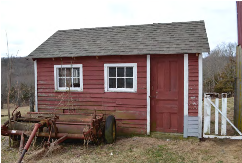
15. East eave-side of Milk house, camera facing west.