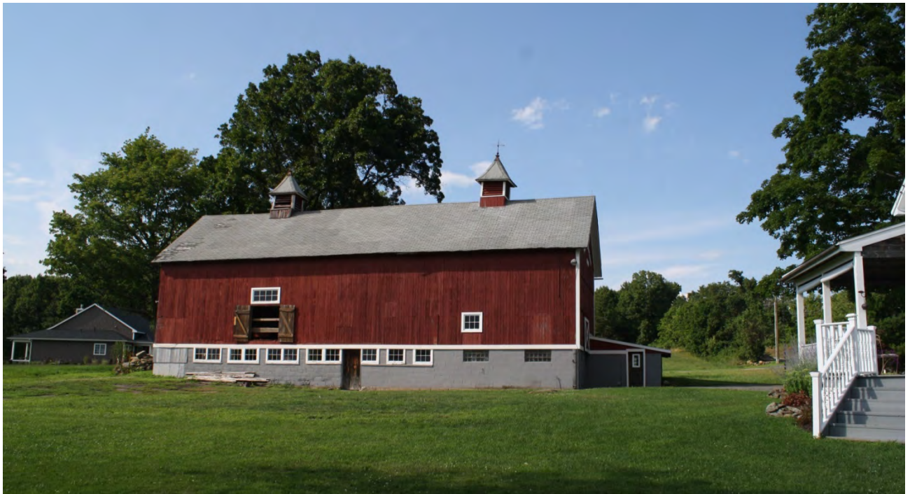
18. South view of barn, camera facing north. At left rear is a new home recently constructed on the adjacent lot; at right the western porch of the Farmhouse.