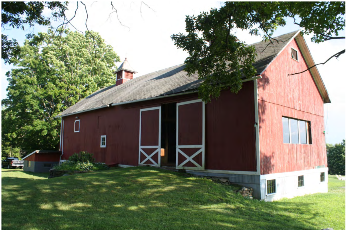
6. Northwest view of Barn, camera facing southeast.