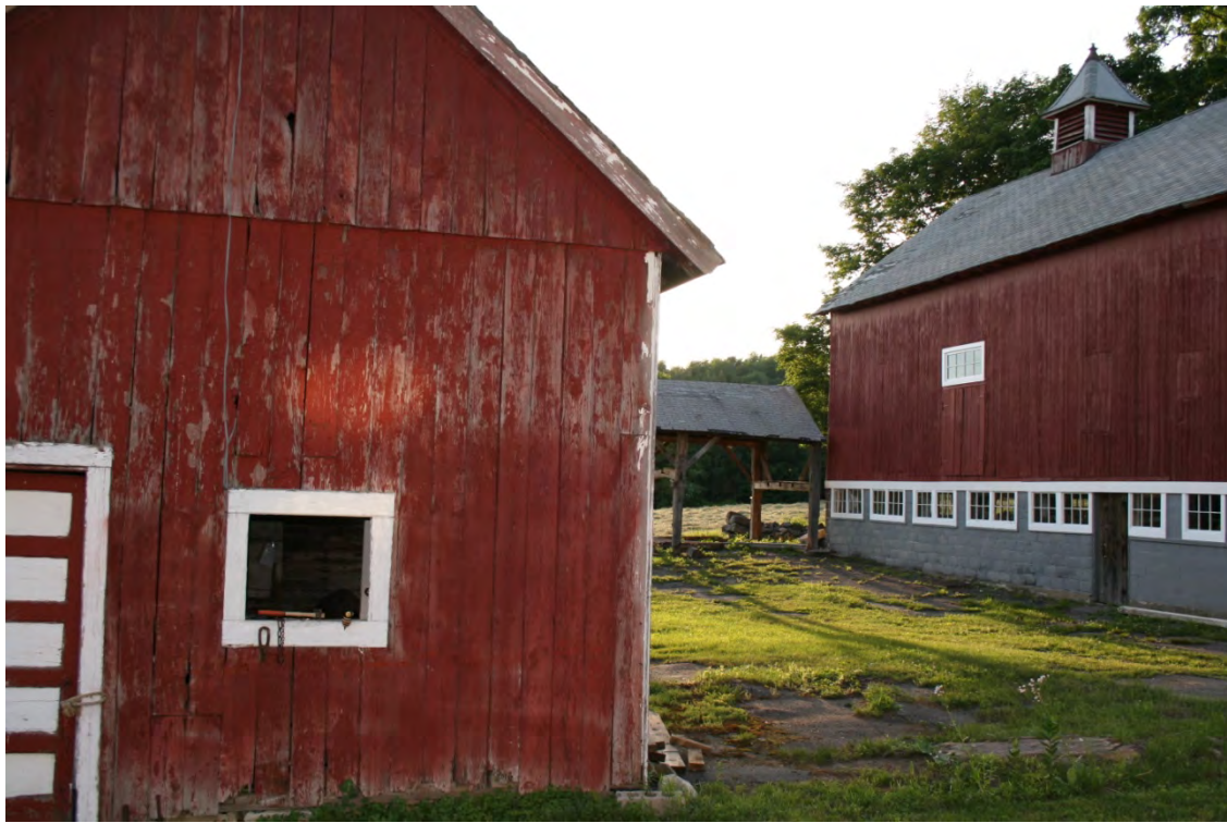
9. East view of barnyard prior to demolition of south and west structures and repair of main barn foundation, camera facing west.