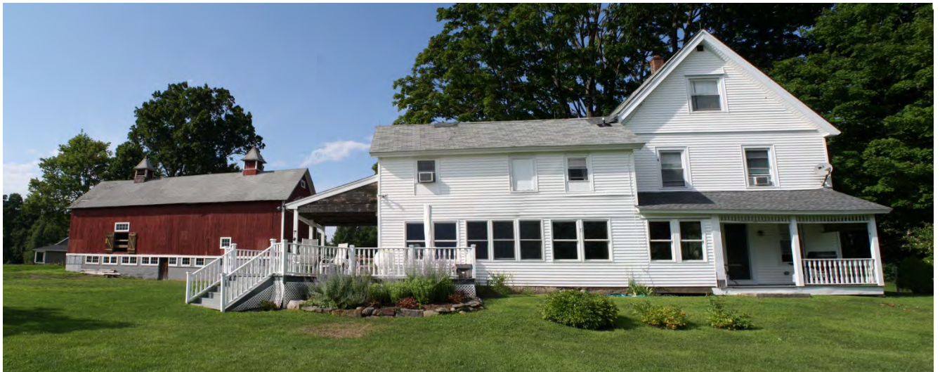
4. South view of Barn (left rear) and Farmhouse, camera facing north.