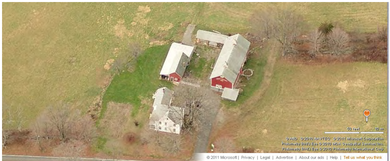
2. Southwest view – aerial “bird’s-eye” map of 505 University Drive, Torrington CT – http://www.bing.com/maps accessed 6/21/2011. View shows the farmstead prior to the demolition of the south and west structures. Note the circular silo foundation at right (north) side of the main barn.