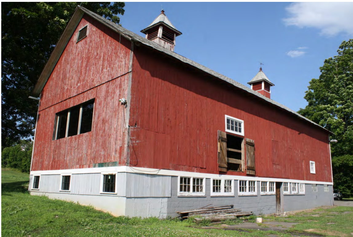
8. Southwest view of Barn, camera facing northeast.