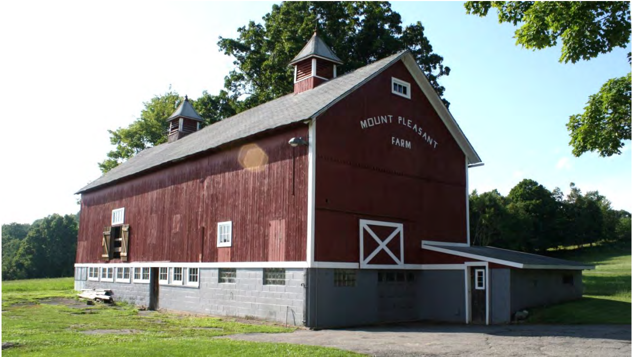
7. Southeast view of Barn, camera facing northwest.