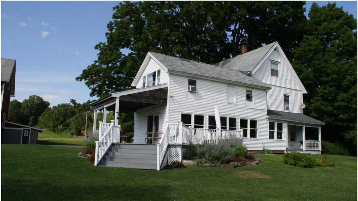
5. Southwest view of Farmhouse, camera facing northeast.