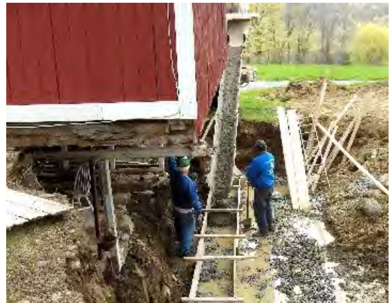
10a-b. Views of west end and northwest corner of Barn during foundation repair work. Note former areaway access to basement level at west side.