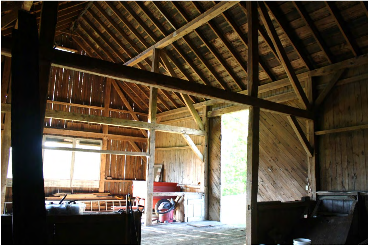
11. Interior view of western three bays, camera facing northwest.