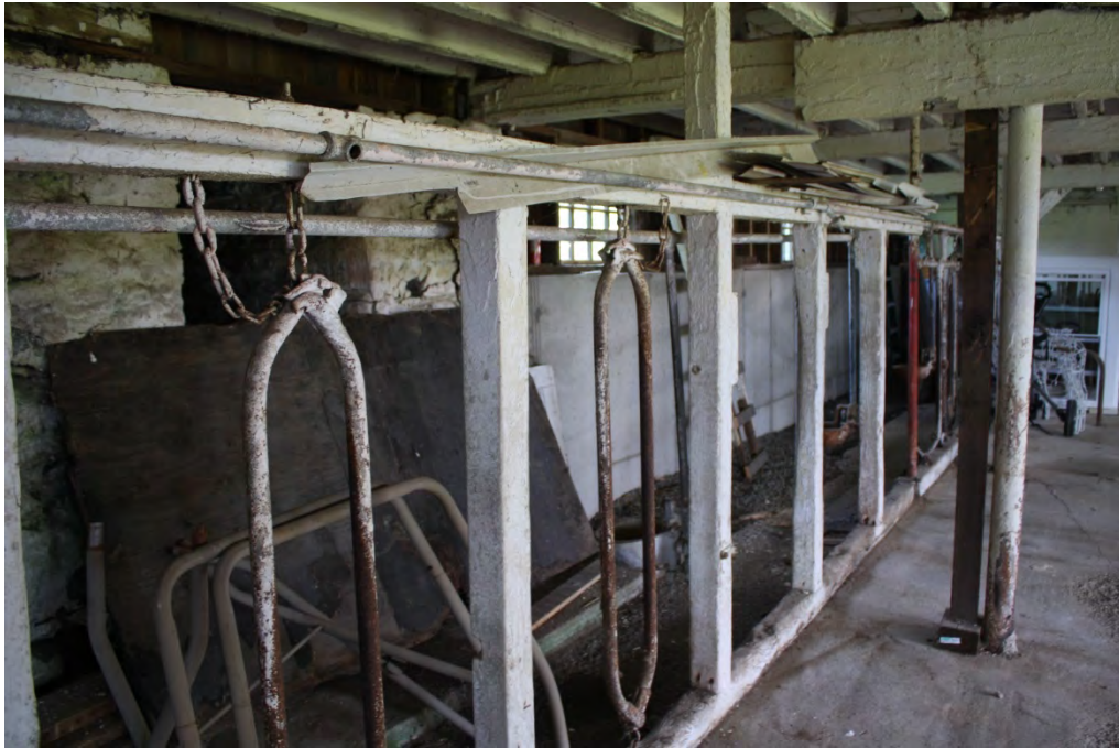
17. Interior view of basement cow stanchions, camera facing northeast. Note portion of original fieldstone north wall at left rear, new concrete wall at center rear.