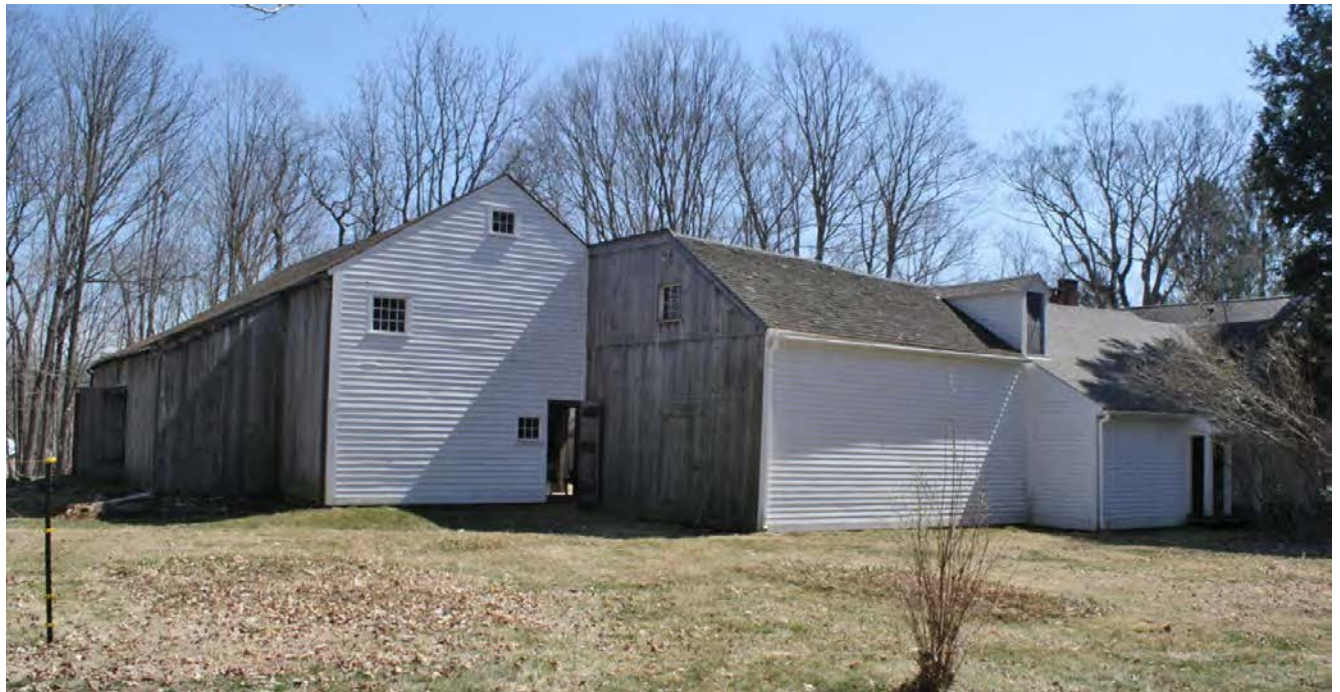
13. Northwest view of Barn with west side of Carriage barn at right, camera facing southeast.