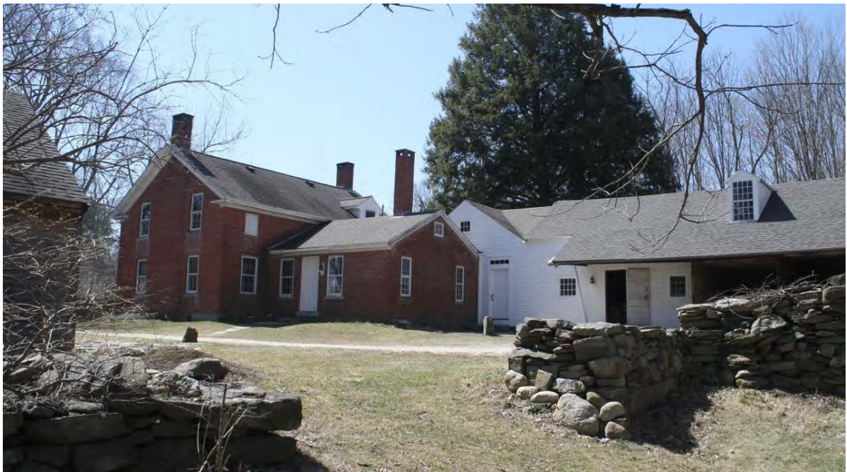
9. Northeast view of Farmhouse with Summer kitchen at center rear and Carriage barn at right, camera facing southwest.