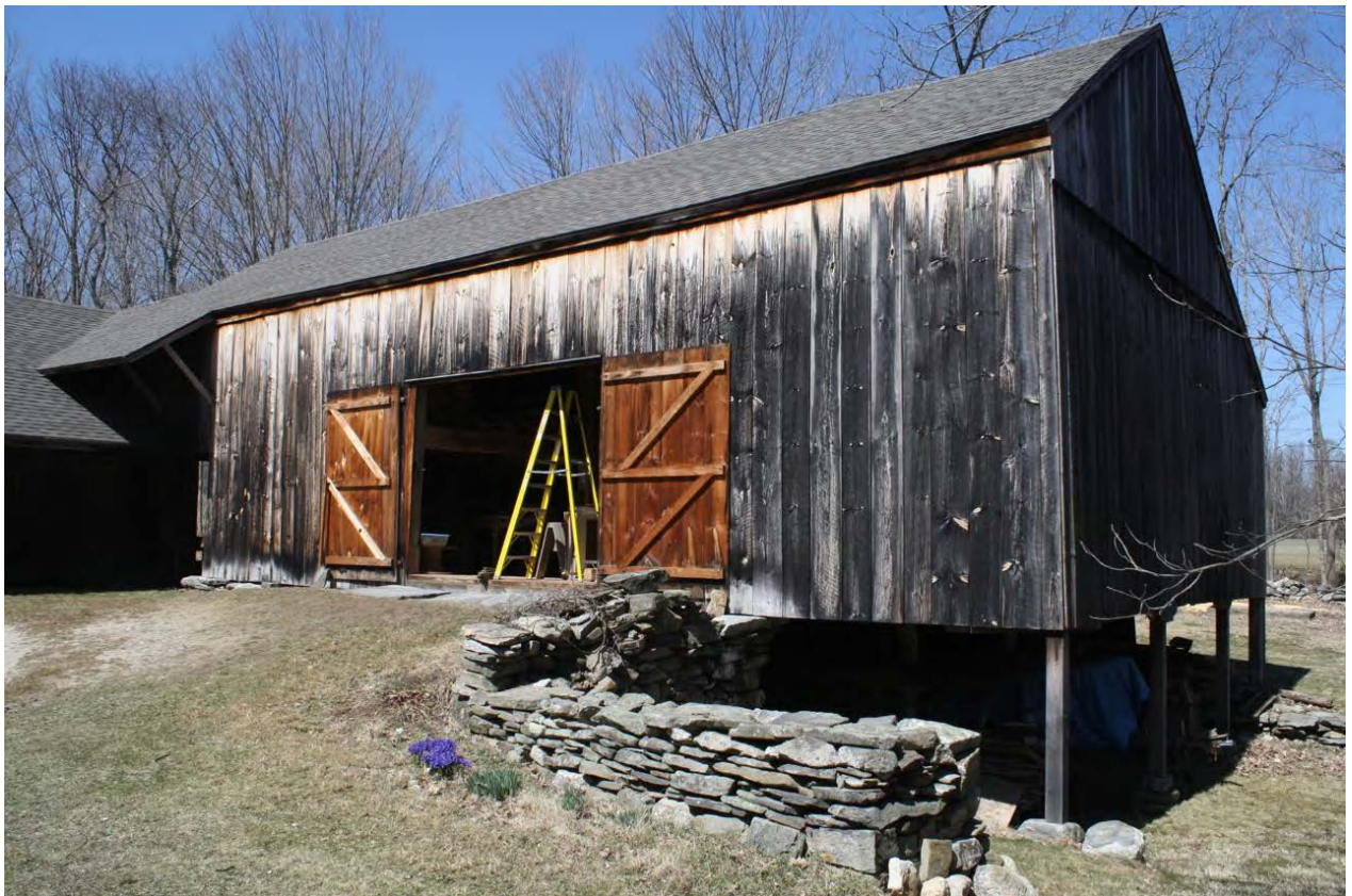
11. Southeast view of Barn, camera facing northwest.