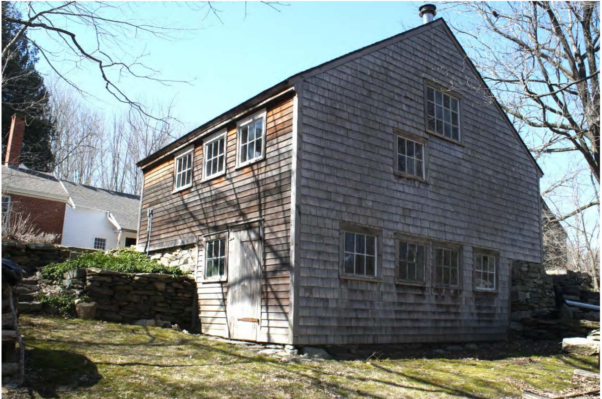
8. Southeast view of Blacksmith shop, camera facing northwest.