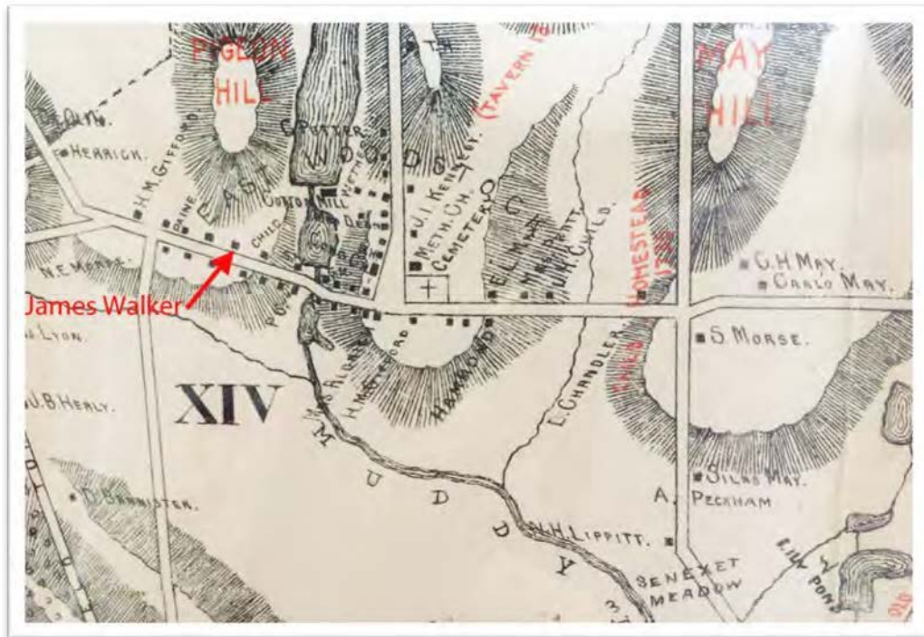
22. Detail view of 1883 Lester wall map showing East Woodstock, courtesy of Woodstock Historical Society.