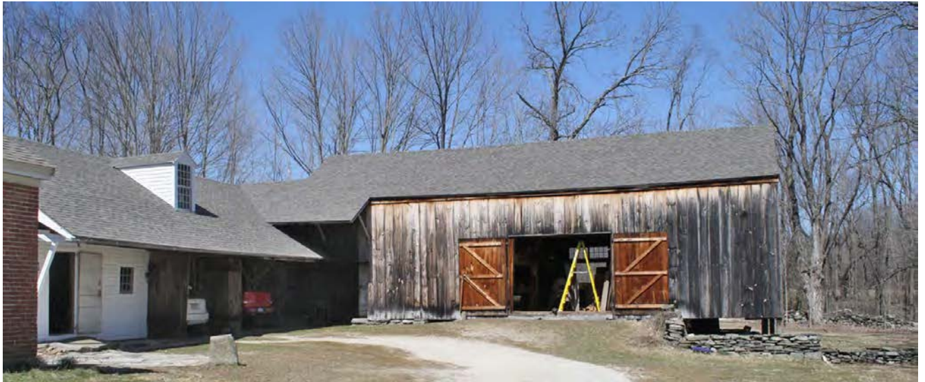
10. Southeast view of Carriage barn and main Barn, camera facing north.