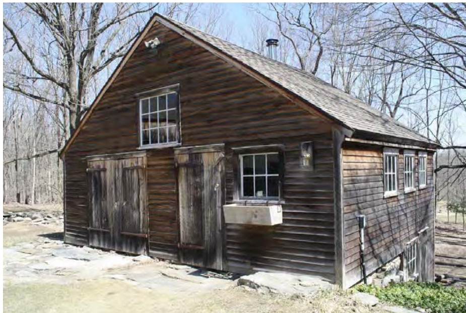
7. Southwest view of Blacksmith shop, camera facing northeast.