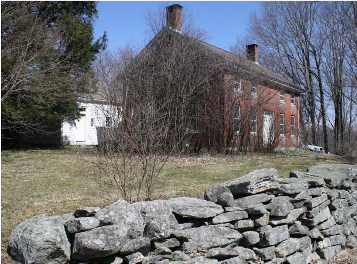
6. Southwest view of Farmhouse with summer kitchen at left rear, camera facing northeast.