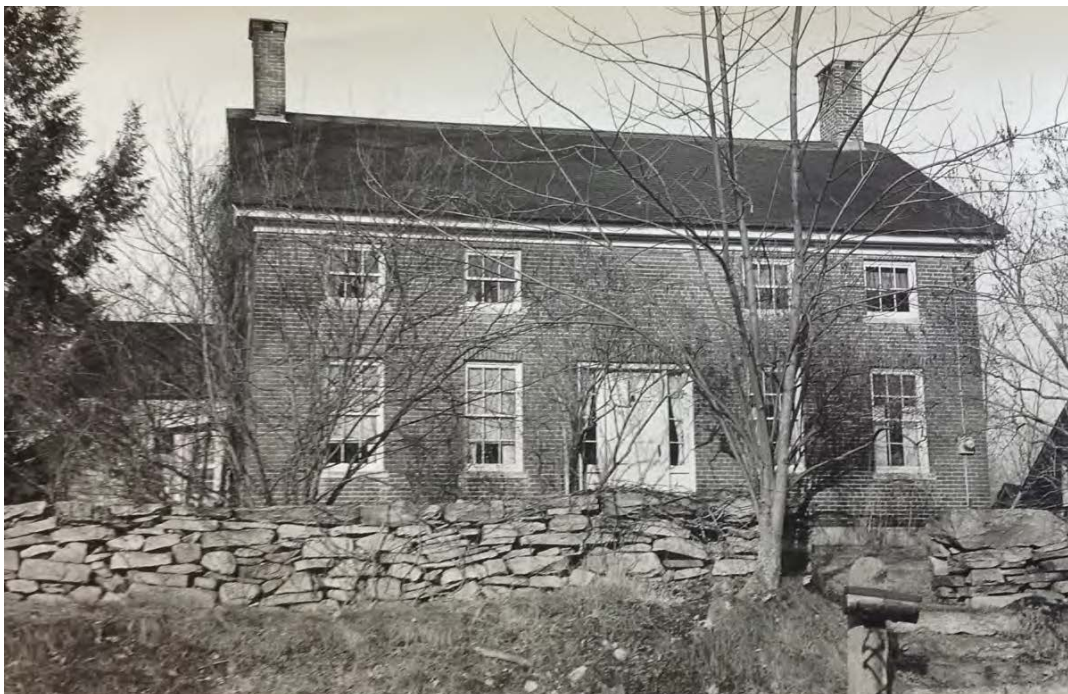
21. South view of Farmhouse taken in 1975 for Woodstock Bicentennial survey, courtesy of Woodstock Historical Society.