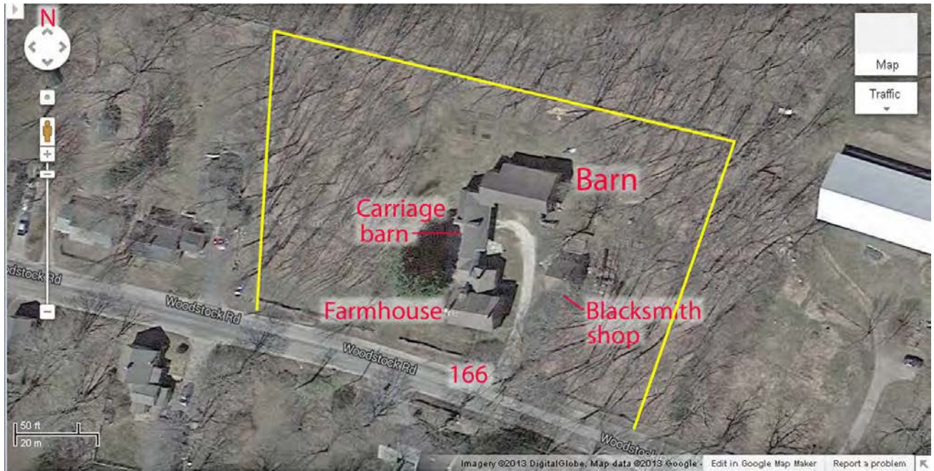
4. Detail Site Plan Sketch showing contributing resources .