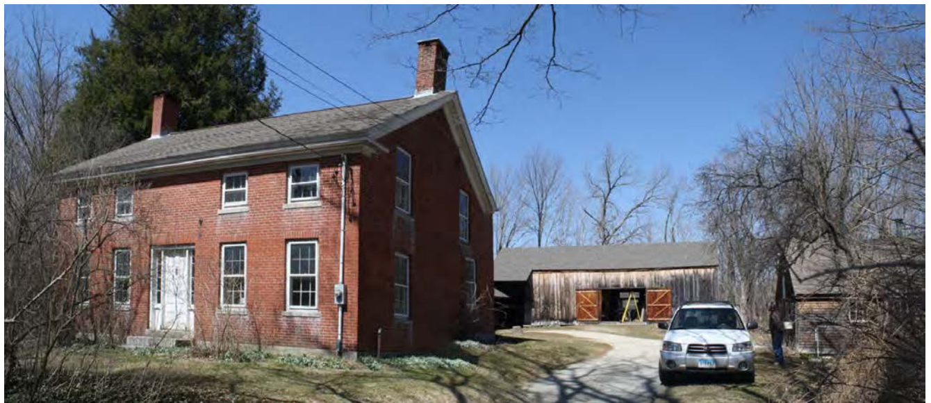
5. South context view of 166 Woodstock Road, Woodstock CT, camera facing north; from left to right are the Farmhouse, Barn, and Blacksmith shop.