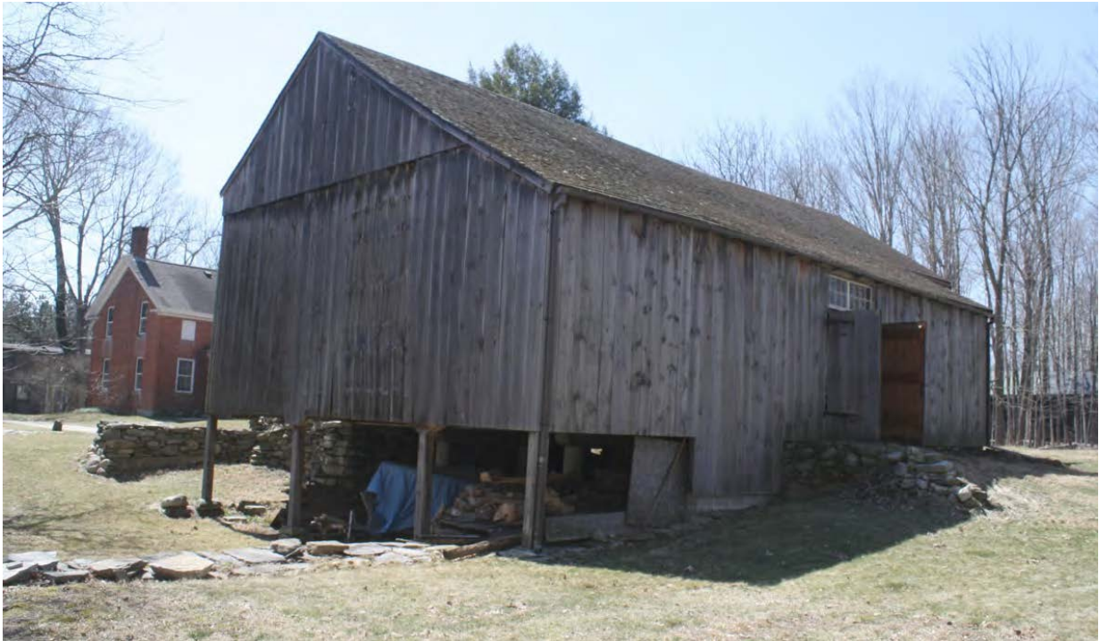
12. Northeast view of Barn showing open banked basement and saltbox-roofed shed addition, camera facing southwest. Farmhouse is at left rear.