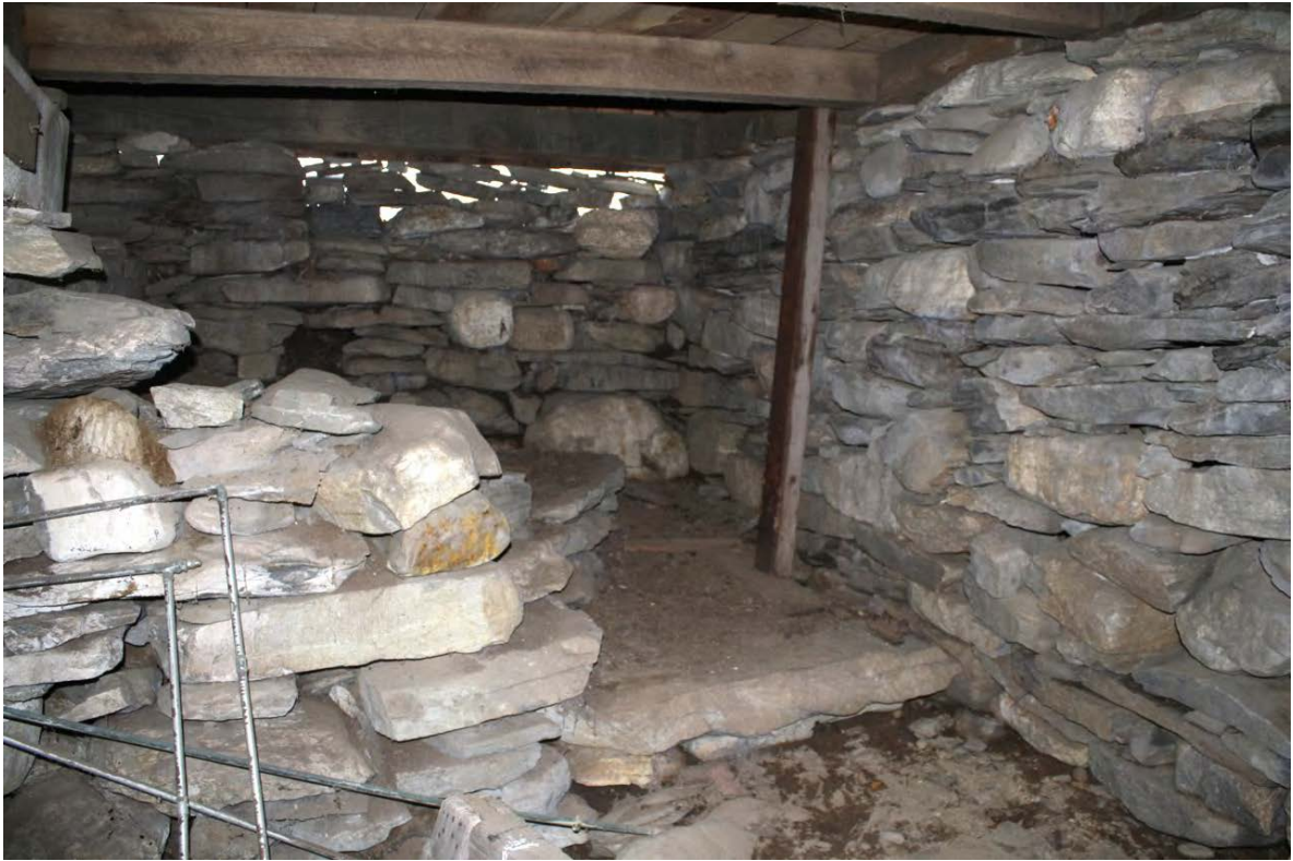
20. Interior view of Barn basement with cow ramp, camera facing northwest.